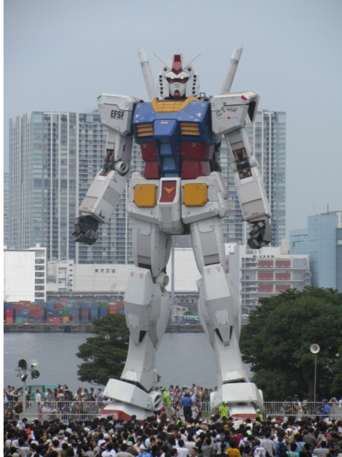
Figure 6. Gundam statue in Odaiba, Japan

http://www.sakura-hostel.co.jp/blog/Odaiba_Gundam_20090823%20big%20best.jpg