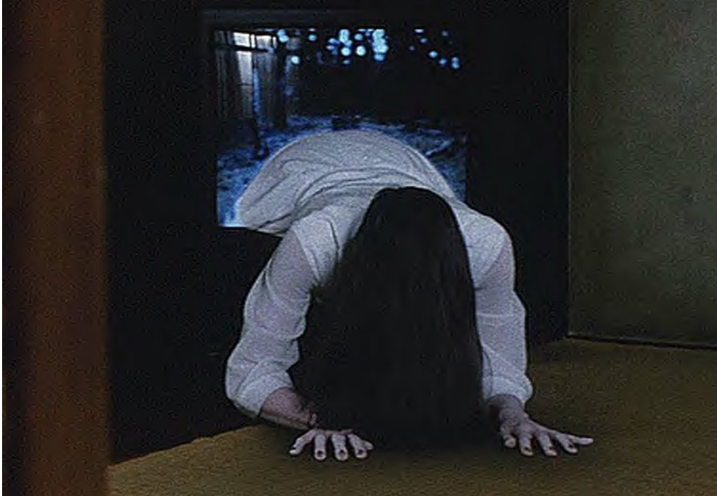
Figure 17. Ringu : bridging the gap between two worlds.

http://womenwriteaboutcomics.com/2014/10/26/the-scariest-movie-of-my-life-ringu/