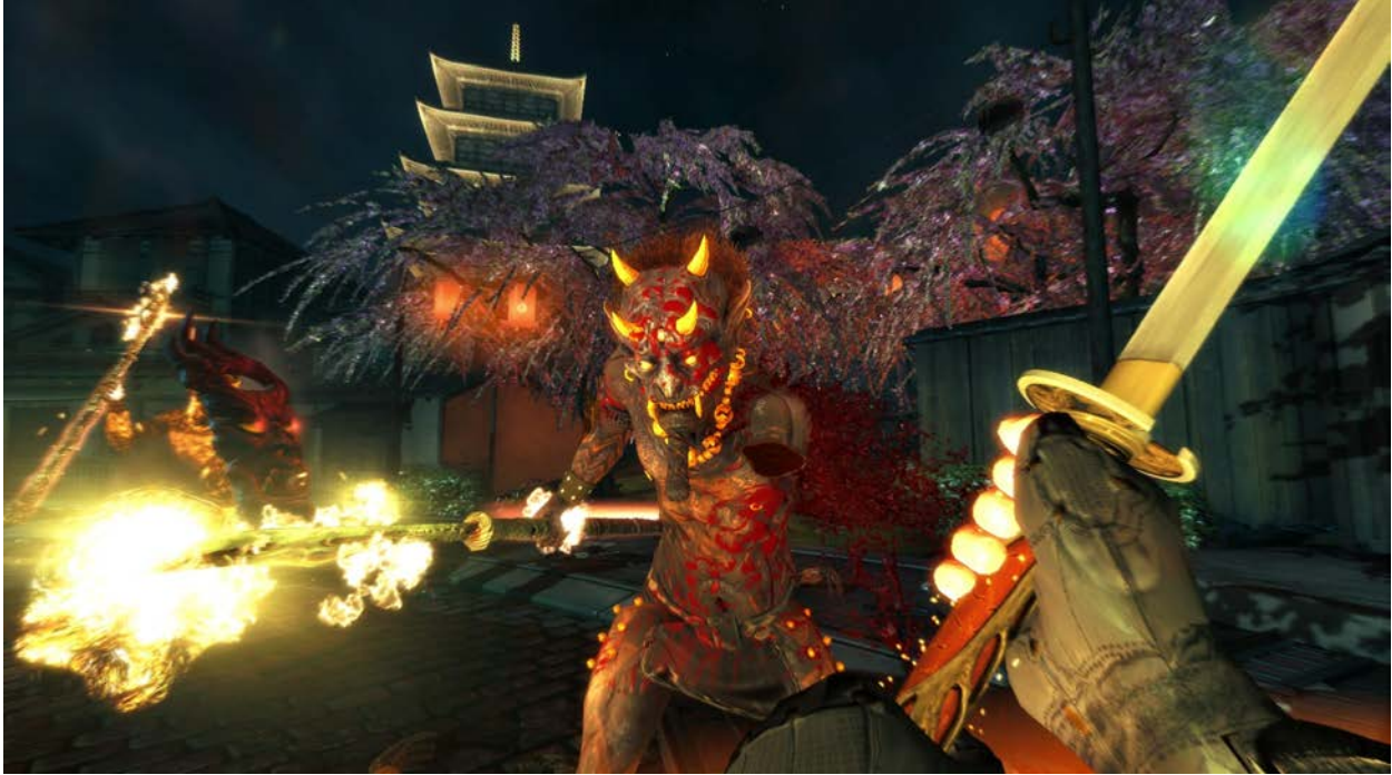
Figure 22. Shadow Warrior : first-person Japanese swordplay

http://assets.vg247.com/current//2013/08/shadow_warrior_2013_01.png