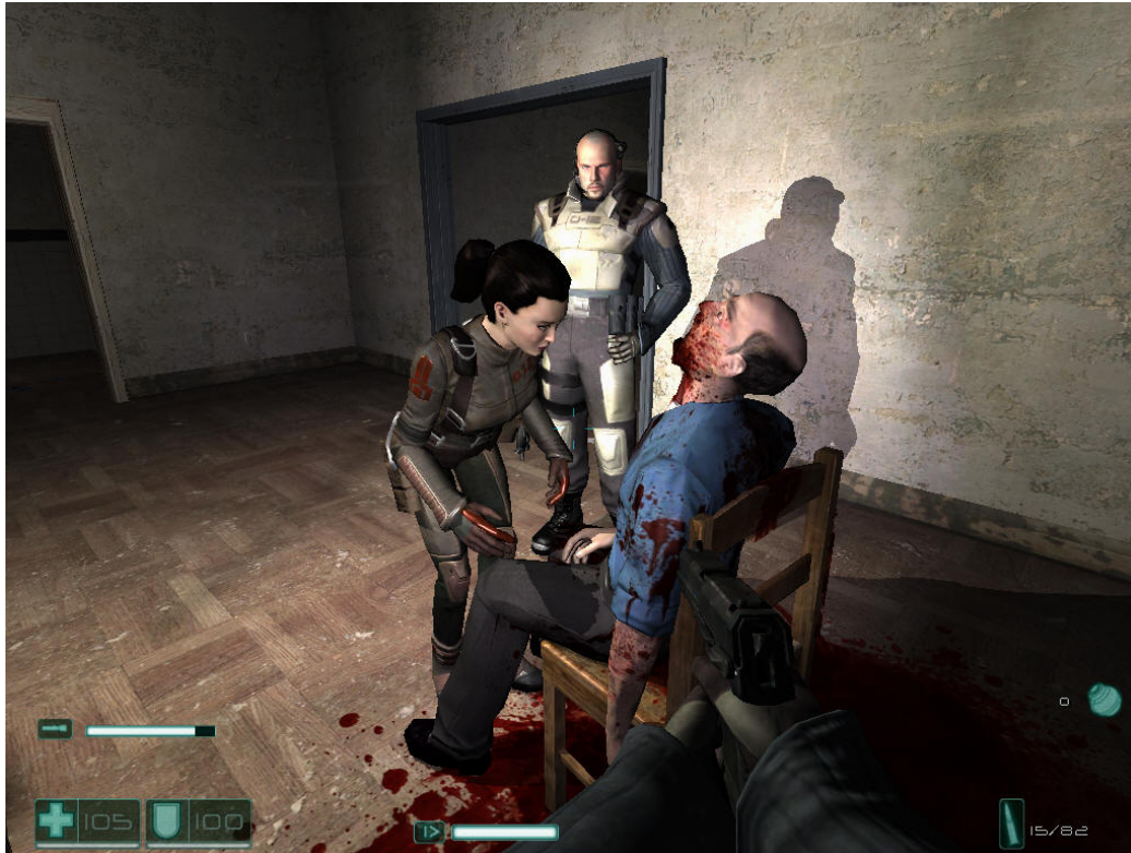
Figure 18. Investigating a cannibalistic murder in F.E.A.R.