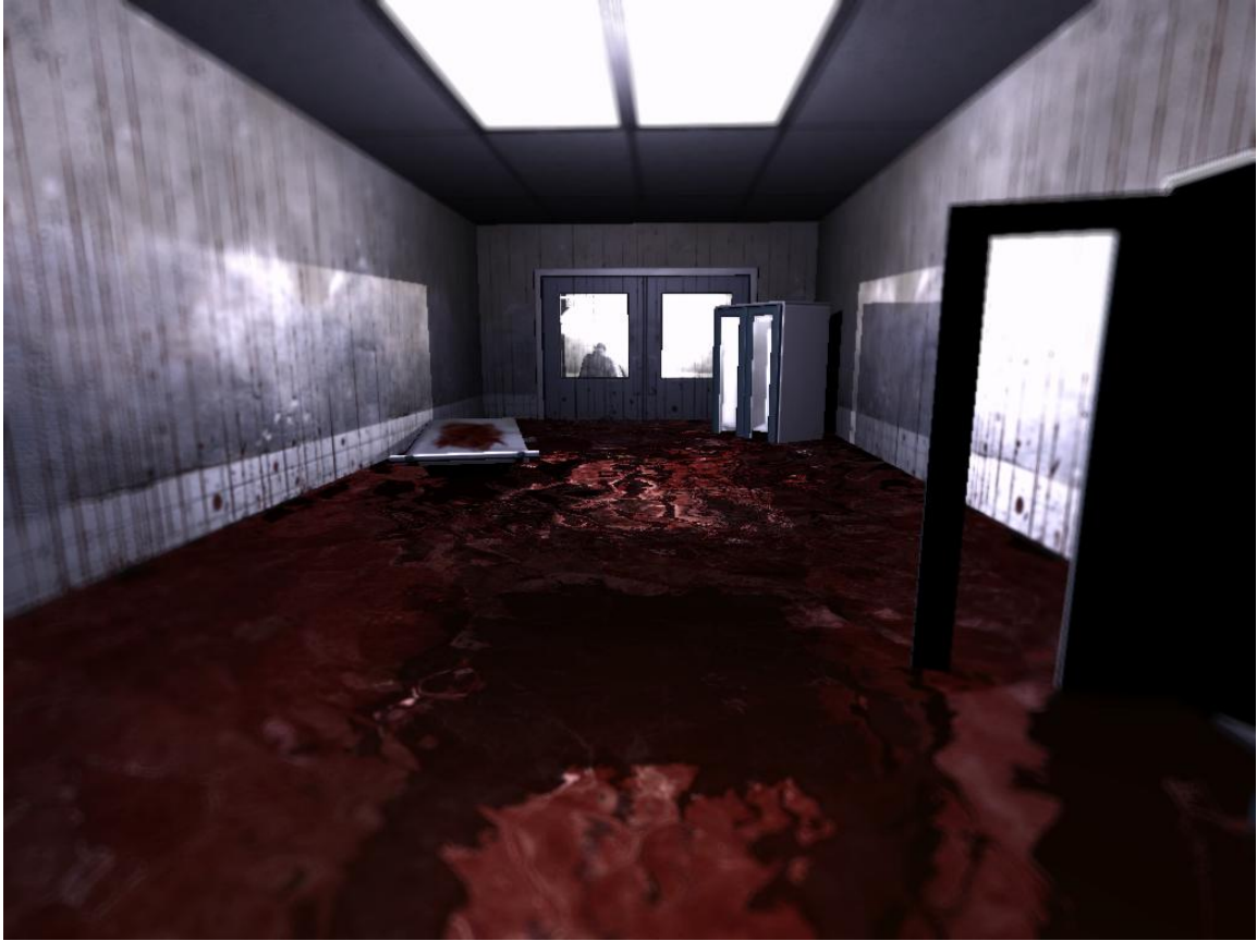
Figure 21. Disturbing visions created by Alma abound in F.E.A.R.

http://www.giantbomb.com/fear-first-encounter-assault-recon/3030-4800/