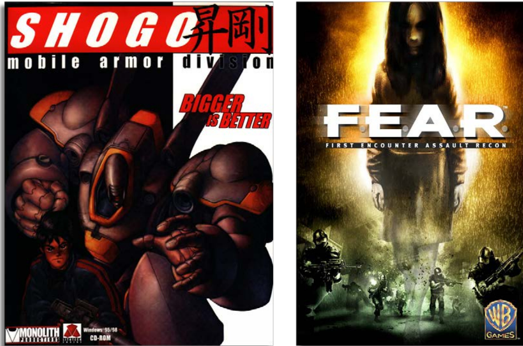
Figure 1. Box art for Shogo and F.E.A.R.

http://www.mobygames.com/game/shogo-mobile-armor-division/cover-art/gameCoverId,2917/