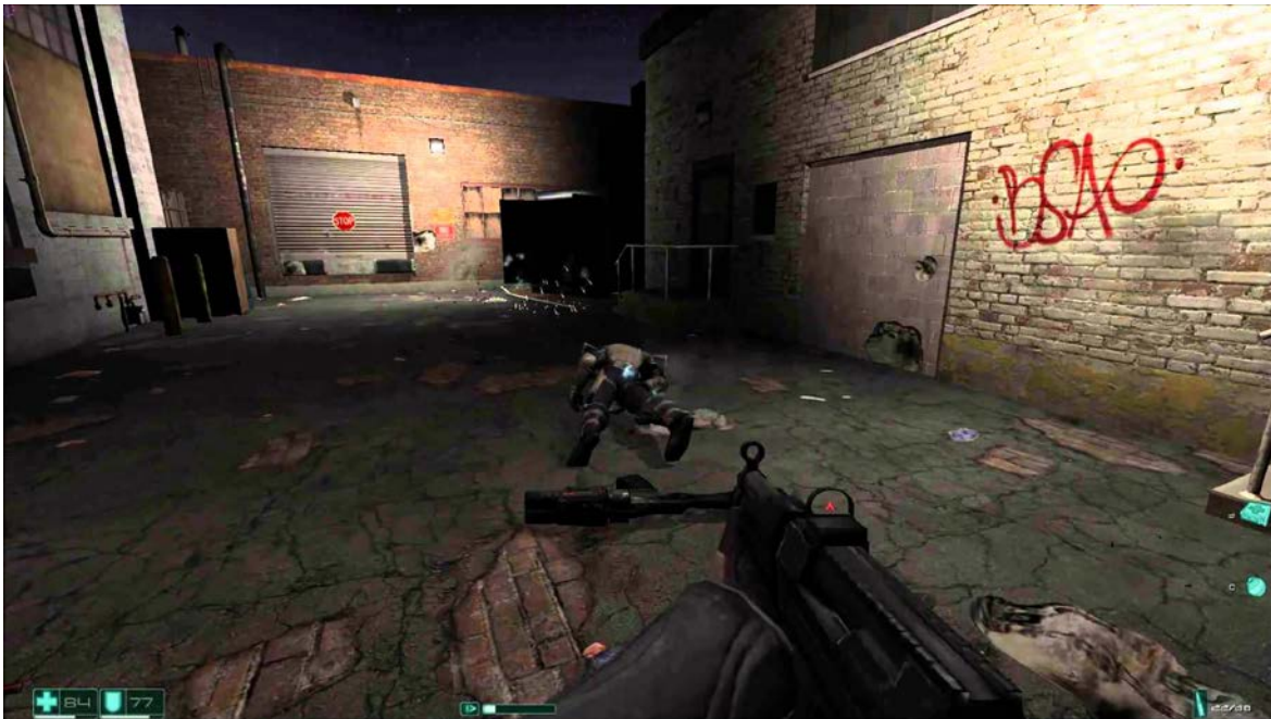
Figure 20. Auburn, the location of Alma's corrosive influence, accurately portrays the corrupted and dirty environmental aesthetics of J-horror.

http://vignette3.wikia.nocookie.net/fear/images/8/81/Auburnabandoned.jpg/revision/latest?cb=20140204024247