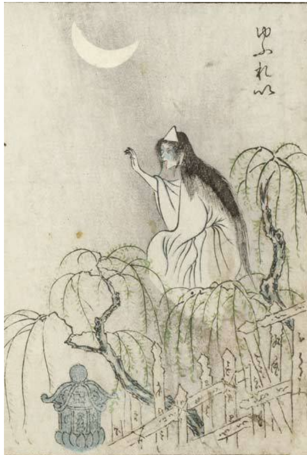
Figure 15. Yurei from Toriyama Sekein’s Hyakkai Yagyo .

The conception of these beliefs can be attributed to the combining of “Chinese ideas of demons, Indian notions of the transmigration of souls, and the native Shinto belief in nature and animal spirits, yielding a rich assortment of creatures, all of them odd, bizarre, and contrary to human notions of what is normal” (Kieje’e).