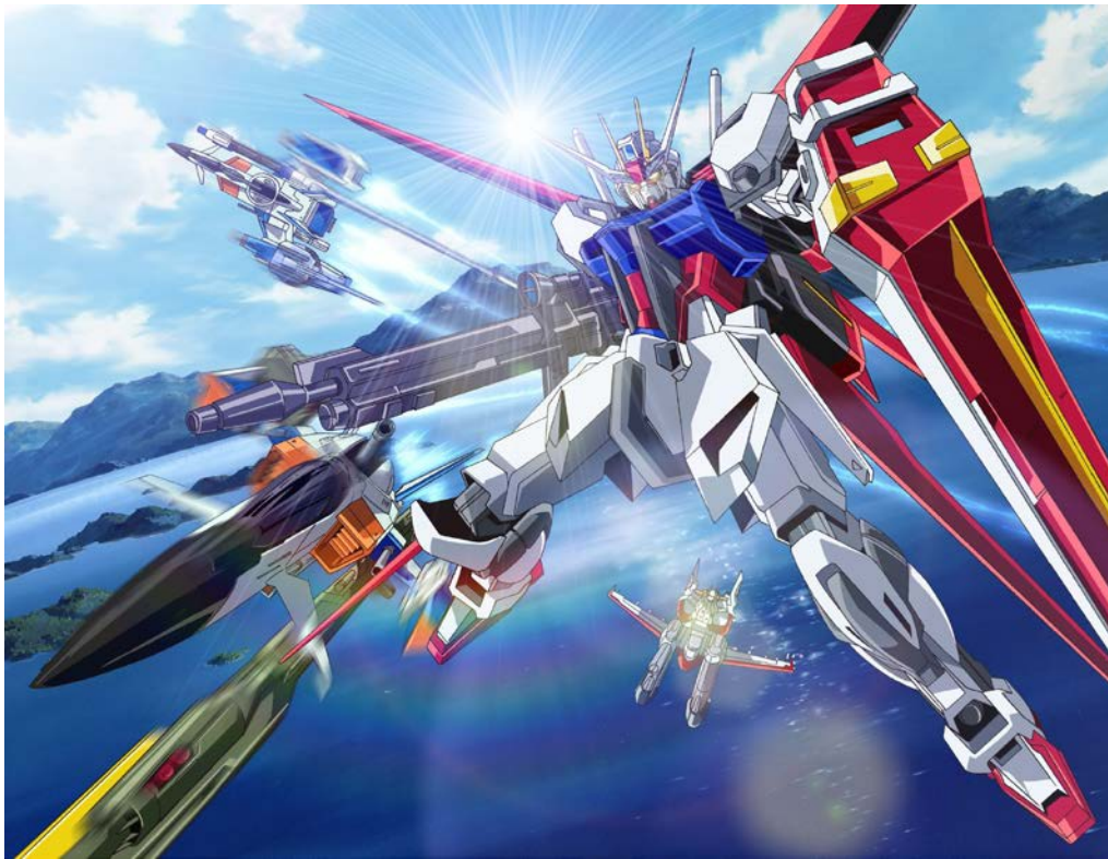
Figure 9. Mobile Suit Gundam : rewriting the mecha rulebook.