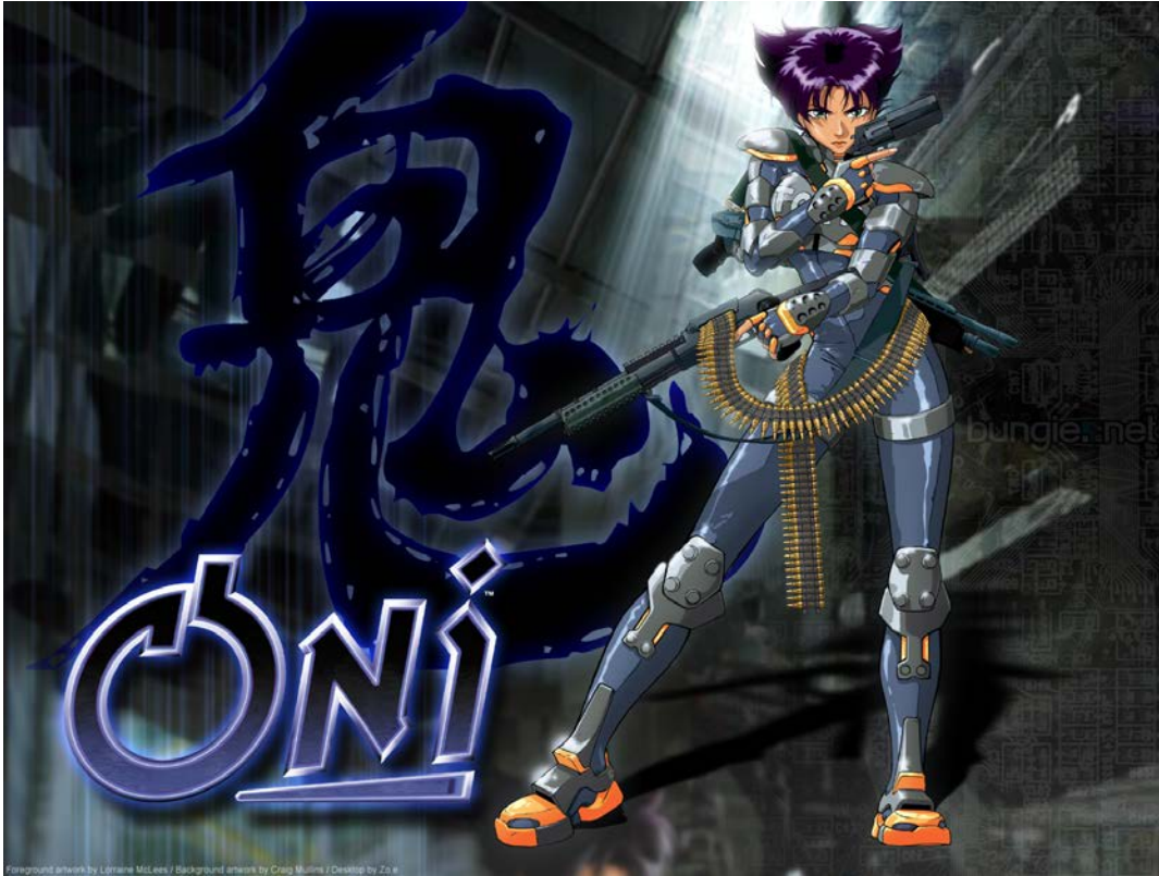
Figure 4. Oni , a Ghost in the Shell -inspired action game by Bungie of Halo and Destiny fame.

http://halo.bungie.net/images/games/Oni/wallpapers/oni_1600.jpg