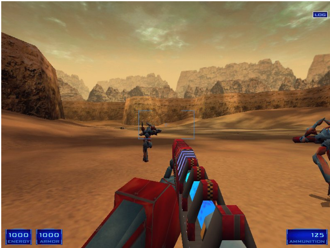
Figure 14. Traversing Cronian canyons on an MCA in Shoggoth .

http://www.forceforgood.co.uk/action/shogo-mobile-armor-division/