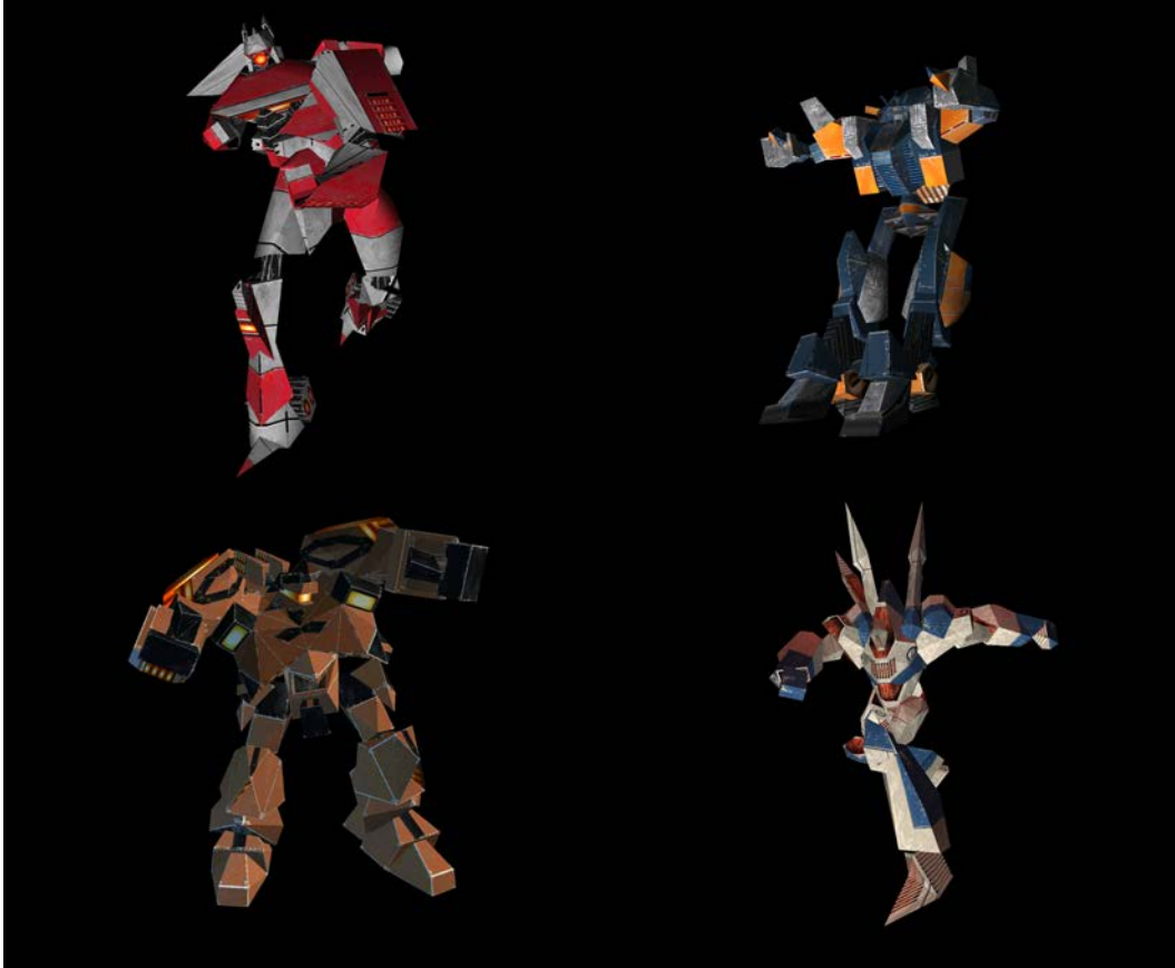
Figure 13. Shogo's mechs (clockwise): Enforcer, Ordog, Predator, and Akuma.

http://blood-wiki.org/index.php/Shogo_MCA