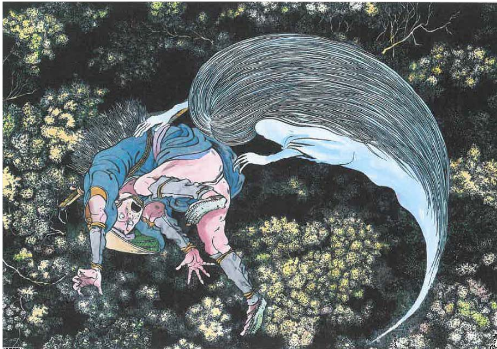
Figure 16. Chikaramochi Yurei - The Strong Japanese Ghost.

to the psychological status of the person at the moment of death, with emotions such as jealousy, love or hatred engendering a very dangerous spirit” (Serper 345-76). The latter belief deals with the materiality of spirits and how they can bridge the gap between the kono-yo and the ano-yo , taking on a physical form as they do so. This evokes the Japanese idea of contradictions being “necessary and accepted aspects of a complete and holistic existence [whose] boundary between the physical and supernatural realms is penetrable, allowing both mortals and ghosts to cross between the worlds with ease” (Wee 59). Spirits are not simply seen as enemies, but also as supernatural beings who can reside in the human world.