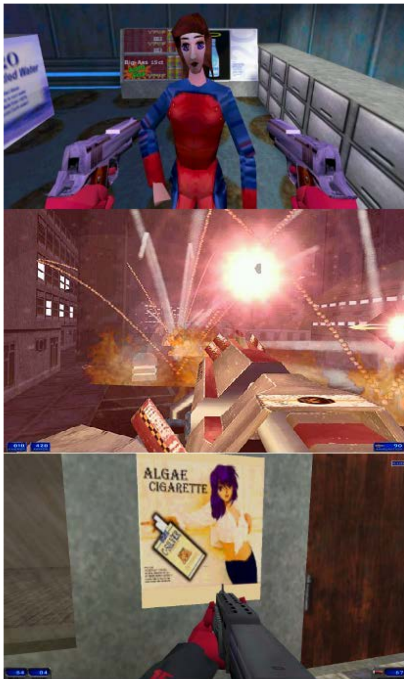
Figure 11. Shogo 's anime-style presentation defines the experience.

http://www.pcgamer.com/reinstall-shogo-mobile-armor-division/