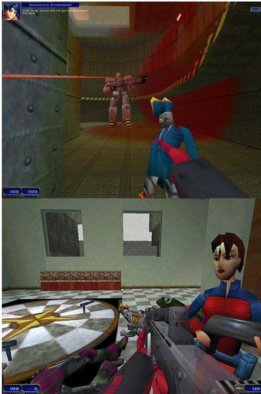
Figure 12. Sanjuro frequently cracks jokes when conversing with allies and foes alike