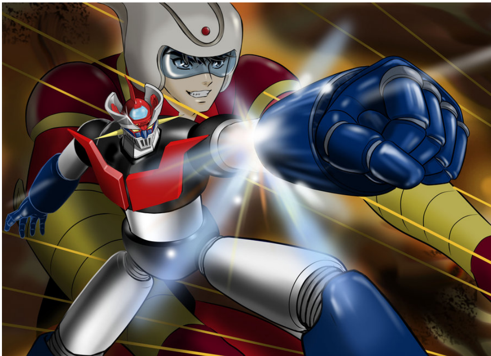
Figure 8. Mazinger Z : man and machine as one dynamic entity.

If Yokoyama established a link between man and machine with Tetsujin 28-go , then Go Nagai forged that link into a union. Having read both Mighty Atom and Tetsujin 28-go as a youngster, Nagai sought to create his own robot manga. One day, while waiting to cross a street, Nagai “contemplated the backed-up traffic and mused about how the drivers were wishing for some way to get past the other cars” (Hornyak 60). This inspired a novel idea: what if the car suddenly transformed into a robot that a person could ride and control like a regular vehicle? Fortuitously coinciding with the spread of personal car and motorbike ownership in Japan, Nagai’s concept -- a pilot sharing the body of a robot -- made the man-machine bond both figurative and literal. The resulting manga, Mazinger Z (Tranzor Z, 1972) would prove to be the next big evolution in the mecha genre.