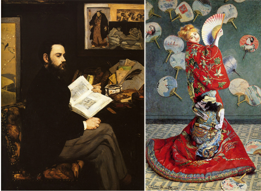
Figure 3. Edouard Manet, Portrait of Emile Zola , and Claude Monet, Madame Monet in a Japanese Kimono . http://www.nippon.com/en/column/g00284/

Coined by French art critic Philippe Burty in 1872, Japonism described the influence of Japanese aesthetics on Western art, which would gradually bewitch Europe and the rest of the Western world (Watanabe). Painters such as Edouard Manet and Claude Monet lifted imagery from Japanese paintings and incorporated them into their works. Emerging artistic styles such as Anglo-Japanese and parts of Art Nouveau reflected the Western appreciation for Japanese art and design. Japonism also influenced other art movements, including Impressionism and Post-Impressionism, spreading beyond Western Europe to Russia, North America, Australia and New Zealand.