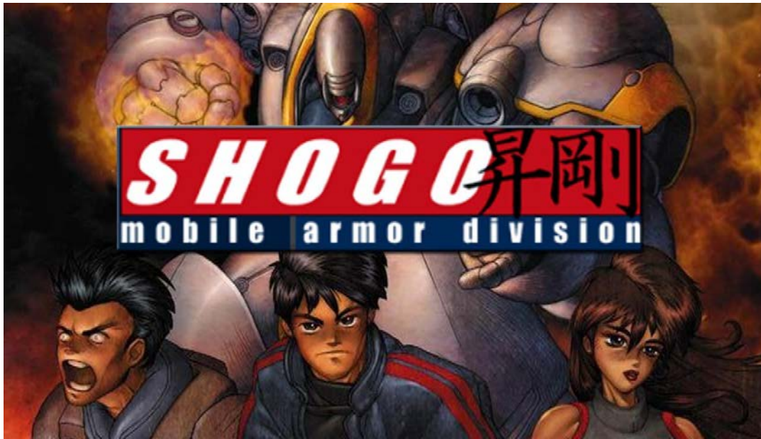
Figure 10. Shogo : an amalgamation of epic mecha anime and high-octane FPS gameplay.

http://dumee gamer.com/timemachine/shogo.html