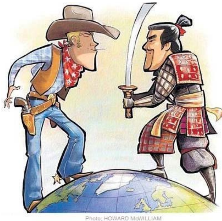
Figure 5. West and East: Is cultural compatibility possible?

‘In the midst of a single breath, where perversity cannot be held, is the Way.’ If so, then the Way is one. But there is no one who can understand this clarity at first. Purity is something that cannot be attained except by piling effort upon effort (Yamamoto 25).