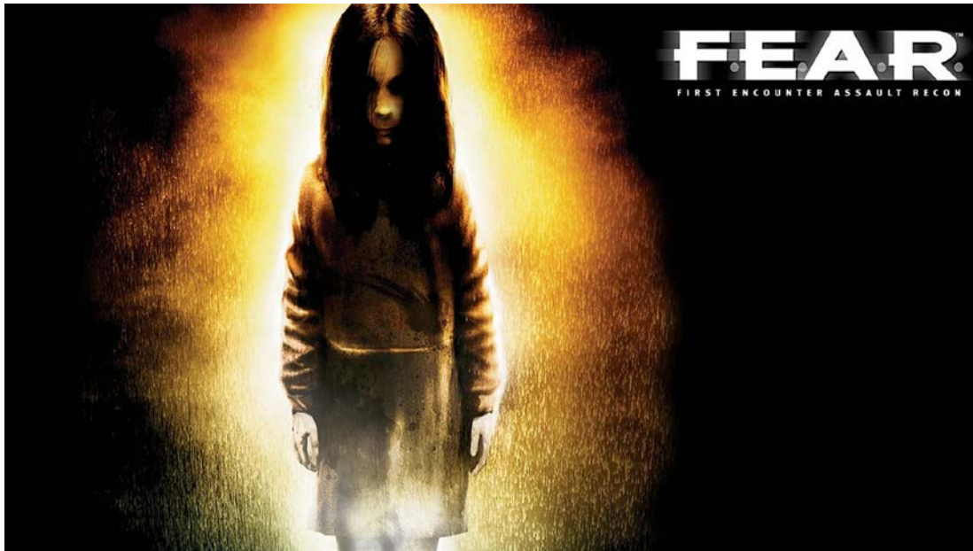
Figure 19. Alma Wade, the yurei figure in F.E.A.R.

http://ayay.co.uk/background/action_games/fear/alma/