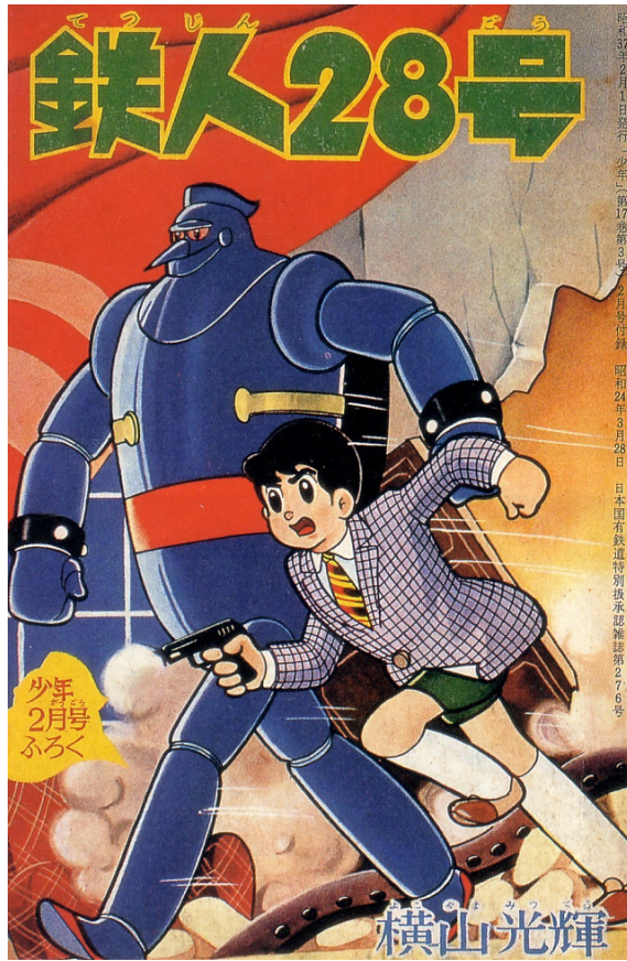
Figure 7. Tetsujin 28-go : the series that begot the Japanese mecha genre.

http://pinktentacle.com/2010/10/tetsujin-28-manga-covers-1956-1966/