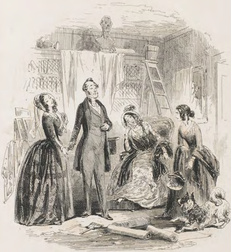
Mr. Dombey introduces his daughter Florence.