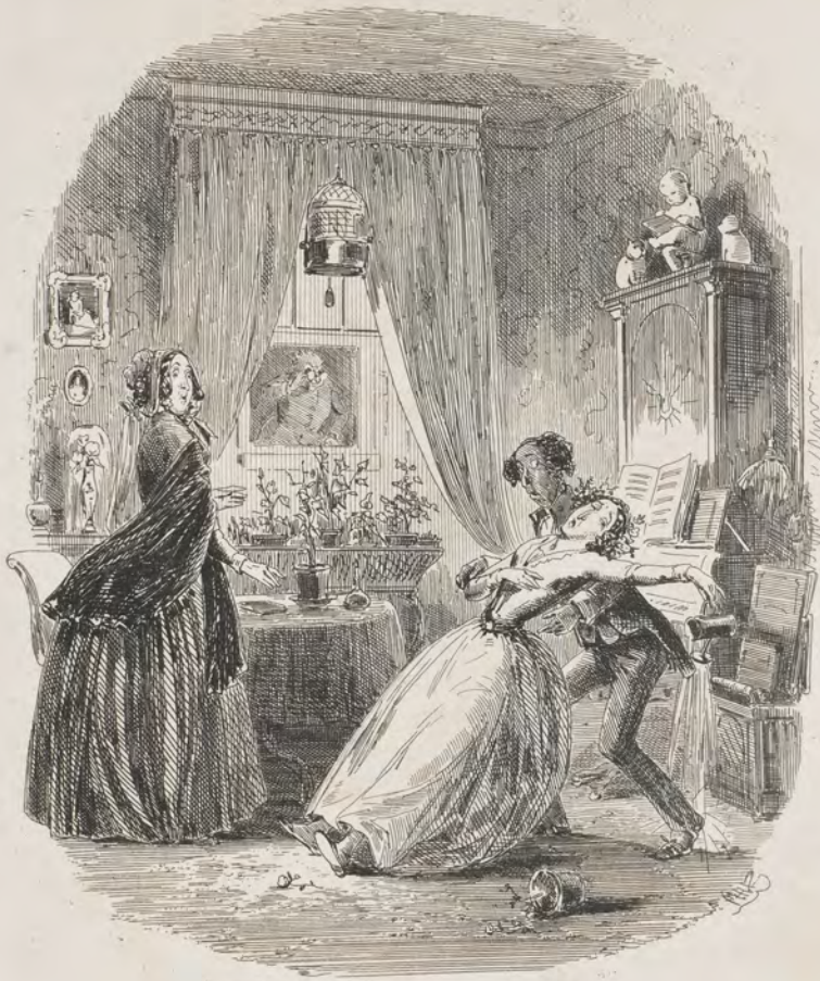
The eyes of Mr. Chick are opened to Lucretia Tax.