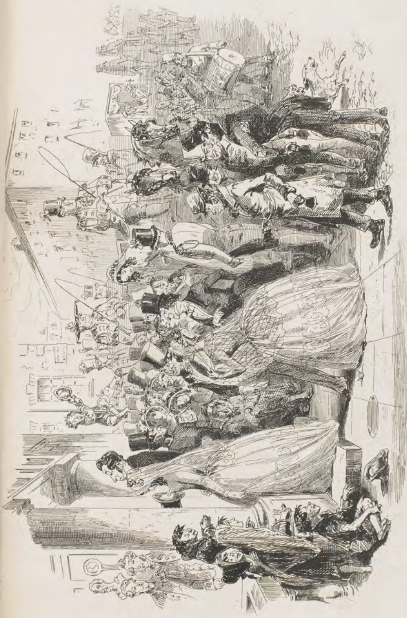
Leaving home from Church