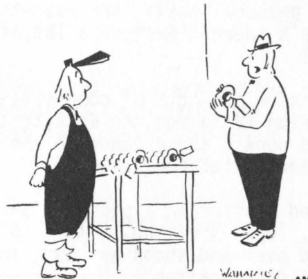
"Beats me. I give you ten castings, and you come up with 14 rejects."