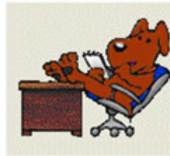
Figure 2: Scooter the Tutor angry when students are gaming

Why do we need to know the largest value of height in this part of the problem?