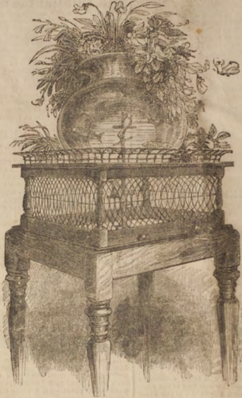
ORNAMENTAL WATER CAGE.