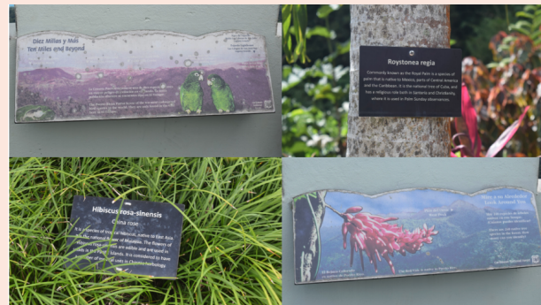
Figure 5: Examples of Informational Signs about Flora and Fauna

Note. These images were taken of signs in northern El Yunque (upper-left and lower-right) and the bed-and-breakfast Casa Flamboyant (upper-right and lower-left).