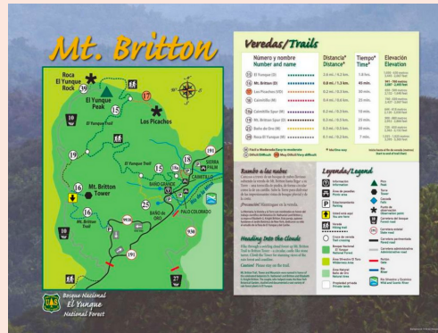
Figure 4: Map and Information for Mt. Britton Trails

Note. This is a map of Mt. Britton trails with information about the trails. A permanent map like this one can be added to the Rio Sabana Trails to help hikers understand the distance of the trail and where it leads to.