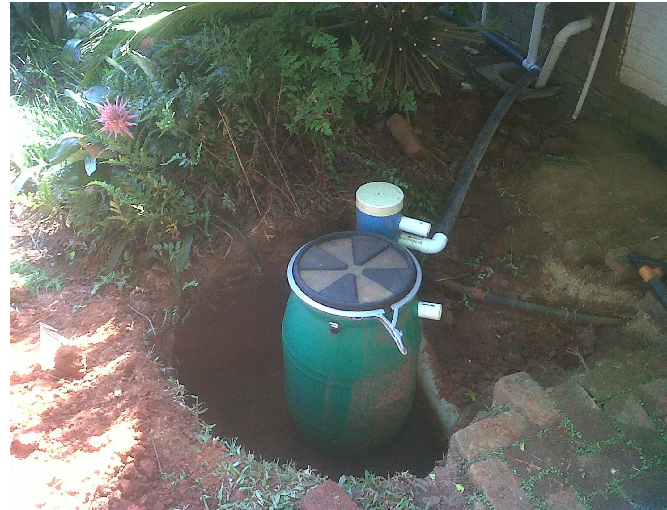
Example of a Household Greywater Tank [4]