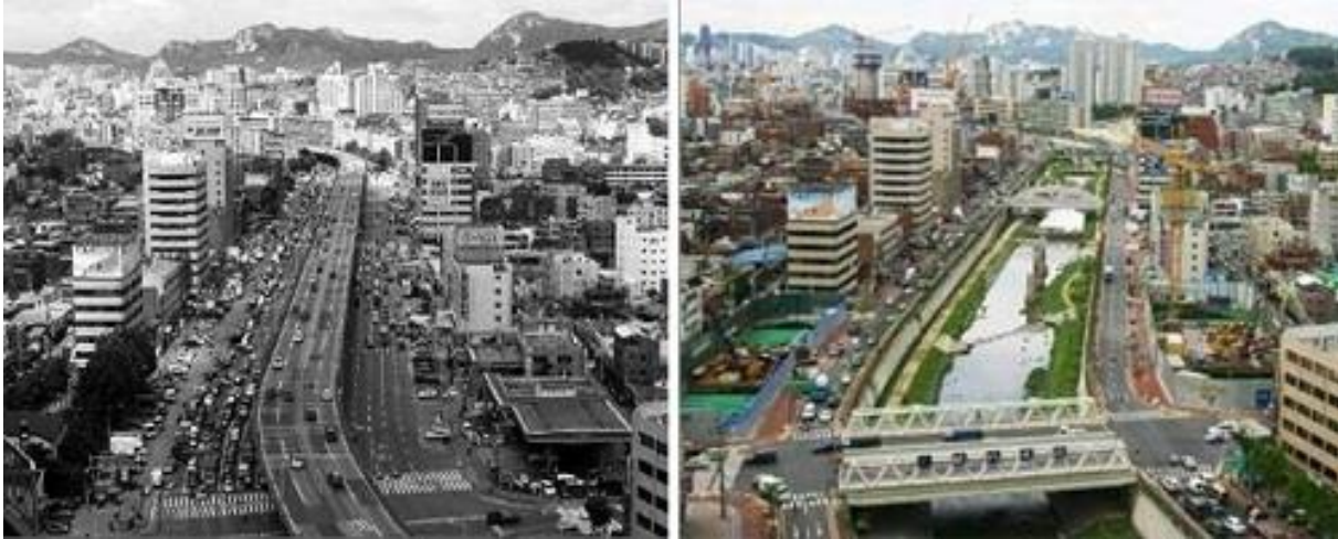
Figure 3. The before and after of the restoration of the Cheonggyecheon River in Seoul, South Korea