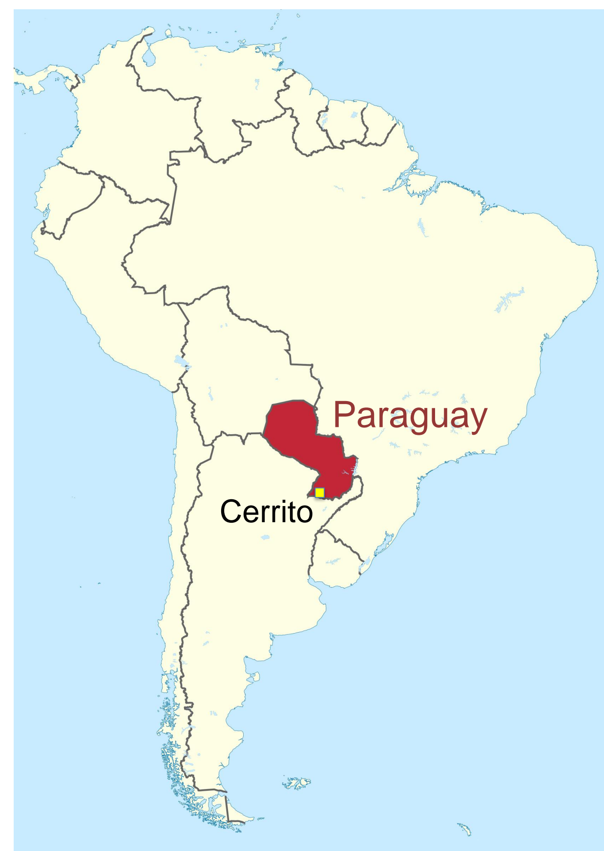
Above: A map showing Cerrito, Paraguay. Below: A polluted river in Asunción, Paraguay.