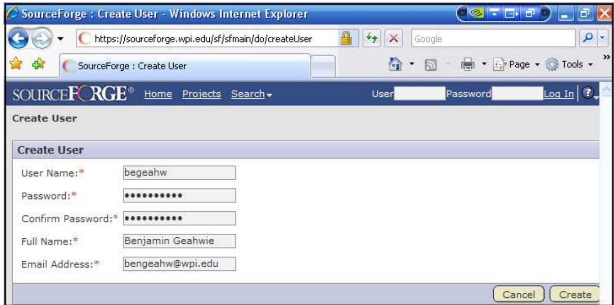
Figure 6: Create SourceForge Account Page.