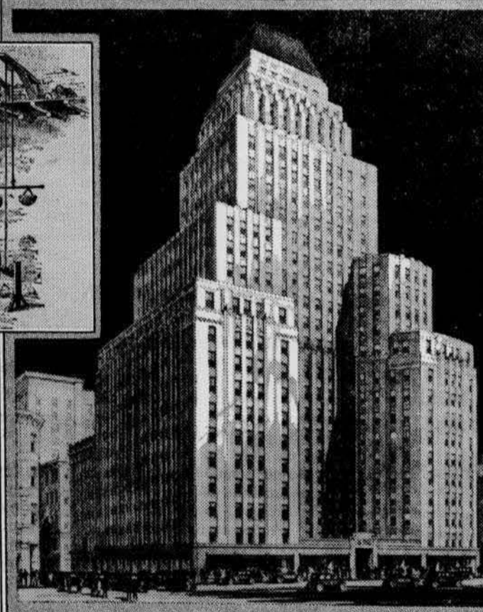
UNITED SHOE MACHINERY CORP. BLDG., BOSTON, MASS.