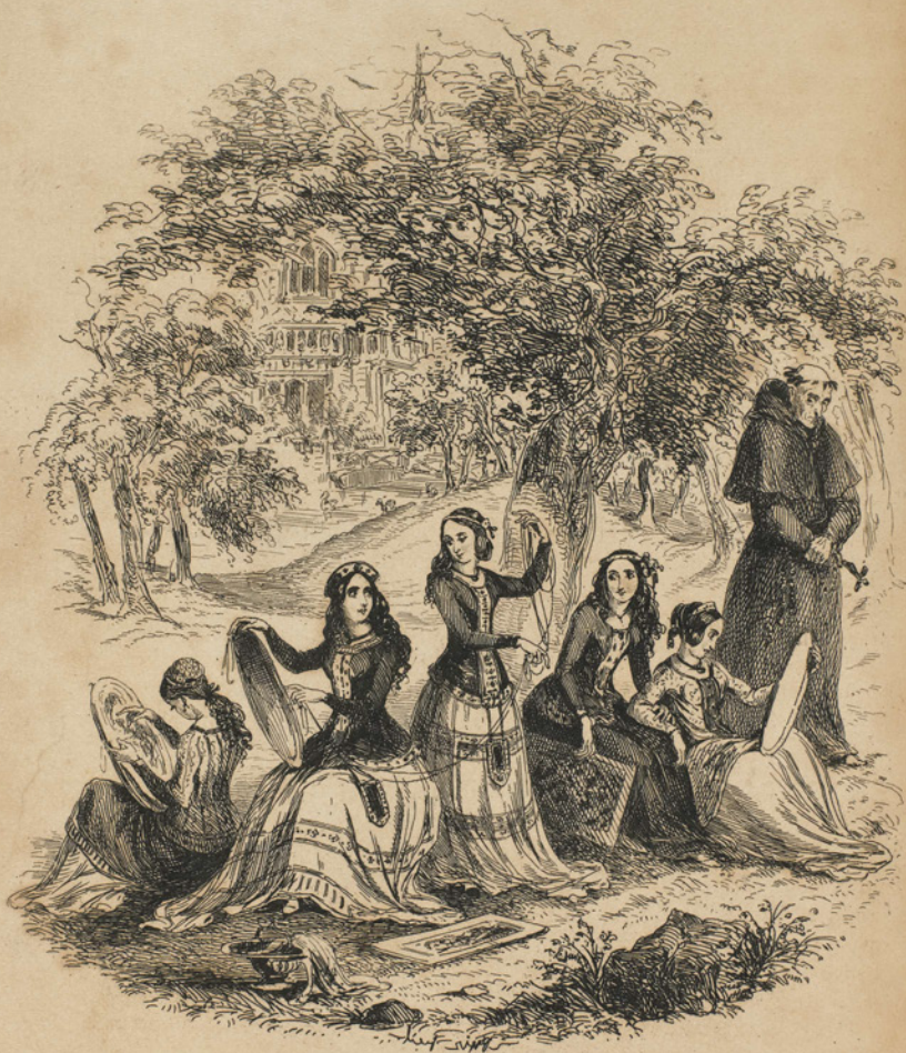
The Five Sisters of York.