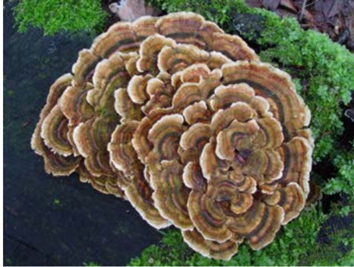
Figure 3: Fungi Trametes Versicolor (Emberger, 2008)

The drug paclitaxel is produced by the fungi Nodulisporium sylviforme , and is used as a means of disrupting the mechanism of reproduction in ovarian, breast, and lung cancers. Paclitaxel acts by stabilizing the microtubule of the mitotic spindle and prevents the movement of chromosomes to the metaphase plate which occurs in normal mitosis (Zhao, 2004). The mitotic block caused by Paclitaxel eventually leads to the apoptosis of the cell and thus the eradication of cancer cells.