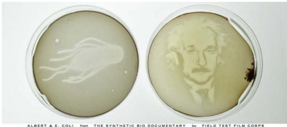
Figure 2: Albert Einstein drawn in the bacteria E.Coli (Kickstarter, 2011)

In an almost surreal combination of computer programming and biology, researcher Christopher Voigt, a researcher at the University of California, has created computer programs which in time may be able to design bacterial circuits which produce biomolecules such as genes and proteins at the click of a mouse. So called “synthetic biology” may one day allow the easy manipulation of bacteria for medical use. These bacteria can be mix and matched with desired characteristics such as membrane signal sequences, macromolecule synthesis pathways, and chemical structure (Voigt, 2010). As Voigt describes the idea, they are looking to “create a programming language for cells so that you could write a program for a cell in the same way that you would for a computer or for a robot. That program is encoded on a piece of DNA and when you put that DNA into a cell it is able to run that program.” What is currently a time-consuming process of trial and error to produce specific bacteria may soon be an automated process. In a visually awe-inspiring example of the abilities of synthetic biology, Voigt’s lab has used variants of E.coli which change color in response to a projection of an image on it, to produce images of Albert Einstein and E.coli itself in culture (Figure 2).