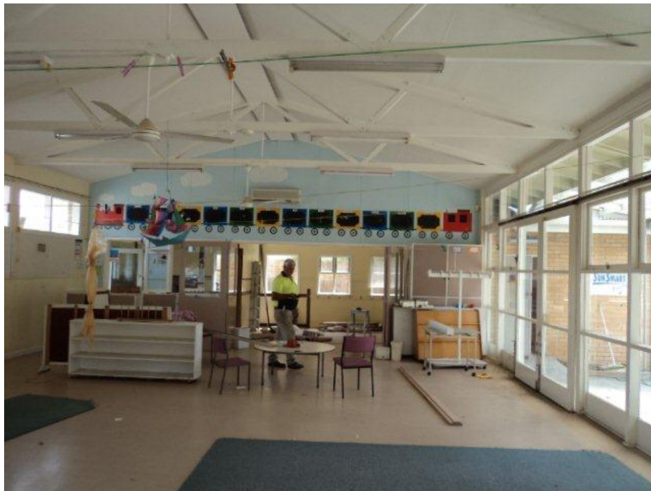
Figure 11: The former Fawkner Kindergarten, where renovations will be made in order for the Fawkner Community House to expand its food bank

Once the Fawkner Community House takes over the local kindergarten for their food security hub, they will have much more space, as well as enough area to store foods such as rice and lentils not only for the food bank, but also for future need. Therefore, we suggest that the Fawkner Community House collaborate with FoodBank Victoria so that the food bank will not only give out fruits and vegetables, but will also supply staple foods. The community house is already on the client list for FoodBank Victoria, so our hope is that once there is an adequate amount of space, an order can be placed for those types of essentials in addition to the current assistance from SecondBite. In the case that the food security hub doesn't open as planned, we suggest the Fawkner Community House have a second day for the food bank at their current site, during which Foodbank Victoria can provide food for the recipients so that they can receive a wider variety of food that will also last much longer.