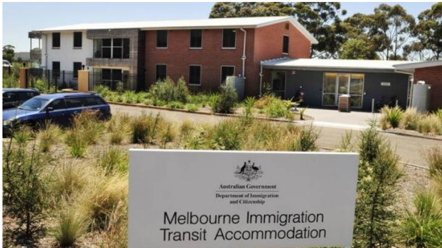
Figure 9: Melbourne Immigration Transit Accommodation, the detention center located in Broadmeadows, Victoria, close to Fawkner (South, J., 2012)

However, many times, asylum seekers are placed on bridging visas until their application for protection visas is finalized. This allows them to stay in Australia under certain conditions, which includes many restrictions on obtaining employment. Even though they are eligible for some government benefits through the Asylum Seeker Assistance Scheme, “the level of financial assistance offered to asylum seekers is less than that offered to Australian Citizens living under similar living arrangements” (Australian Government, 2014). Unfortunately, this low income support from the government, combined with unemployment, does not provide sufficient funds for these individuals to afford basic necessities, such as food and shelter.