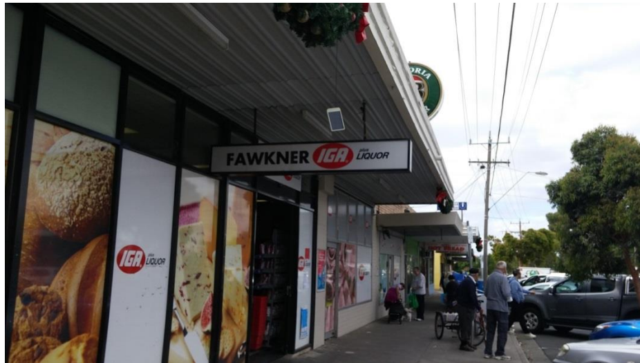
Figure 7: The Fawkner IGA, one of the very few grocery stores in the suburb

One young, single woman explained her methods of shopping. “Sometimes we go to places where they sell food that is just about to expire, so it is cheaper than at a regular market. It helps us to save a couple of dollars here and there. Even if it has a best before date, sometimes those things still look good so we just buy that. [Not Quite Right Grocery Clearance Stores] has food in Coburg that is cheaper. Aldi is also cheaper. I shop by going to four or five different markets and [check] all the prices, just to make sure where things are cheapest. Then I buy the cheapest [goods]” (Personal Communication, 2014). This is difficult for her since she relies solely on public transportation and friends, but because she is currently unemployed, she now has the time to spend full days grocery shopping. It is eye opening to see how much effort must be put in to save a small amount of money. She joked, “I have a friend who is Sri Lankan and just got married and he told his wife to go shopping with me because I know where everything is [less expensive]” (Personal Communication, 2014). This also exemplifies the importance of community interaction, because if she can spread her knowledge to her friends and neighbors, it could conceivably reduce the struggles of those around her as well.