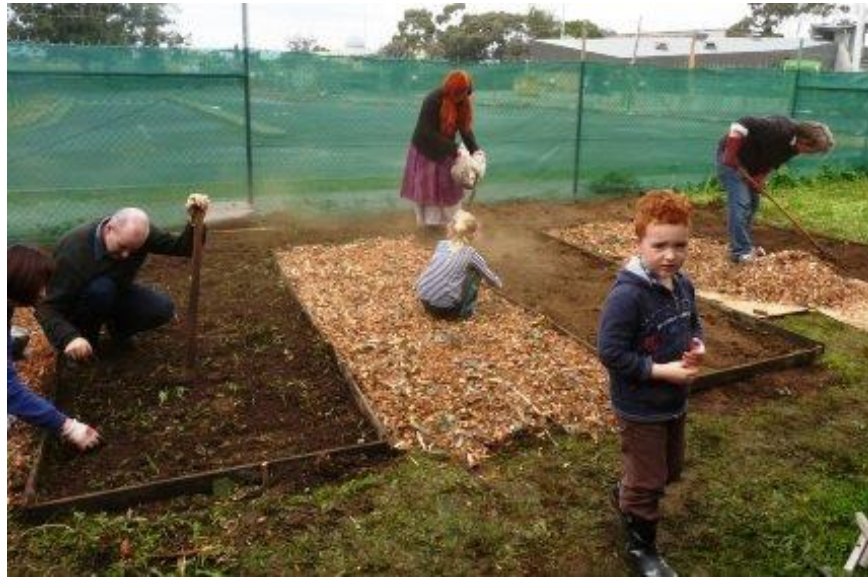
Figure 10: The current community garden at the Fawkner Community House

In addition, we believe that there should also be an educational program that teaches both the techniques and benefits of gardening. Men would also be able to have a part in this once the Fawkner Community House expands to the old kindergarten, where the food security hub will be located. If community members learn about the positive outcomes of gardening, such as fresh produce, cheaper food, and social interaction, they may be more likely to partake in such programs. The Fawkner Community House should also collaborate with SecondBite and get involved with their Foodmate and FreshBite programs, which educate people on how to use and cook fresh food. As Emily Wild, an employee at SecondBite said, “[SecondBite is] not just giving out a bag of food” (E. Wild, Personal Communication, 2014) and leaving recipients to fend for themselves. On the contrary, these programs ensure that SecondBite's donations do not go to waste in the community, and when implemented in conjunction with the community garden, they will ensure that the food that people put a lot of effort into growing will not go to waste either. As mentioned before, this recommendation may take a little while to become popular. However, as a team we believe that this program could lead to a significant increase in the amount of fruits and vegetables that people eat each week and lower food insecurity overall.