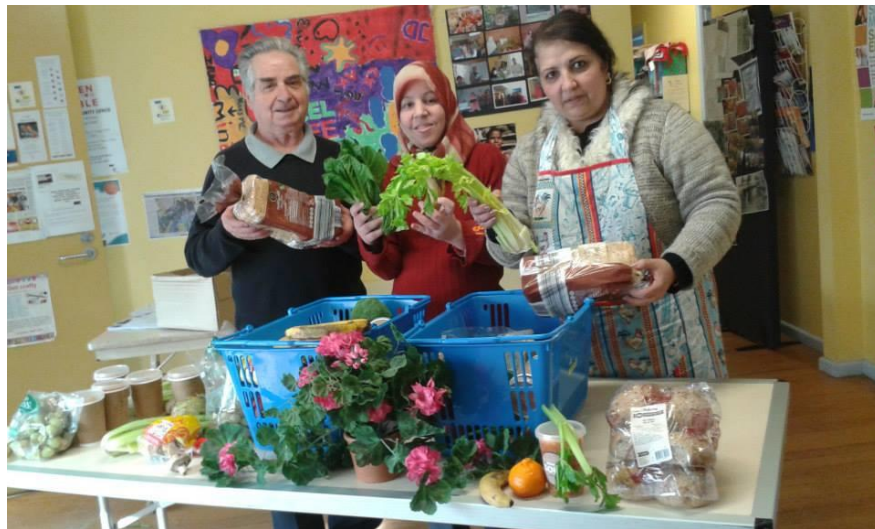
Figure 6: Volunteers working at the Fawkner Community House’s food bank

bank is a great program, it is simply not enough. People receive food baskets once a week and one Fawkner resident said it only lasts her small family three to four days. Unfortunately, this leaves them short on food for the remainder of the week. In such difficult situations, many people have to face the dilemma of eating smaller meals or skipping them altogether. Other people, who have children, spoke of how they often eat small portions in order to let their children eat more. People also buy cheaper foods, but oftentimes, this does not allow them to maintain a balanced diet and therefore they are still food insecure. Additionally, they are not able to eat as many fruits, vegetables, and meats as they would like because these foods are significantly higher in price than pasta, rice, and lentils.