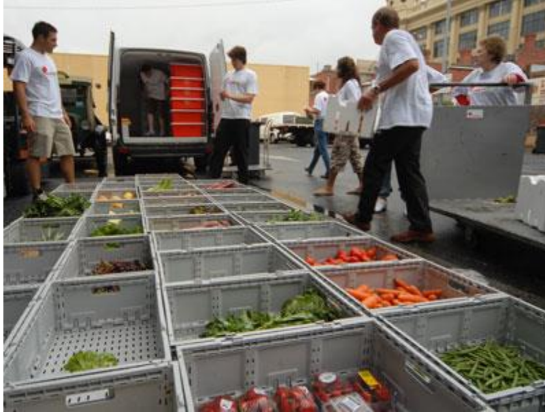
Figure 3: SecondBite volunteers delivering food to a community house (Archdeacon, 2010)

The strict rules that the government has put in place for defining the citizenship status of an individual limits who is eligible to receive benefits. Programs like SecondBite give a great amount of support to those who are not yet considered lawful citizens, but there are still many programs that will not help them. This can cause many problems for unlawful non-citizens who are desperately seeking work without extra support, one of which may lead to an inability to purchase an ample amount of food.