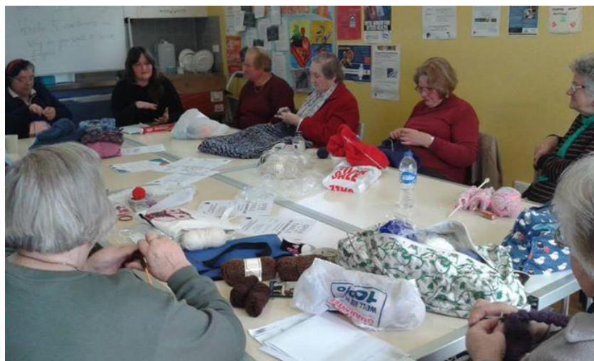
Figure 4: The Fawkner Community House’s knitting class works on their crafts

House,” 2014). While many of the classes and activities are free, some have a fee. However, if someone cannot afford a class they will not be turned away (“Fawkner Community House,” 2014). The Fawkner Community House also organizes many community events that allow people to socialize and meet other residents, such as the monthly Women’s Morning Tea (“Fawkner Community House,” 2014). There are a wide variety of subjects that allow people of all different personalities to find something they enjoy doing.