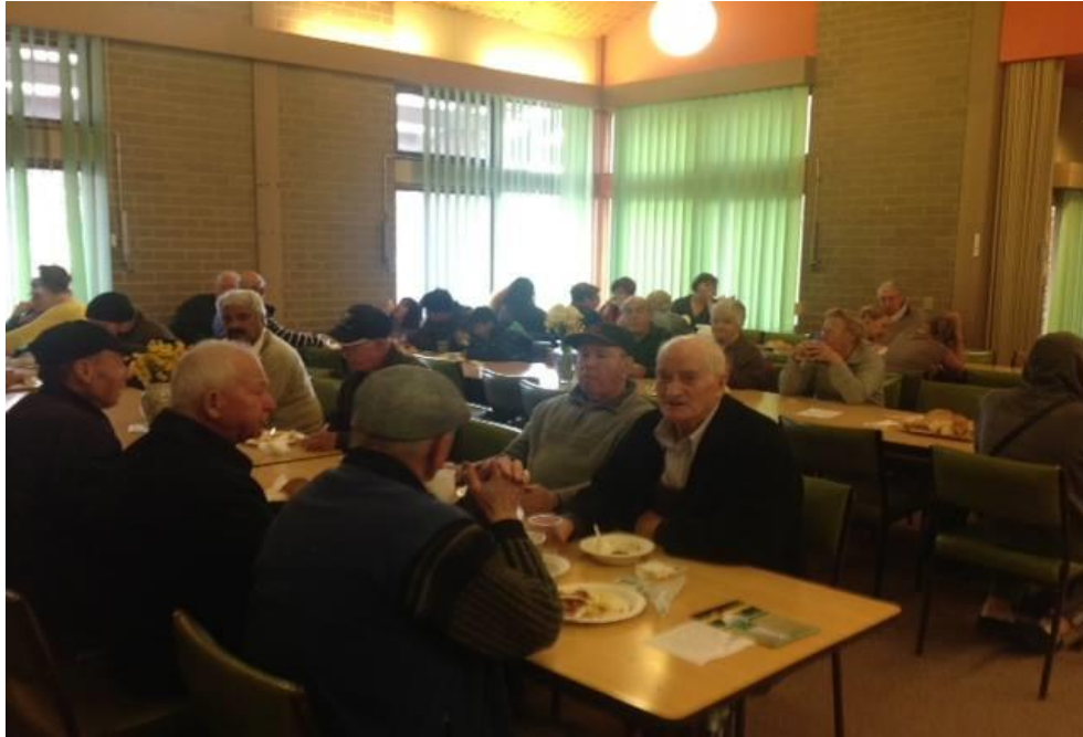
Figure 5: An Open Table lunches hosted by the Fawkner Community House

The Fawkner Community House asked for help with finding out what people are really struggling with and how they are experiencing food insecurity. They are looking for other ways they can help the community. One of their ideas is to build a food security hub. Currently they cannot keep food in the community house overnight because they lack the storage space and refrigeration to do so. The food security hub would allow them to fix this problem along with others. However, in order to do this the community house requires plans for sustainability and growth. In the next chapter we discuss the details of how we assessed the food insecurity issues in Fawkner and assisted in plans for implementing the food security hub and making it sustainable.