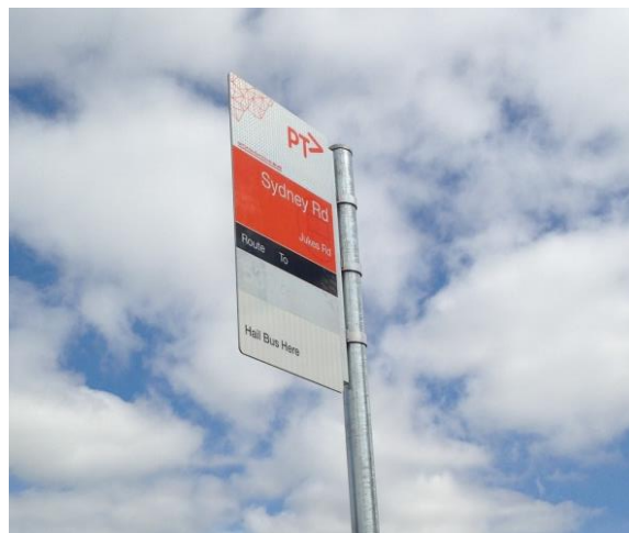
Figure 8: A bus stop of the only bus line in Fawkner

retail outlets. Consequently, these poorly laid out routes make it difficult to travel to work, purchase food and pick up baskets from Fawkner's weekly food bank. Many people who need to visit the Fawkner Community House to pick up their food baskets from the food bank or attend classes must either find someone to drive them to the house or pick up their baskets for them. Elderly people without cars are also left at a disadvantage, especially if they are immobile. Many newly arrived female immigrants are also at risk for social exclusion, in addition to food insecurity, since many do not drive and others fear discrimination that often takes place on public transport.