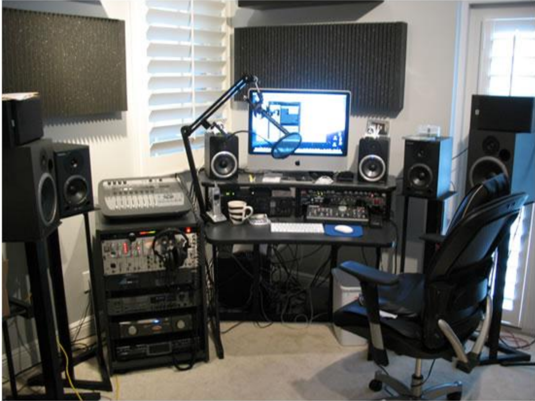
Figure 3: At-home studios like this one have become increasingly common alternatives to full recording booths. 14

Along with the newly developed hardware, digital music and experimental sound art have led to the creation of music software that can be boiled down to simple programming. Whereas traditional instrumental or vocal music is based on vibrations in the instrument or voice box, music formats such as MIDI (Musical Instrument Digital Interface) can be distilled down to basic data streams and hexadecimal codes. In fact, MIDI programming allows composers, if they so wish, to create entire songs from scratch without needing a synthesizer at all. Free programs such as Anvil Studio even have a built in GUI so that a click of the mouse is all that is needed to create tones that sound like they come from one of 128 possible instruments. Additionally, music editing programs such as Audacity allow the user to alter songs in other formats, such as MP3, through a wide array of musical effects. Between these two types of programs - music synthesis