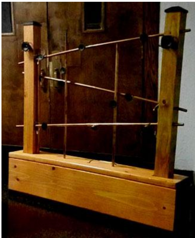
Figure 7: The GameWave speakers (1 of 2 shown).

The final speaker setup is actually a left over design from a previous project completed by a group of WPI students. The piece is made of two frames built from wood and copper tubing, through which ten tweeter and two woofers each are strung. The back is also fitted with a strip light, giving the setup a bluish glow when lit. This minimalistic and artistic design fits in perfectly with the GameWave design, as the slightly angled piping is actually somewhat reminiscent of the original Donkey Kong game, which can help add to the enjoyment for older participants. These speakers were provided by Professor Bianchi and the WPI music department and only minor repairs had to be done (such as reaffixing some speaker heads to the pipes) before it was ready to be plugged in to the final system.