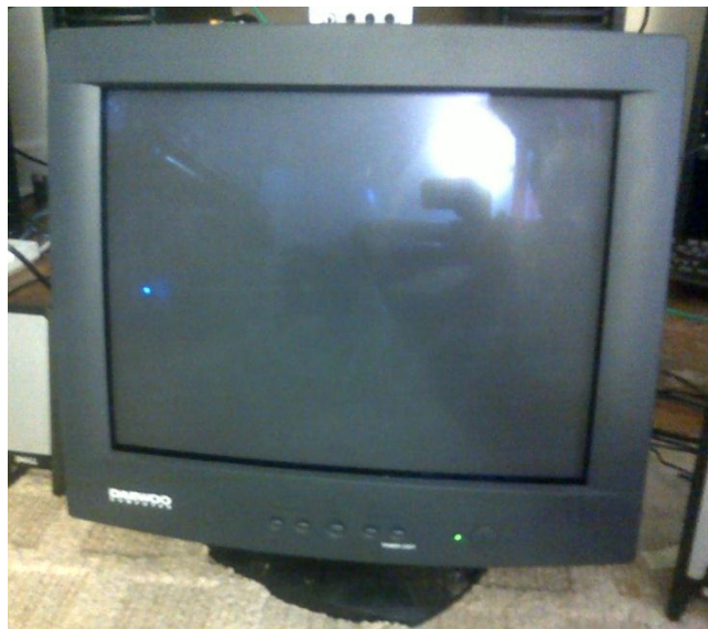
Figure 5: The GameWave monitor.

There were only two main considerations when looking at the choice of monitor in terms of functionality. First, it needed to be capable of displaying enough color to show the sound wave in a vibrant and clear image. Secondly, it needed at least a VGA connection. As these requirements are basically standard in most working monitors today, finding a monitor was simple.