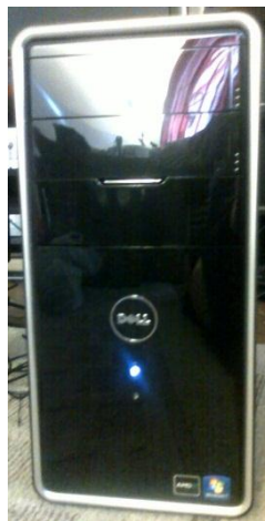
Figure 4: The GameWave computer tower.

The main computer for the project had a few vital requirements. First, it would need enough memory to be able to hold an instance of the Ubuntu operating system, the Python program, any MIDI synthesizers that might have to be added in the software, multiple Python library documents, and the MIDI and configuration files for the song. Together, these programs and files require at least 256 MB. For the music aspect, there must be a sound card that is at least capable of playing MIDI songs and, if it didn't come with a MIDI synthesizer (as some older computers do), the CPU must be capable of processing MIDI via a program such as TiMidity. Additionally, both a microphone and speaker port were necessary as well as a VGA connection to ensure that both the audio and visual outputs would function properly.