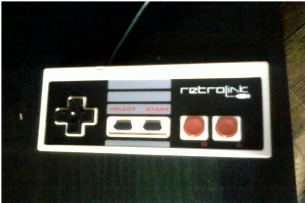
Figure 6: The GameWave controller.

For the GameWave controller, there were a few possible models that would have been feasible to use. The basic requirements for it included a design that didn't have too many confusing buttons and joysticks, but still had at least five buttons (two for pitch and tempo each and at least one for instrumentation changes). Anything beyond that just allowed for additional functionality. Additionally, the controller had to specifically be for a computer, preferably with a USB connector.