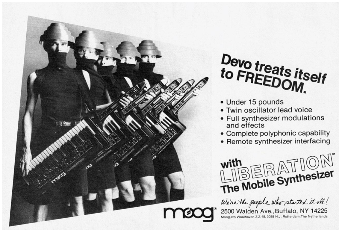
Figure 2: Devo advertising the Mobile Synthesizer, also called the Keytar. 13

With these new musical formats, composers and artists became one and the same. Many DJs today, such as the world-famous Dutch artist Tiësto, are also well known for their own songs, which they can conceive, record, and play for worldwide audiences without any external assistance. In fact, much of techno's diversity and popularity stems from the fact that it has become possible and sometimes exceedingly simple to create music from one's own home. Even most lower-end laptops are capable of handling simple music creation and editing software, and keyboard synthesizers have become more compact and available at affordable prices. Of course, a professional setup is much more advanced, but many artists can still fit their entire studio into one or two rooms of their home, as opposed to requiring giant recording studios or churches with full pipe organs.