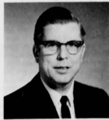
George E. Stannard