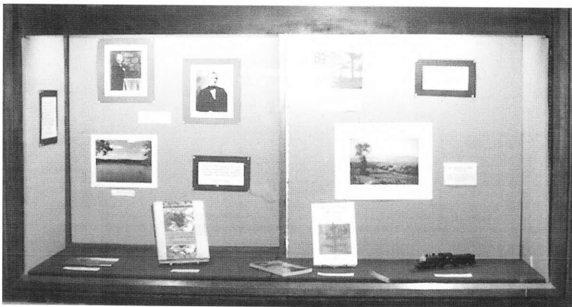
Picture of the display case seen when leaving the library.