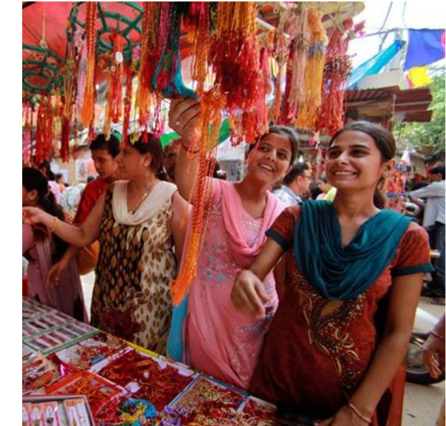
Women looking through their choices of Rakhi bracelets that symbolize the bond between men and women. [4]