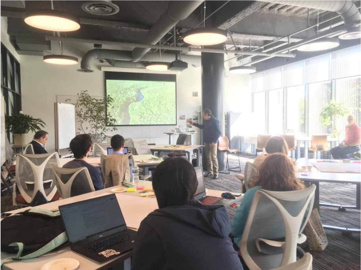
Figure 2 Solve-a-Thon picture