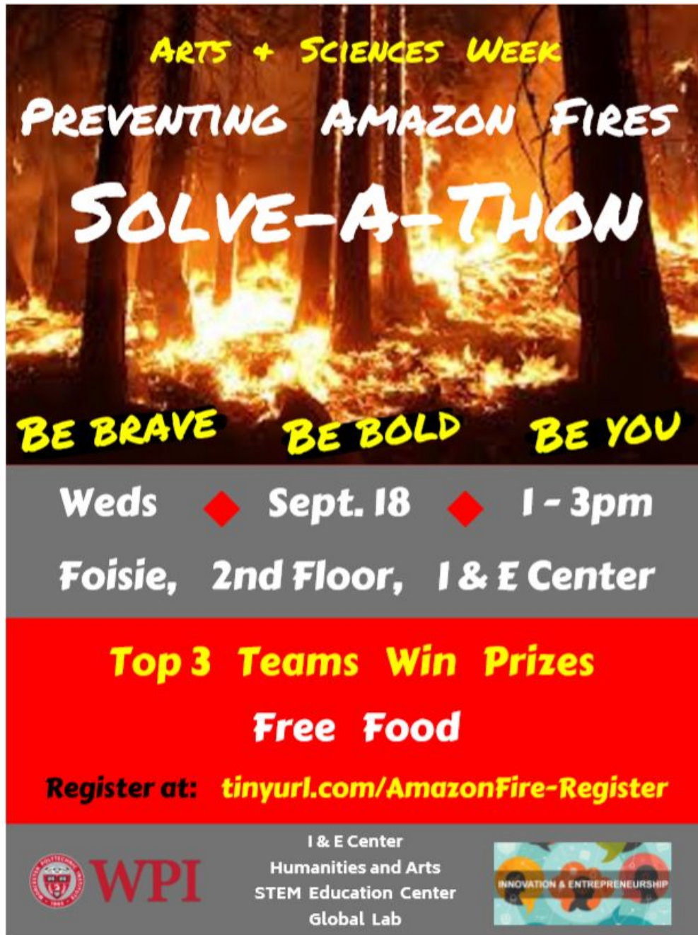
Figure 1 Solve-a-Thon Poster