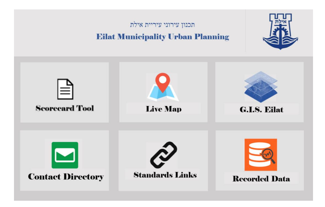
Figure A: Homepage