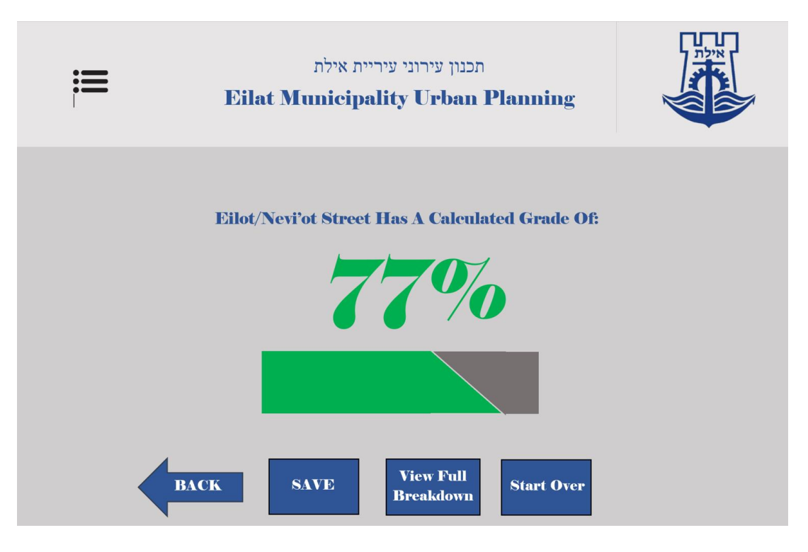
Figure E: Scorecard Web Page Window 3