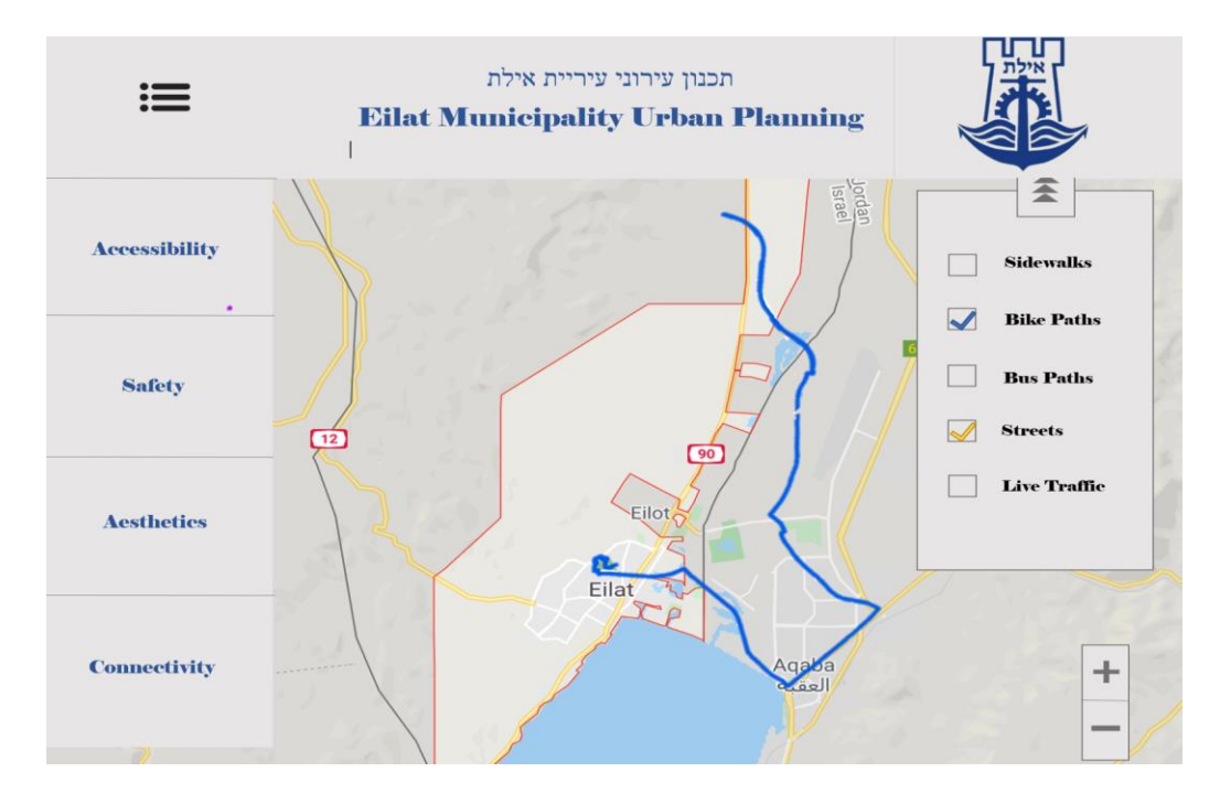
Figure C: Scorecard Web Page Window 2