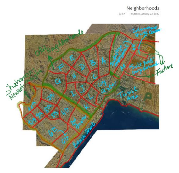
Figure 1: Neighborhood Breakdown