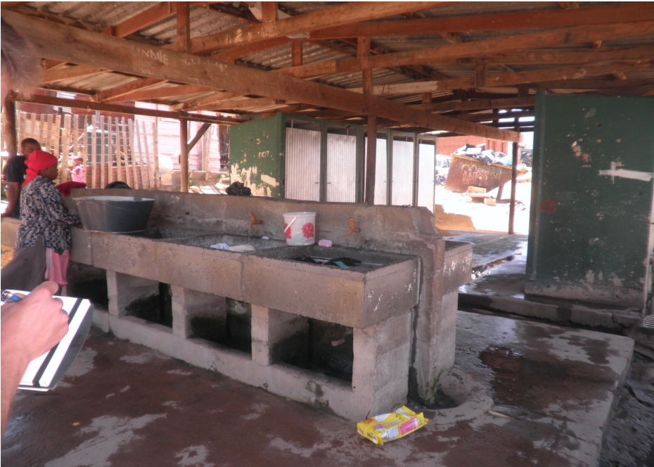
Figure 1: Ablution Block in Langrug

Government is currently the primary organization responsible for WaSH provision in South Africa. However, too often its top-down, subsidized, non-inclusive approach has not been successful. The facilities are typically unclean, smelly, and undignified. In addition, they regularly break. In Cape Town, for example, two thirds of the Cape Town Water Services Department's annual $125 million budget is spent on new equipment and repairs (Jiusto, 2010). A. Mels and colleagues (2008) report that providing conventional sewage solutions to Cape Town's informal settlements would far exceed the budget of the WSD. The magnitude of this challenge is too great for the government alone to solve. It does not have the required personnel, innovative capacity, or capital.