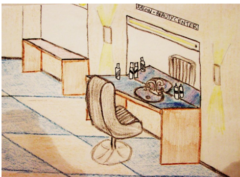
Figure 11: Salon Design for WaSHUp Facility

spaces that satisfy other community needs, in accordance with our second principle. The community expressed interest in laundry facilities, sinks, and showers, so all of