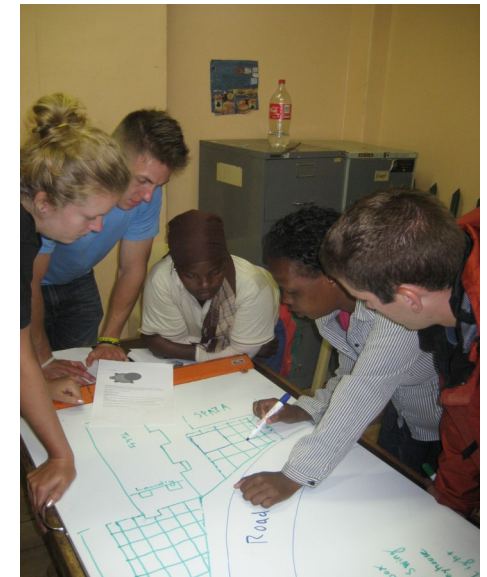
Figure 10: Co-researchers Designing WaSHUp Additions

residents were opposed to non-flush toi-