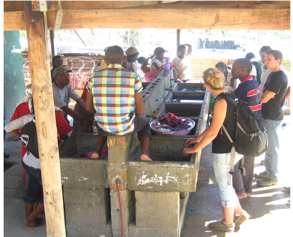
Figure 3: Informal Community Meeting at an Ablution Block

To accomplish these objectives, we applied action research. Unlike a traditional scientific inquiry where we would make a hypothesis, carry out an experiment, and analyse results individually , action research required that we complete these steps collectively , alongside our co-researchers and other community members (Ladkin, 2004). Sharing and listening to ideas identified key concepts that outlined the best way to address community WaSH problems. This method helped to break down the barriers that keep communities disempowered and researchers em-