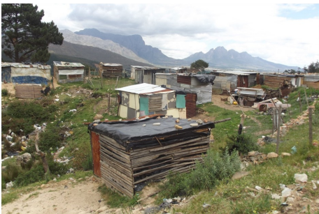
Figure 2: Langrug

WPI brings this partnership four years of experience working with WaSH issues in Monwabisi Park, an informal settlement located outside of Cape Town. In addition,