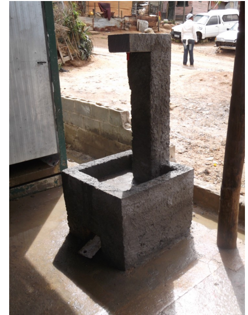
Figure 9: Foot Operated Tap

Adhering to our first and third principles, we involved community members, CORC, and other stakeholders before we drafted our designs. One method of involvement that was especially successful was our visit with Langrug residents and interested stakeholders to MobiSan, a successful urine-divergent, composting toilet system near Cape Town. Prior to the visit,