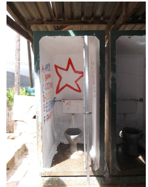
Figure 7: Completed Toilet Stall

To encourage early childhood development, our team and co-researchers painted the alphabet and numbers on wash basins as well as letters, words and shapes inside toilet stalls. Since mothers go to ablution blocks to complete many of their chores, they will be able to work with and expose their children to letters, numbers, shapes, and colours. This exposure is especially beneficial for families who cannot afford to send their children to crèches.