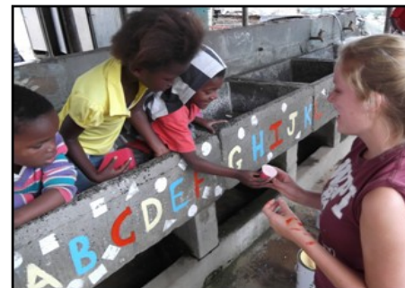
Figure 6: Painting the D-Section Wash Basins

After gaining an understanding of sanitation in Langrug, we collaborated with our co-researchers to determine how best to incrementally upgrade the existing WaSH facilities. Together we modified the 2011 WPI Greywater Team's informal settlement upgrading process to address WaSHUp ideas. This step by step approach, titled "The WaSHUp Process," guided our implementation work in D section, and will be used to direct future incremental upgrades to sanitation facilities. As seen in Figure 5 this process is cyclical, and is designed to be a model that can be repeated or modified by community members, governments, NGOs, and other interested organisations. The co-researchers will use this process on their own to upgrade existing facilities and evaluate their efforts, which helps promote our third principle.