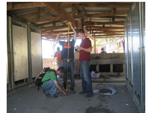
Figure 4: Assessing Sanitation Facilities

process of the objectives as well as the key outcomes.