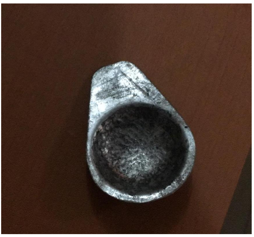
Galvanized Steel Plate