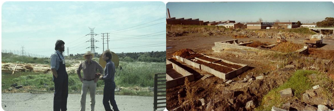
Figure 2. Before CERES. The image on the left shows how barren the land was in 1980. The image on the right shows the construction of CERES in 1982 before it opened (CERES Community Environment Park, 2017).

The Centre for Education and Research in Environmental Strategies (CERES) is a community environment park located on 4.5 hectares (11 acres) of land in East Brunswick, Melbourne (CERES Community Environment Park, 2017). Long before the establishment of CERES, the indigenous Australian Wurundjeri called this land their home. Nearby is the Merri Creek, which the Wurundjeri relied on for food, water, and their livelihood. Unfortunately, these first residents were forced off the land by Europeans during the Victorian gold rush in the 1850s (CERES Community Environment Park, 2017; Wells, 2015). The land was subsequently mined for bluestone and then ultimately turned into a landfill. What once was rich land quickly became polluted and barren as shown in Figure 2 below.