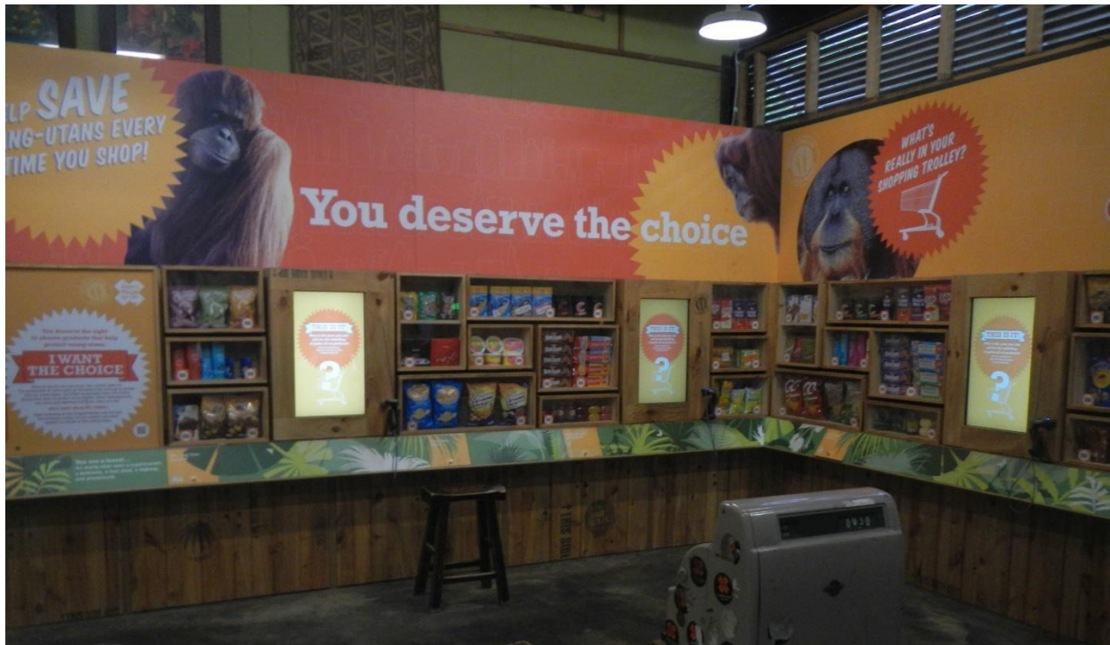
Figure 6. Palm Oil Campaign. A look at the palm oil grocery store display at the Melbourne Zoo, strategically positioned next to the orangutan exhibit (Korn, 2017).

In order to complete this project, it was essential to examine best practices for effective exhibit design and evaluate the use of smartphone applications at exhibits. We visited the Melbourne Zoo and discussed techniques of exhibit design with Cyrelle Field, the Learning Programs Coordinator for Zoos Victoria. The motto of exhibit design that they follow is to “connect, understand, and act” (personal communication, 2017). The visitors must connect with the animal, understand the struggle that the animal is facing, and then act in a way that will be beneficial to the animal. This mission was well demonstrated in the orangutan exhibit, which had an interactive activity that focused on the issue of palm oil production. An artificial grocery store was implemented within the exhibit that examined which common products contained palm oil, shown below in Figure 6. After visitors learned about the harmful effects of palm oil production on the orangutan’s habitat, they were asked to pledge to never purchase products with palm oil in them.