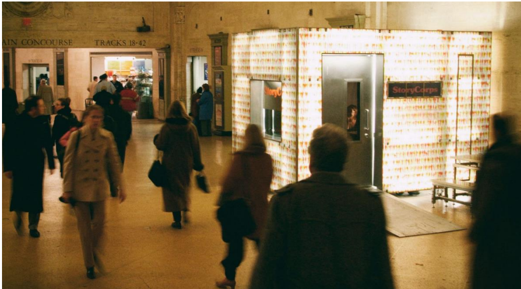
Figure 4. StoryCorps Storybooth. Located in Grand Central Terminal, New York City, New York (About StoryCorps, 2017).

StoryCorps is an organization that was founded “to preserve and share humanity’s stories in order to build connections between people and create a more just and compassionate world” (About StoryCorps, 2017). It originally started in 2003 as a single storybooth located at Grand Central Terminal in New York City as shown in Figure 4 below.