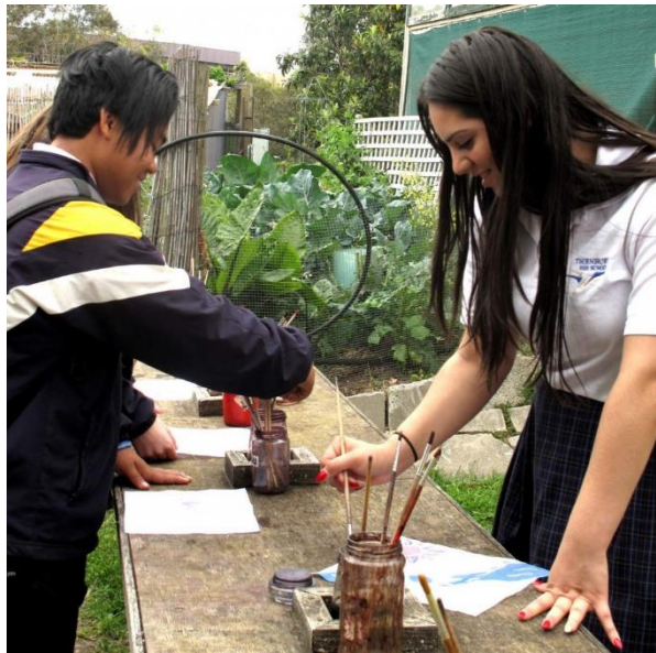
Figure 5. Batik. The students created their own batik out of wax and colored dyes.

Next, we examined the structure of the Indonesian village educational program. The class we observed followed a format similar to the African village class where students were lectured and then encouraged to participate in interactive activities. The topics of discussion in the Indonesian village were planting and cultivation of rice, the design of pictures using the batik wax removal process, and the role of prayer in the religious life of Muslims. Following the discussion, we watched the students till soil, pound rice to husk it, carry pots of water on their head, create their own batik, as shown below in Figure 5, and practice traditional Indonesian prayer.