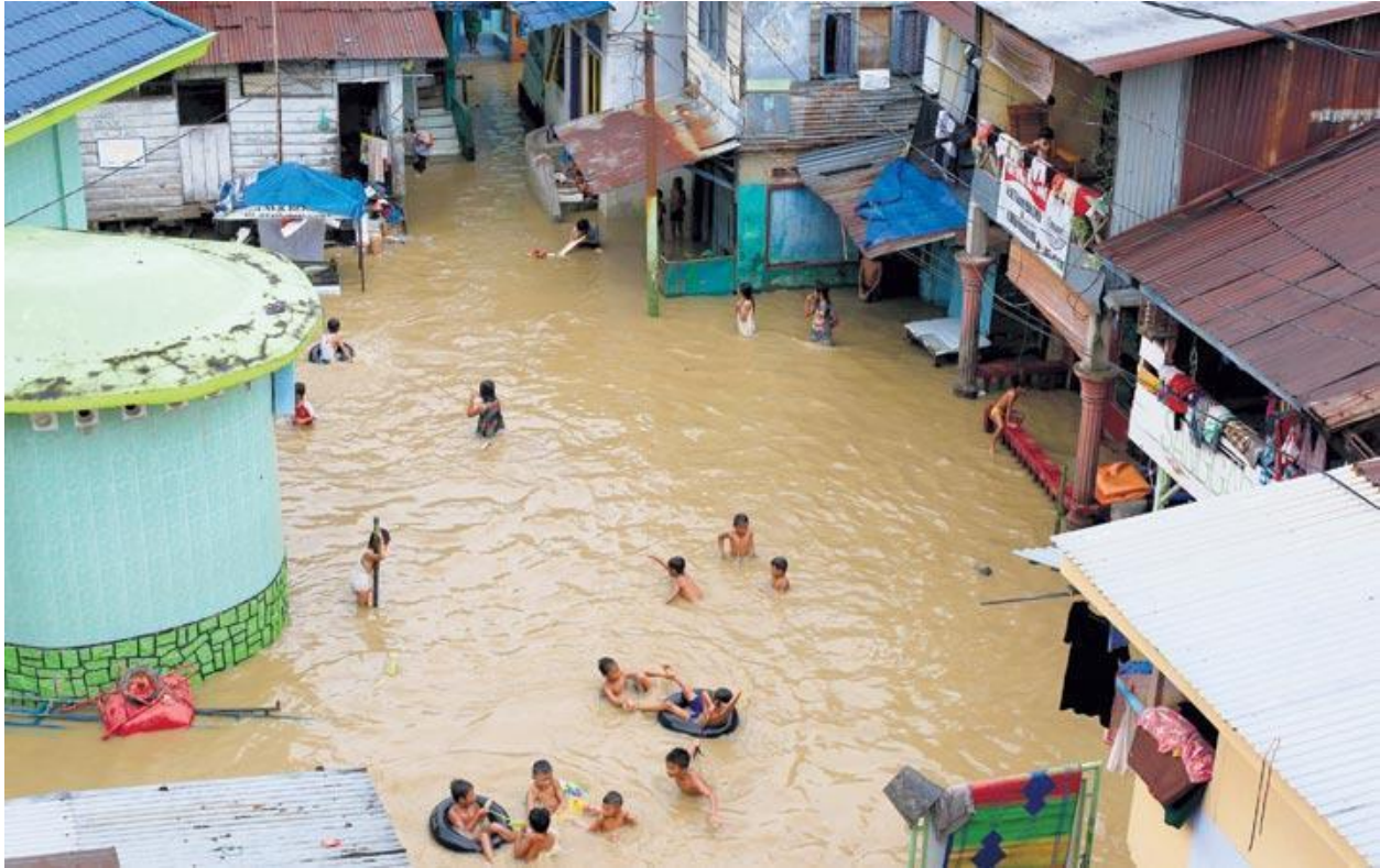
Figure 8. Flooding of an Indonesian Village. A playful spirit fills the village after a flood (Medan, 2015).

flooding was dangerous and harmful to their health. Figure 8, below, is an example of how the natural occurrence of flooding can be viewed as a time to play for Indonesian children.