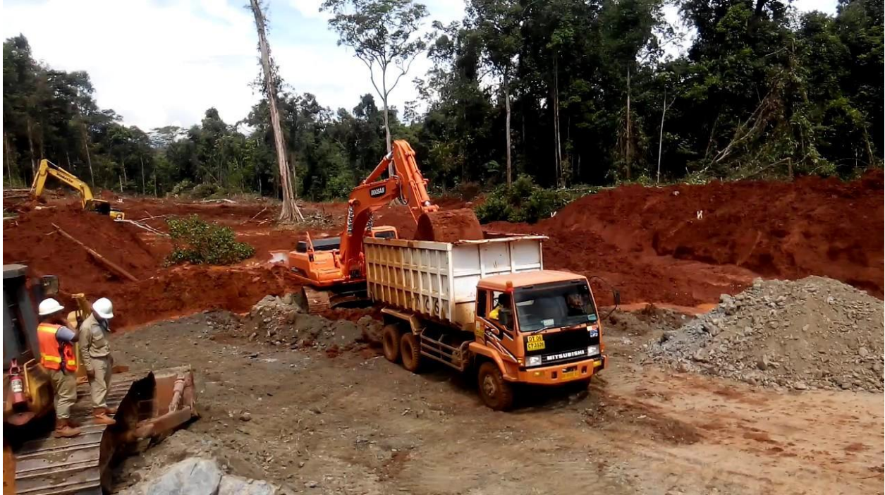
Figure 9. Mining Operation. A mining operation in Indonesia clears the land to mine for natural resources (personal communication, 2017).

To clear the land, this interviewee said that the trees are cut down and all the bushes are burned. These actions contribute to deforestation in Indonesia. Although land degradation is evident, according to the interviewee, some companies try to counteract the clearing of the land by replanting trees in a different location. However, the plants used in the land reconstruction are often different species than the original plants, which could ultimately be harmful to the environment. In addition, it was noted that after a mining company is finished in an area, the environmental department sometimes adopts the land for reforestation.