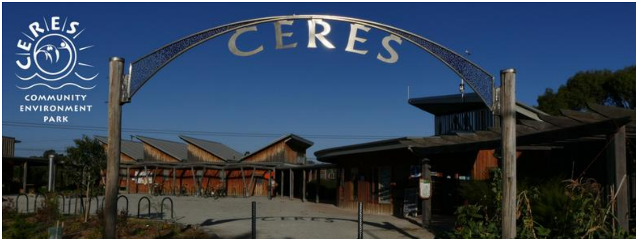
Figure 1. Entrance to CERES. Entering through the gate of CERES invites visitors to an environment unlike any other (CERES Community Environment Park, 2017).

The entrance to the site, shown below in Figure 1, leads to the four precincts of the park: social enterprise, farm, education, and village. All of the precincts are focused around the idea of environmental sustainability.