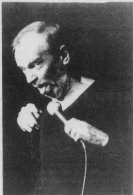
George Carlin's reaction to meeting the WPI crowd in Harrington Auditorium on Friday night.