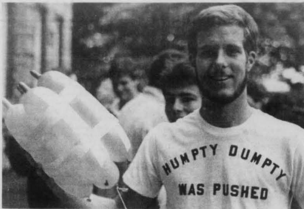
An egg drop participant proudly displays his egg-carrying craft during Friday's egg drop contest at Stratton Hall.