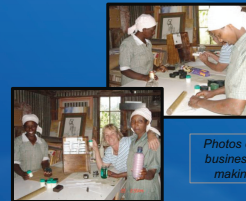
Photos of a local businesswoman making soap

We will help a local business utilize a microloan to expand its aloe soap product line. As this business expands, its owner will hire young adults who are unable to attend secondary school for financial reasons to provide jobs and teach them responsibility.