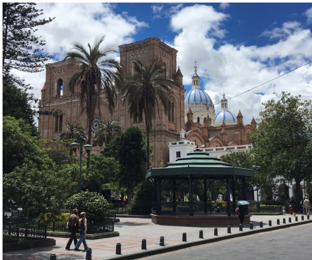
Figure 2. Temperate Climate of Cuenca, Ecuador (Vaccaro, 2017)

Many North Americans migrate and retire in Cuenca, in part, as a result of the climate and nature of the city. North American residents looking to migrate and retire in Cuenca find the city’s generally warm climate very appealing.