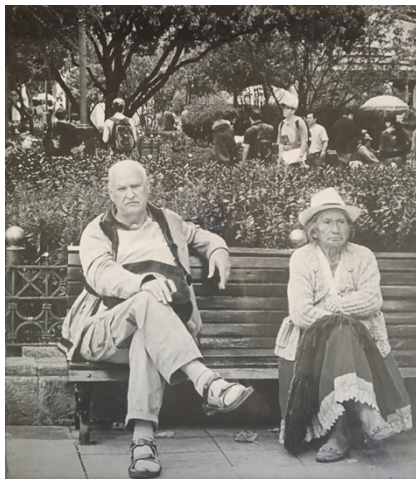
Figure 4. Separation among North American and Cuencano Woman (Dirección de Relaciones Externas, 2016)

North American immigrants typically reported more tension and problems with other North Americans. Comparatively, Cuencanos are typically satisfied with their interactions with the immigrant population. During discussions, multiple participants used the term “ugly Americans” to refer to a group of expatriates who do not attempt to become well-integrated into Cuencan society. This may result from the lack of interactions with the local community