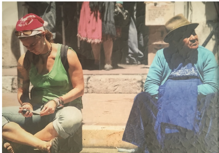
Figure 5. Generational Gap Among Community Members (Dirección de Relaciones Externas, 2016)

Generational differences can often create social barriers and many individuals have shown concerns associated with these differences. The most prominent group of immigrants in the city are North Americans and many of these individuals are considered to be of the third-age, or over the age of 65, in Cuencan society (Álvarez et al, 2017). There is a disparity in mindset and ways of life between older generations that is not necessarily associated with current culture. One member of the North American community explained that individuals at the age of retirement do not typically engage with a younger crowd in North America, let alone in a different country. Though this disparity in age amongst the two groups is not necessarily tied to cultural differences, it has further propagated social divides between both communities. Recently,