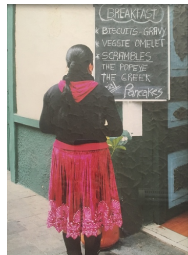
Figure 3. Language Barriers - Ecuadorian Women Reading English Sign (Dirección de Relaciones Externas, 2016)

Despite these barriers, most North Americans interviewed had tried - or were in the process of - improving their language skills. Individuals acknowledged that Spanish classes are