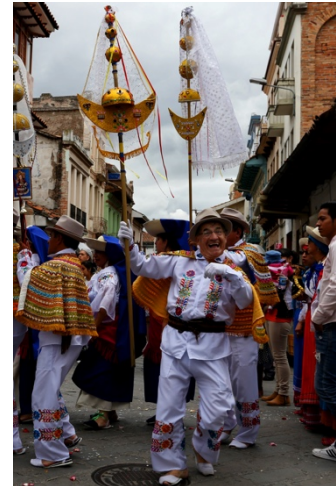
Figure 1. Cultural Festivities in Cuenca, Ecuador (Heavey, 2017)

them to do so. However, if the individual has no intention of integrating into the culture, they will likely struggle in day-to-day life.” Many retirees can enjoy a new and beautiful experience during their time in Cuenca. Others described the possibilities of engaging the community through different facets of everyday life, such as through participation in religious and political groups. For example, many individuals claimed that Cuenca is extremely welcoming to all faiths, despite the high prevalence of Roman Catholicism within the city. Participants stated that there are various opportunities to get involved in all aspects of religion; one couple was able to begin a practicing Buddhist group within the city and gained what they described as a substantial number of participants. Through this group, the couple was able to make new friends, learn about the community, and better understand Cuenca as a whole. With the variety of possibilities for new experiences that a retiree can enjoy in Cuenca, they can truly enjoy their time peacefully.