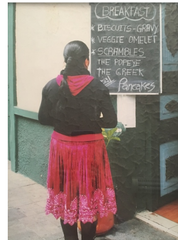
Figura 3. Barreras lingüísticas – Una mujer con un enseñal en inglés (Dirección de Relaciones Externas, 2016)

Según nuestros patrocinadores, la Dirección de Relaciones Externas, su objetivo principal es la internacionalización – el proceso en que una comunidad intenta interactuar con el mundo en una escala internacional – de Cuenca. Este departamento está tratando de comprender y mejorar las interacciones entre los norteamericanos y los cuencanos. Esperamos comprender esta brecha entre las dos comunidades para ayudar a nuestro patrocinador mientras tratan de resolver los problemas de integración. Después de la afluencia de inmigrantes norteamericanos en Cuenca, la Dirección de Relaciones Externas ha establecido muchos eventos para facilitar la integración de las diversas comunidades, tratando de fomentar una mejor relación entre estos grupos. Sus enfoques incluyen las invitaciones de oradores principales que hablan en los universitarios y establecen tiempos específicos en lugares locales que se comercializan hacia los norteamericanos para la práctica lingüística y las discusiones culturales (Dirección de Relaciones Externas, 2014). La aumentación de las tasas de inmigración, sin embargo, ha llevado a nuestro patrocinador para buscar los métodos de aumentar sus programas. Como un resultado, nosotros estamos investigando y abordando los problemas asociados con la integración de los jubilados norteamericanos en la sociedad cuencana. Para lograr este objetivo, desarrollamos la siguiente meta y objetivos del proyecto.