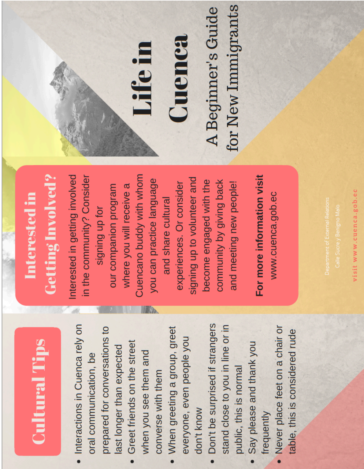
Figure 6. Outer Side of Cultural Acclimation Pamphlet