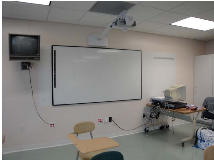
Figure 2 – Eno Board and Projector

The projector is used for multiple purposes; sometimes notes are projected and explained, and sometimes a list of problems for the class to complete is shown on the screen.