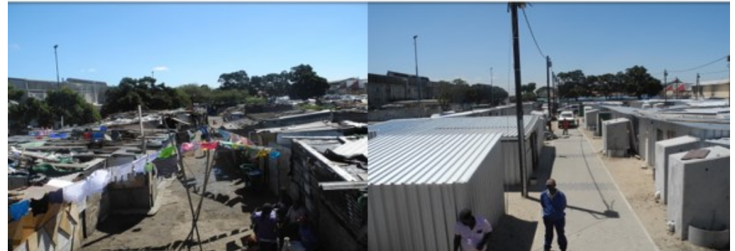
Before and After the Reblocking of Flamingo Crescent

Although reblocking helped to alleviate some of the adversity the community of Flamingo Crescent had experienced in the past, children were still playing in the