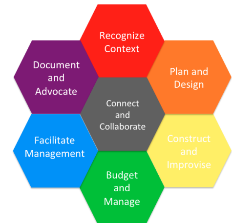
Participatory Development and Adaptation Process

PDAP involved all partners in an improvisational design and construction process that sought to best utilize each partners' assets