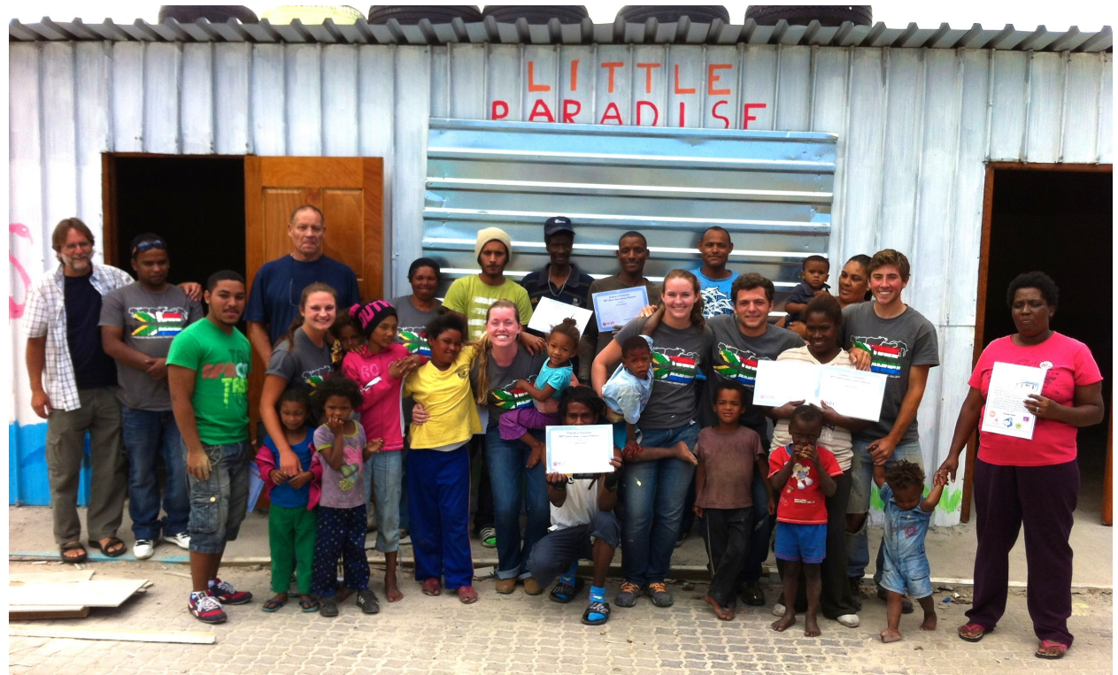
Final Picture Taken of Community Members, Sponsor, Partners, and WPI on December 12, 2014