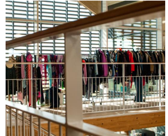
Secondhand shops are increasing in quality

Even if you think someone won't find a use for your old items, don't hesitate to donate! You never know what someone could use, and if it cannot be reused it could be recycled instead.