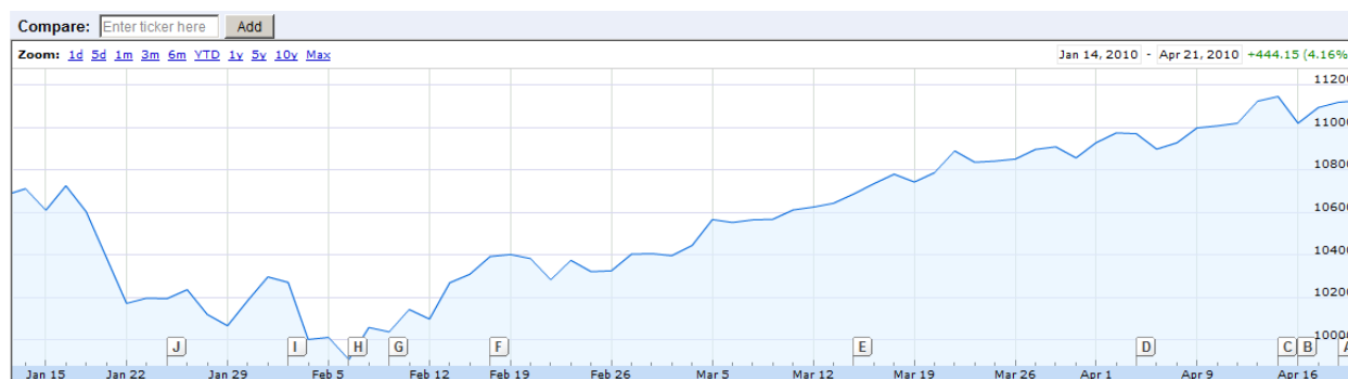
Figure 2: SPX Performance from 1/13/2010

highs. These recommendations with their accuracy in predicting the market are remarkable and show an aspect of MAPS can be further explored.