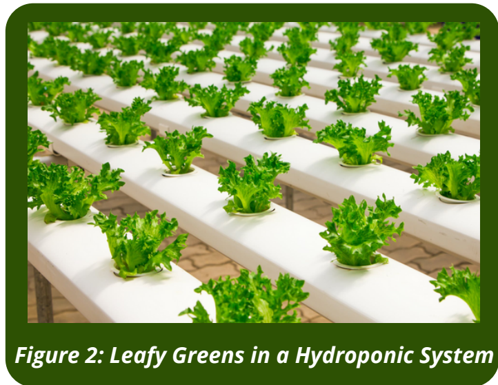
Figure 2: Leafy Greens in a Hydroponic System

Many of the disadvantages in hydroponics and aquaculture are overcome when you combine them and use aquaponics. This is because in aquaponics, you create a self-sustaining ecosystem. This means you do not need to add chemical nutrients to the water and rarely have to replace the water. The system works together to maintain itself (Bernstein, 2011; Stauffer, 2006).