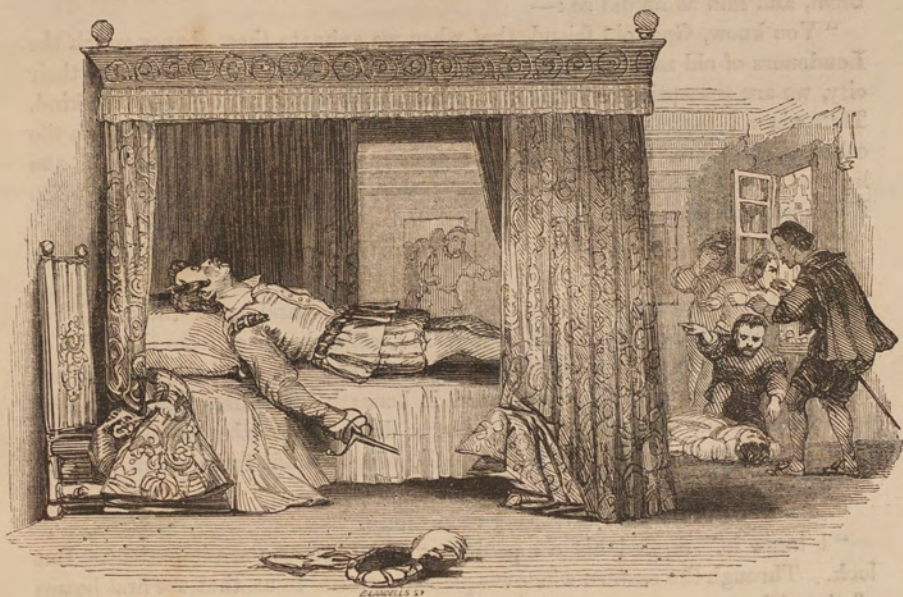
FIRST NIGHT OF THE GIANT CHRONICLES.