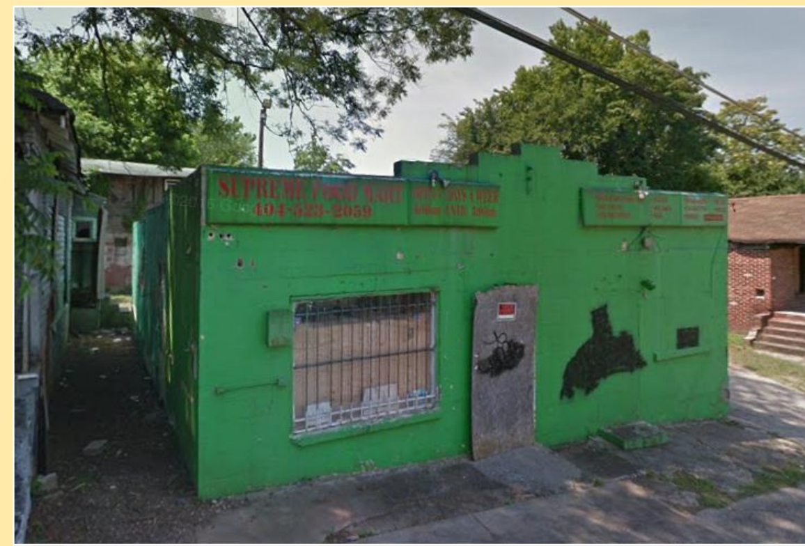
Labelled "Grocery Store" on map