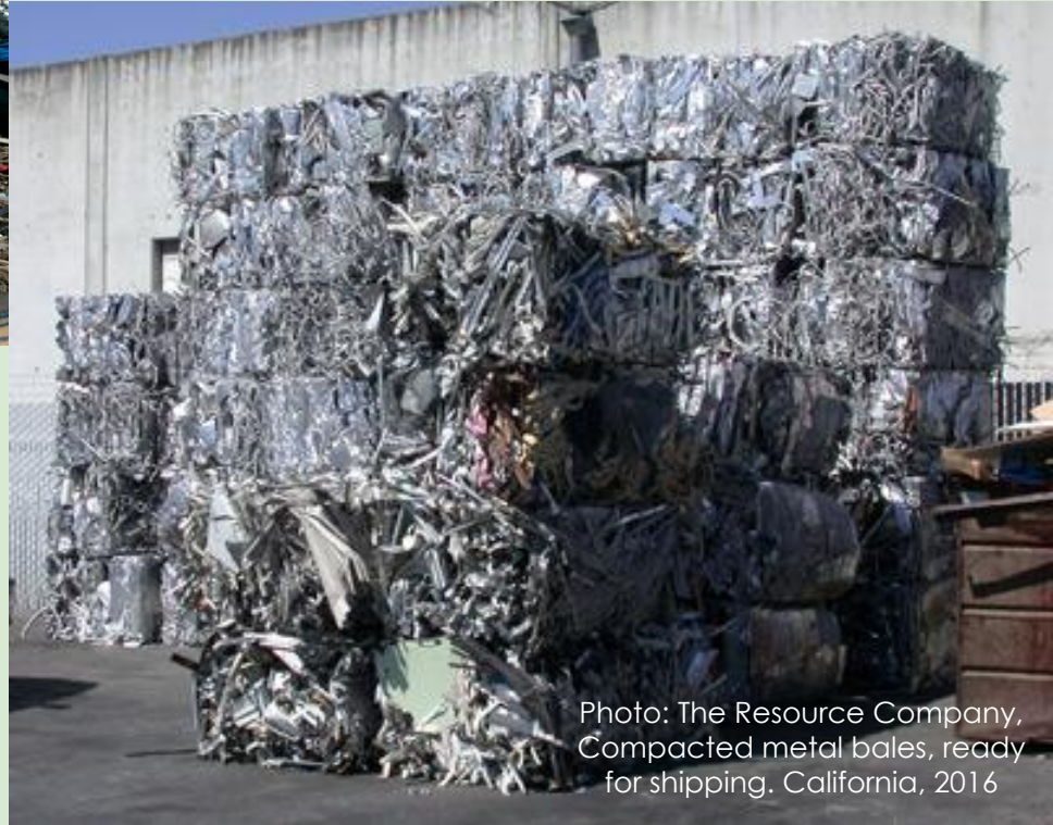
Compacted metal bales, ready for shipping. California, 2016

Shipping waste to established processing plants is viable under certain situations.