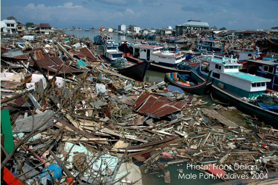
Male Port, Maldives 2004

Shipping waste to established processing plants is viable under certain situations.