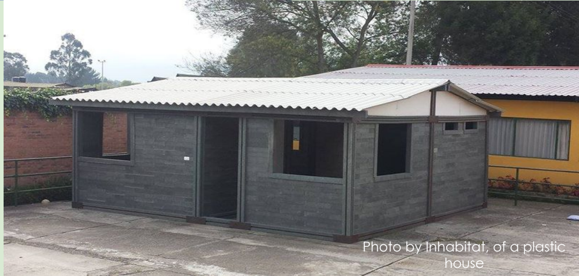
of a plastic house

Plastic structures provide an eco-friendly way to reduce plastic waste.