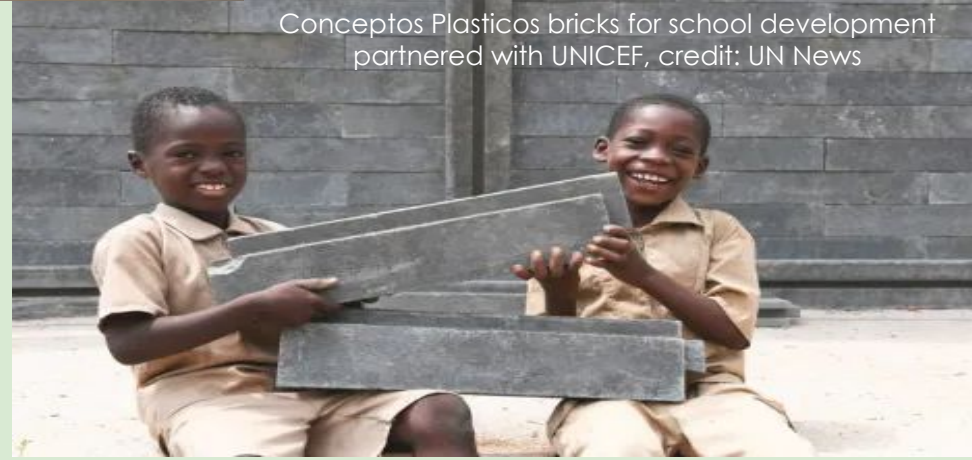
Conceptos Plasticos bricks for school development partnered with UNICEF

Plastic waste can be recycled into useable construction materials.