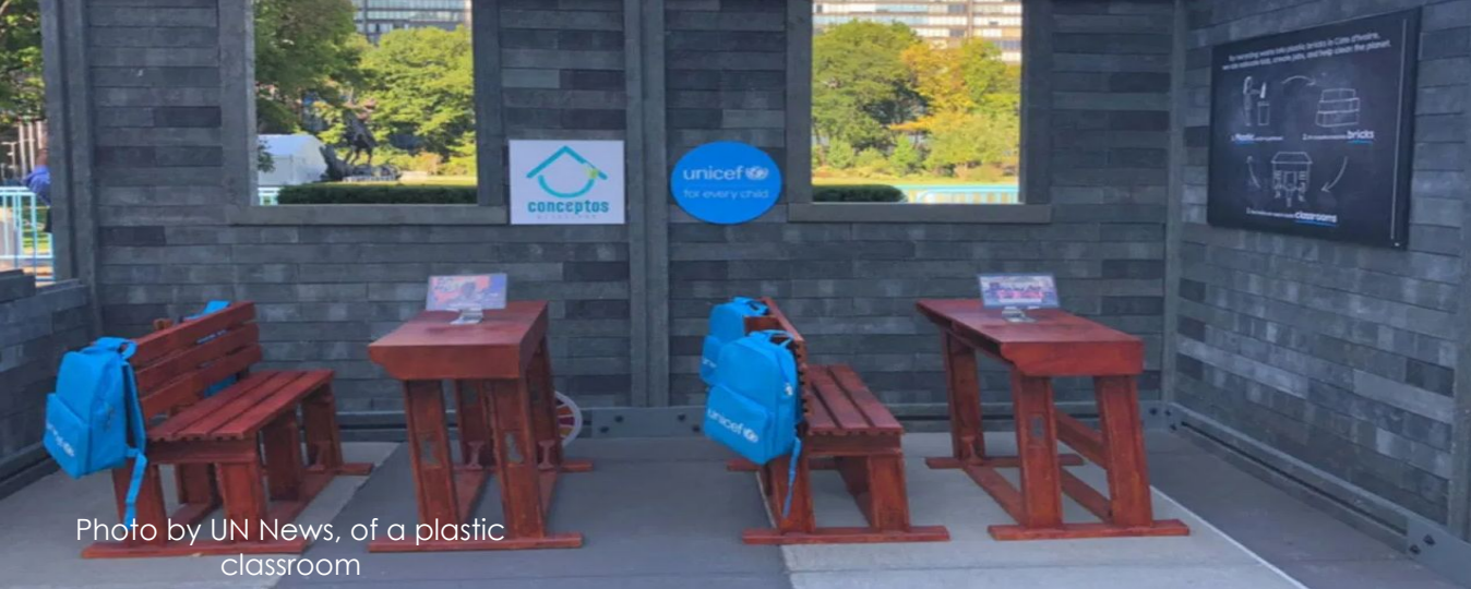
of a plastic classroom

Plastic structures provide an eco-friendly way to reduce plastic waste.