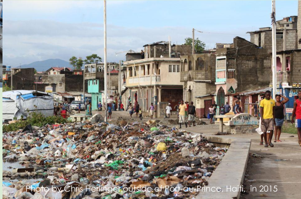
outside of Port-au-Prince, Haiti, in 2015

Discarded packaging creates a substantial waste problem.