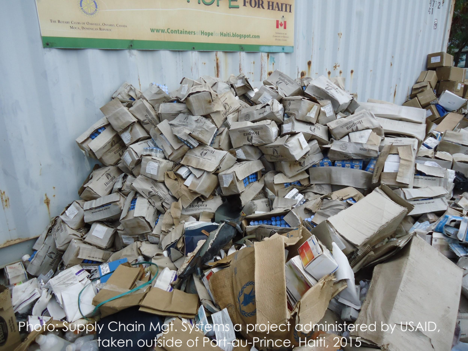
taken outside of Port-au-Prince, Haiti, 2015

Discarded packaging creates a substantial waste problem.