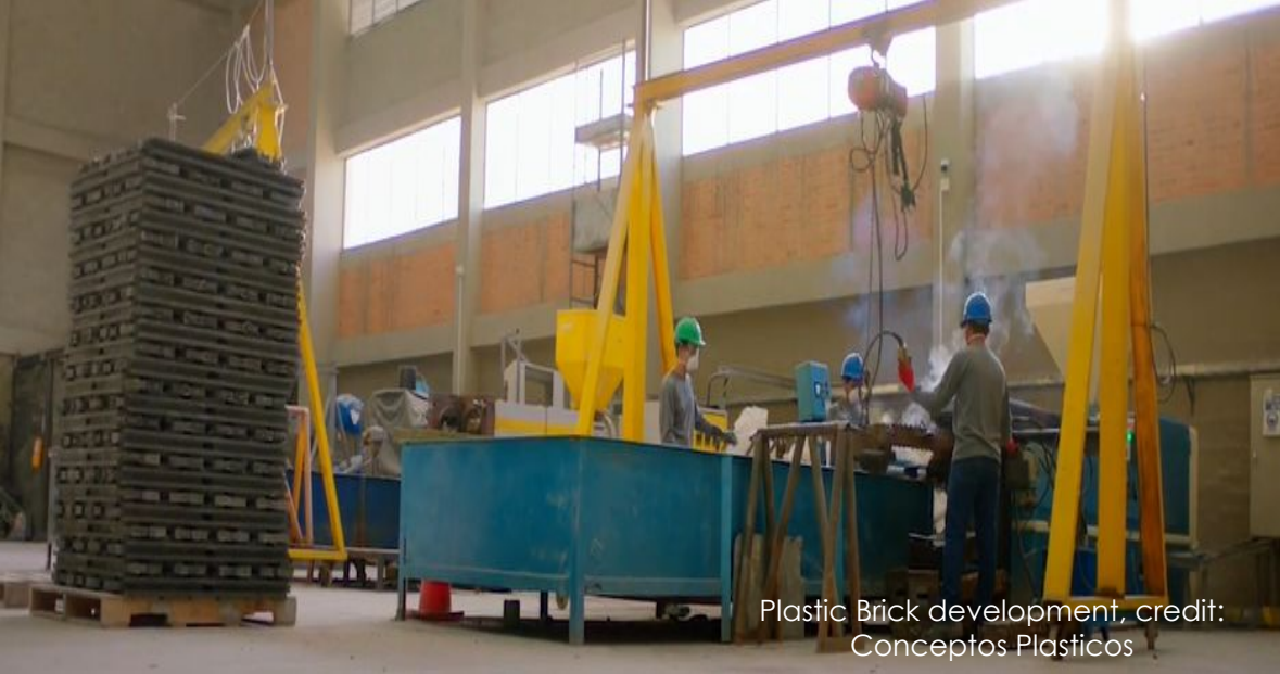
Plastic Brick development

Plastic waste can be recycled into useable construction materials.