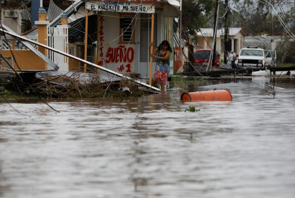
Photos of Puerto Rico after Hurricane Maria in 2017

Assessing the viability of Waste Management solutions depends on local conditions