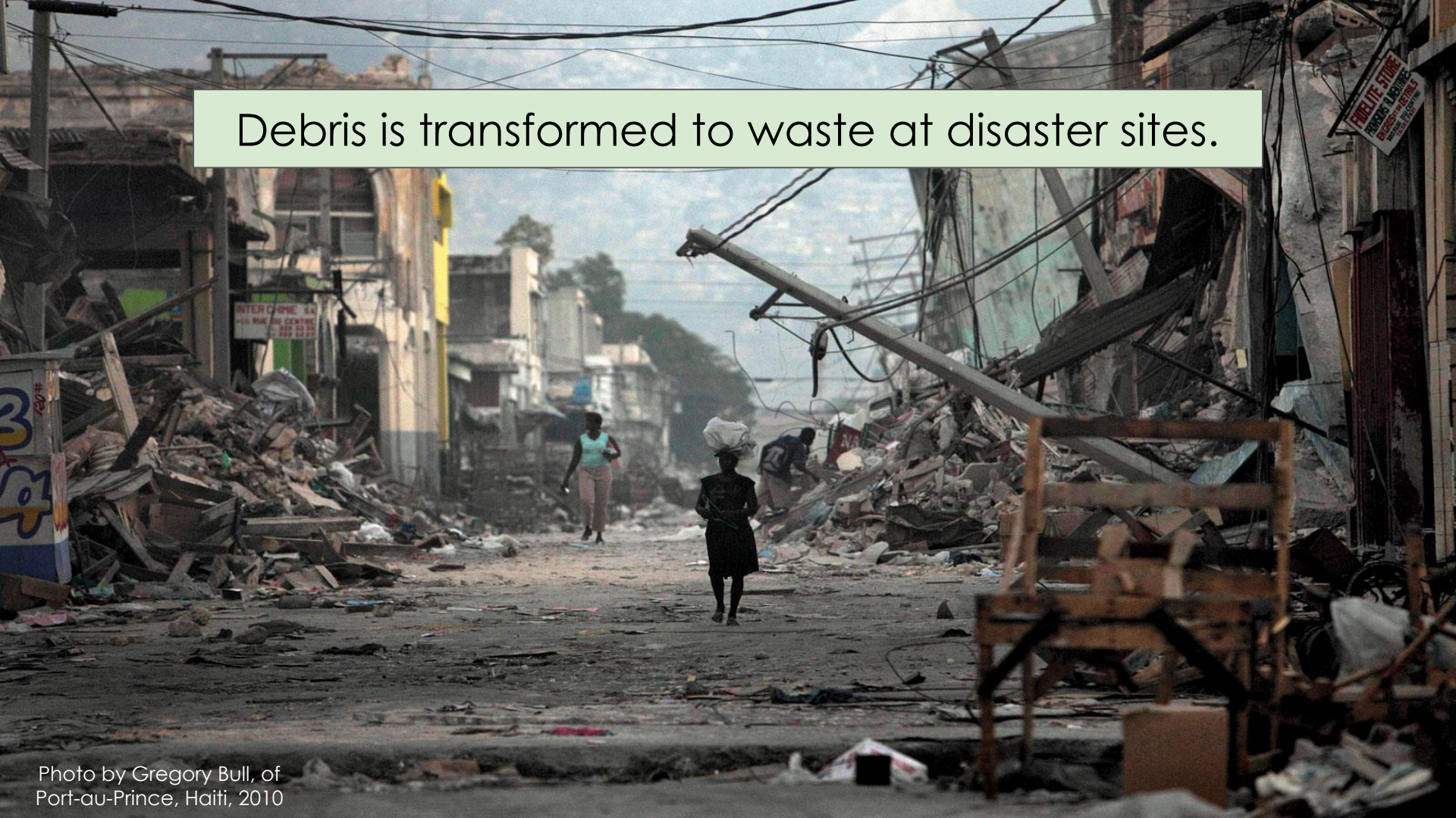
of Port-au-Prince, Haiti, 2010

Debris is transformed to waste at disaster sites.