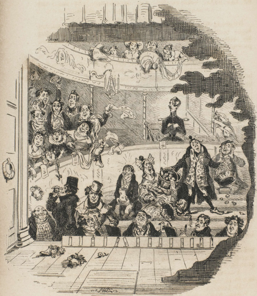
The great spectacle for Miss Snowbellicci!