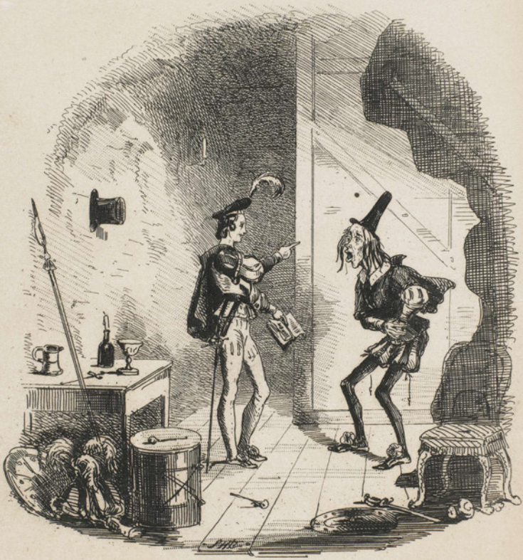
Nicholas instructs Smike the Art of Acting.