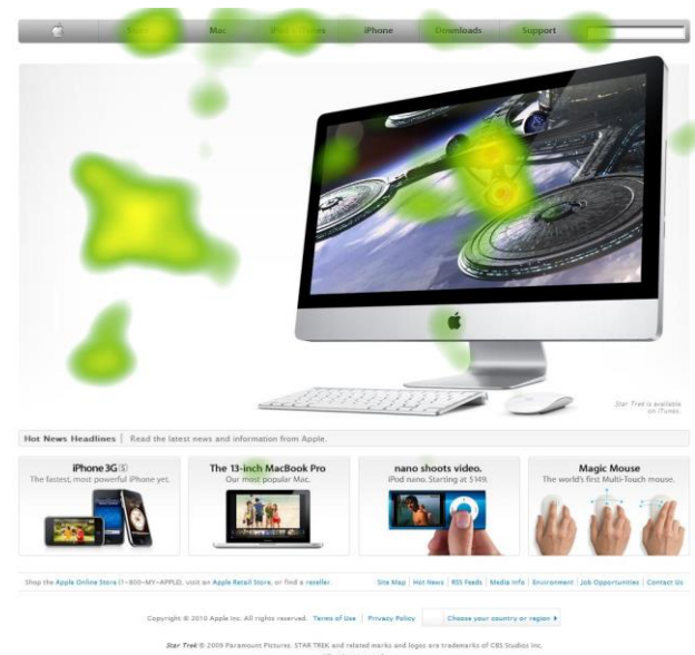
Figure 1: Example of viewing trend