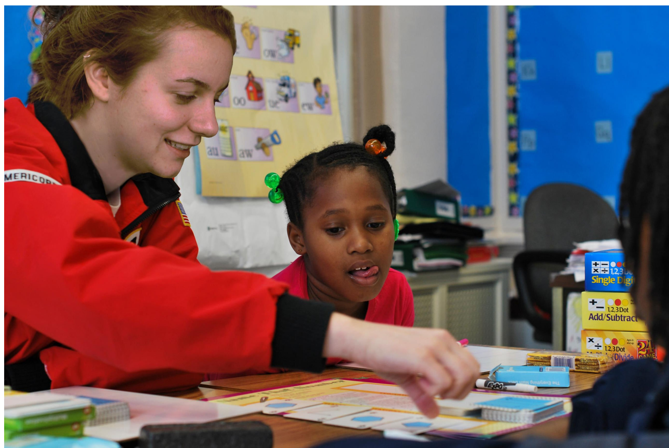
Tutoring in the Classroom