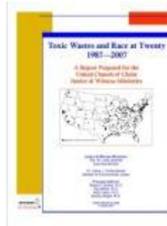
Figure 1 The Toxic Wastes and Race at twenty 1987-2007 report

Most toxic pollution is caused by heavy industries, manufacturing sites, Steel mills, Chemical plants, abandoned industrial sites and coal-fired plants. These facilities can have a negative impact on the values of nearby properties which are attractive for lower income population and also for the hazardous waste companies to buy land to dump its waste.