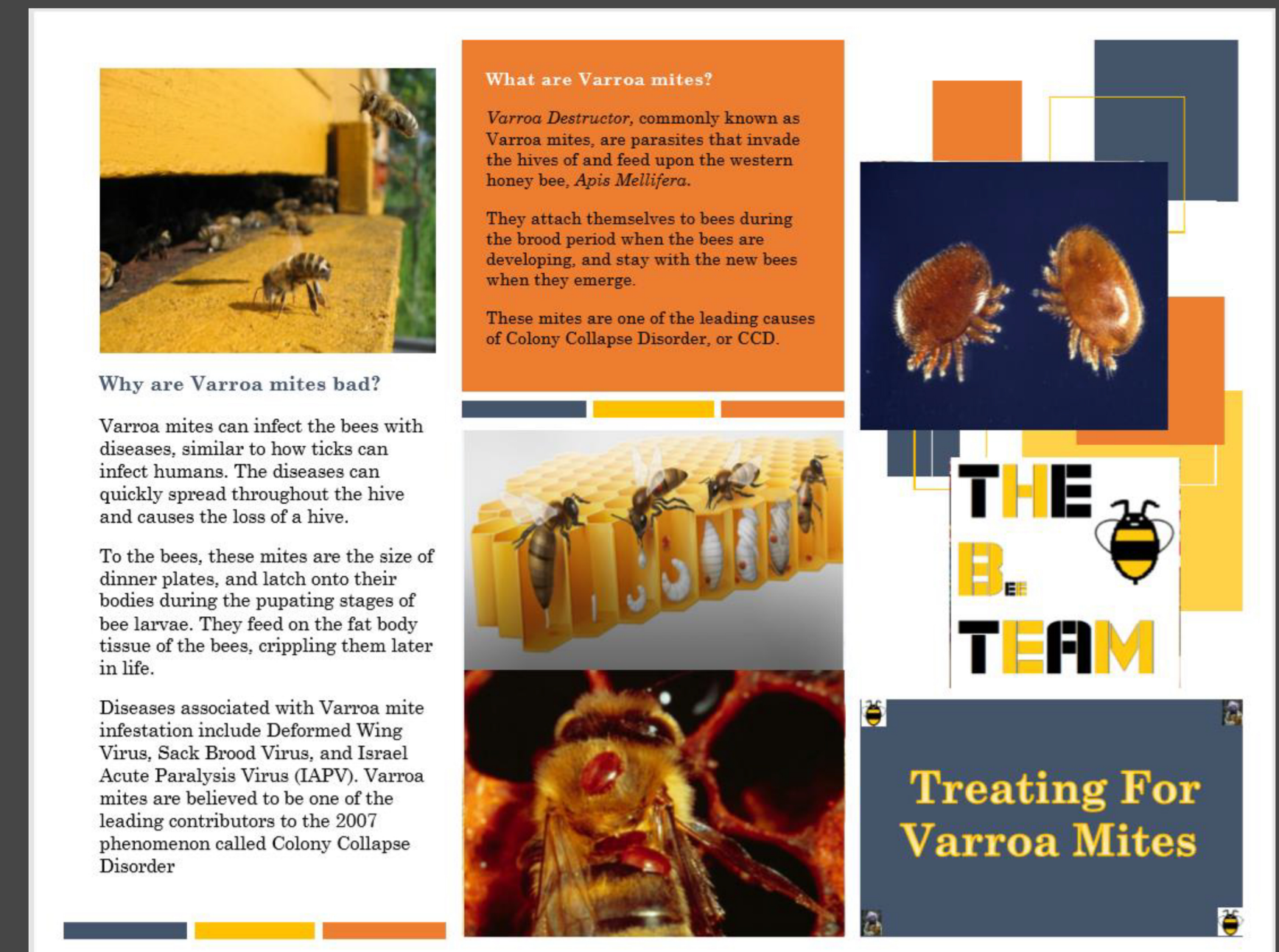
The first page of our armature beekeeper Varroa treatment guide