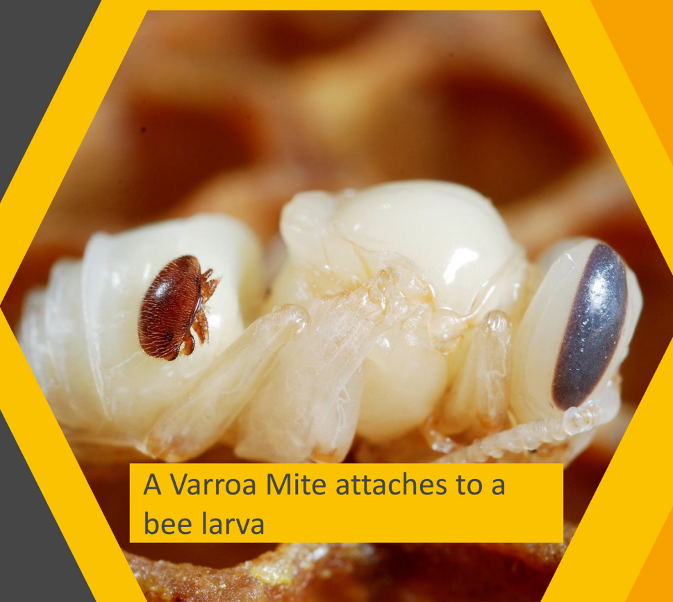
A Varroa Mite attaches to a bee larva

Even when bees ingest "sublethal" levels of neonicotinoids, bees experience flight and navigation issues, and lowered taste sensitivity. Further, as these chemicals persist in the environment, they can accumulate in high concentrations within the walls of the hives.