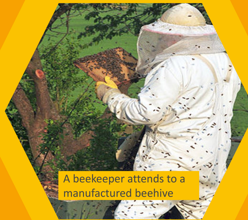
A beekeeper attends to a manufactured beehive

This organism latches onto bees during the larval stage of their development and feeds on fat body tissue.