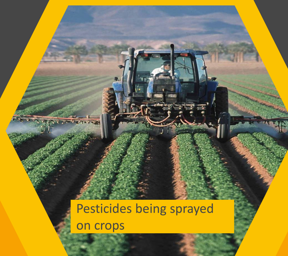
Pesticides being sprayed on crops

Some stress is due to inadequate beekeeping practices. New beekeepers have little access to appropriate training, products, and knowledge to ensure proper care of bees.