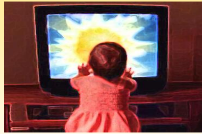
Talk to your children about the effects of advertising; they will understand.

Any type of instruction and education on marketing and advertising will help children become more aware consumers. However, the best strategy for fast food advertising and fast food consumption is for parents to lead by example and constantly discuss the effects of marketing and advertising.