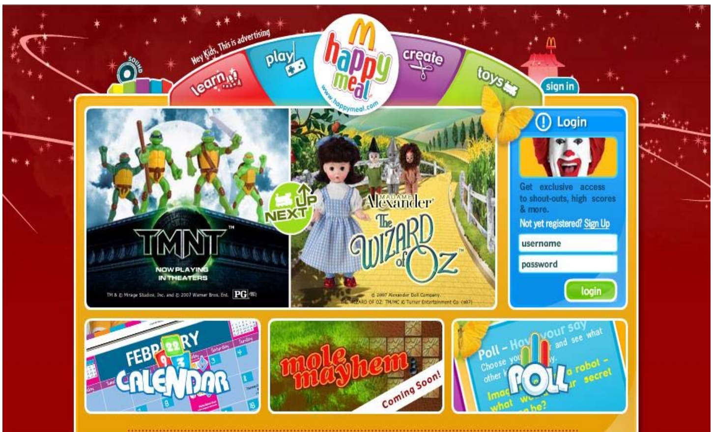
The website is required to state that it is advertising. You can see the disclaimer at the top in white, "Hey Kids, This is advertising." Note the use of bright colors which are used for association with fun and games. McDonald's actively uses bright colors throughout their marketing campaign and in their restaurant. In addition, the prominence of the toys is a major part of McDonald's marketing.

McDonald's spent $528.8 million in marketing to support $24.4 billion in sales.