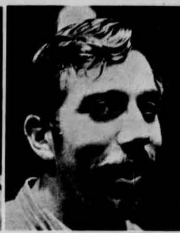
SKIP "THE BRILL" PALTER