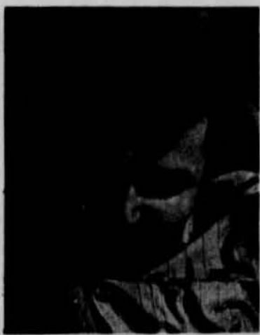
HOPKINS — INDEPENDENT