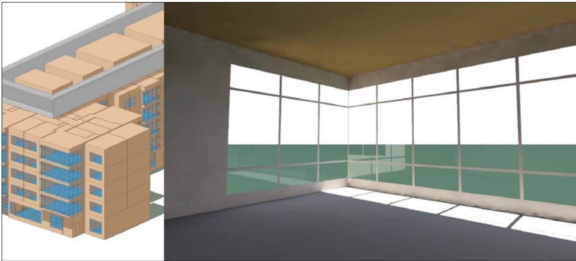
Figure 6 - Sun Shadow Analysis Model Sample (Worcester Polytechnic Institute, 2007)

of sight to the outdoors. As mentioned previously, WPI ran extensive simulations to establish the criteria for this point. Samples are below (Worcester Polytechnic Institute, 2007).