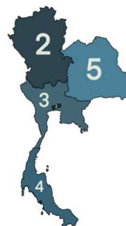
Figure 1: Food Insecurity in Thailand by Region (National Statistical Office, 2013)