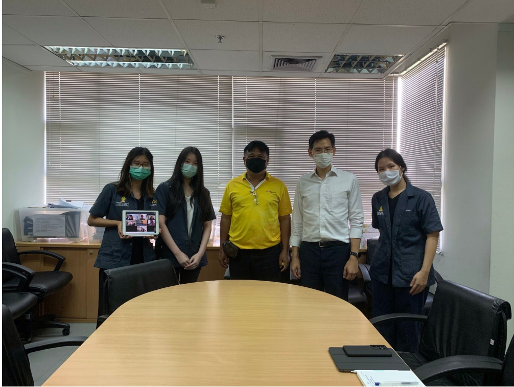
Figure 3: Interview with Chulalongkorn University’s cafeteria supervisors