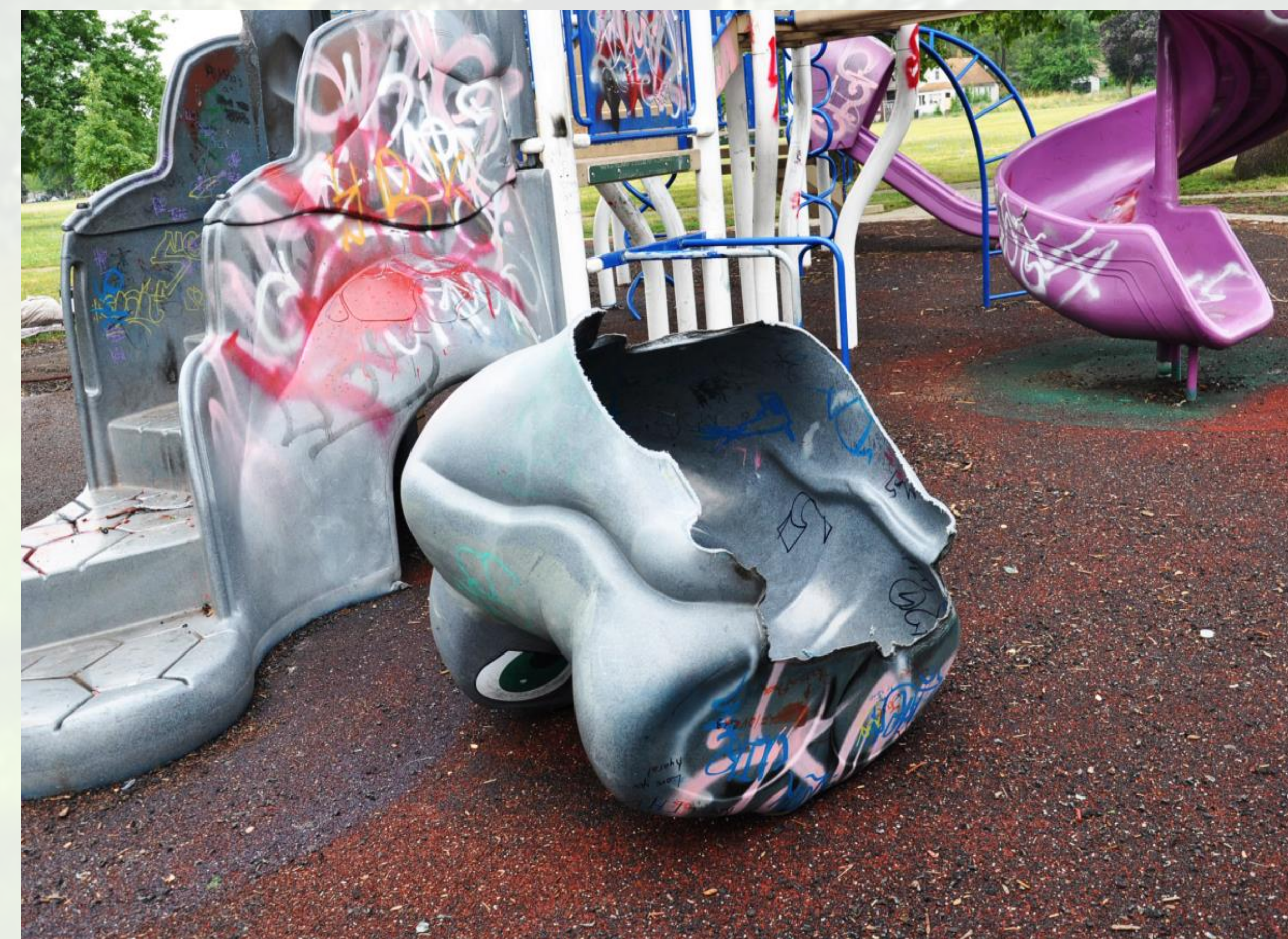
Vandalism in Romanowski Park [6]