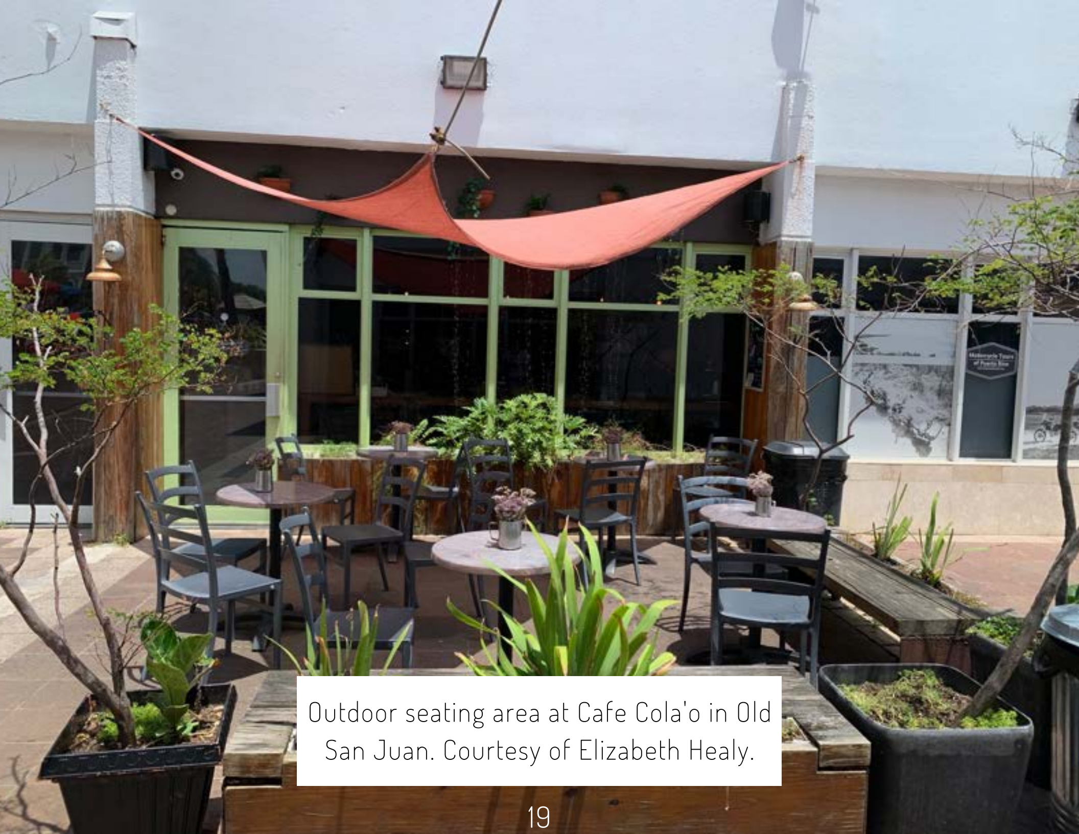
Outdoor seating area at Cafe Cola'o in Old San Juan.