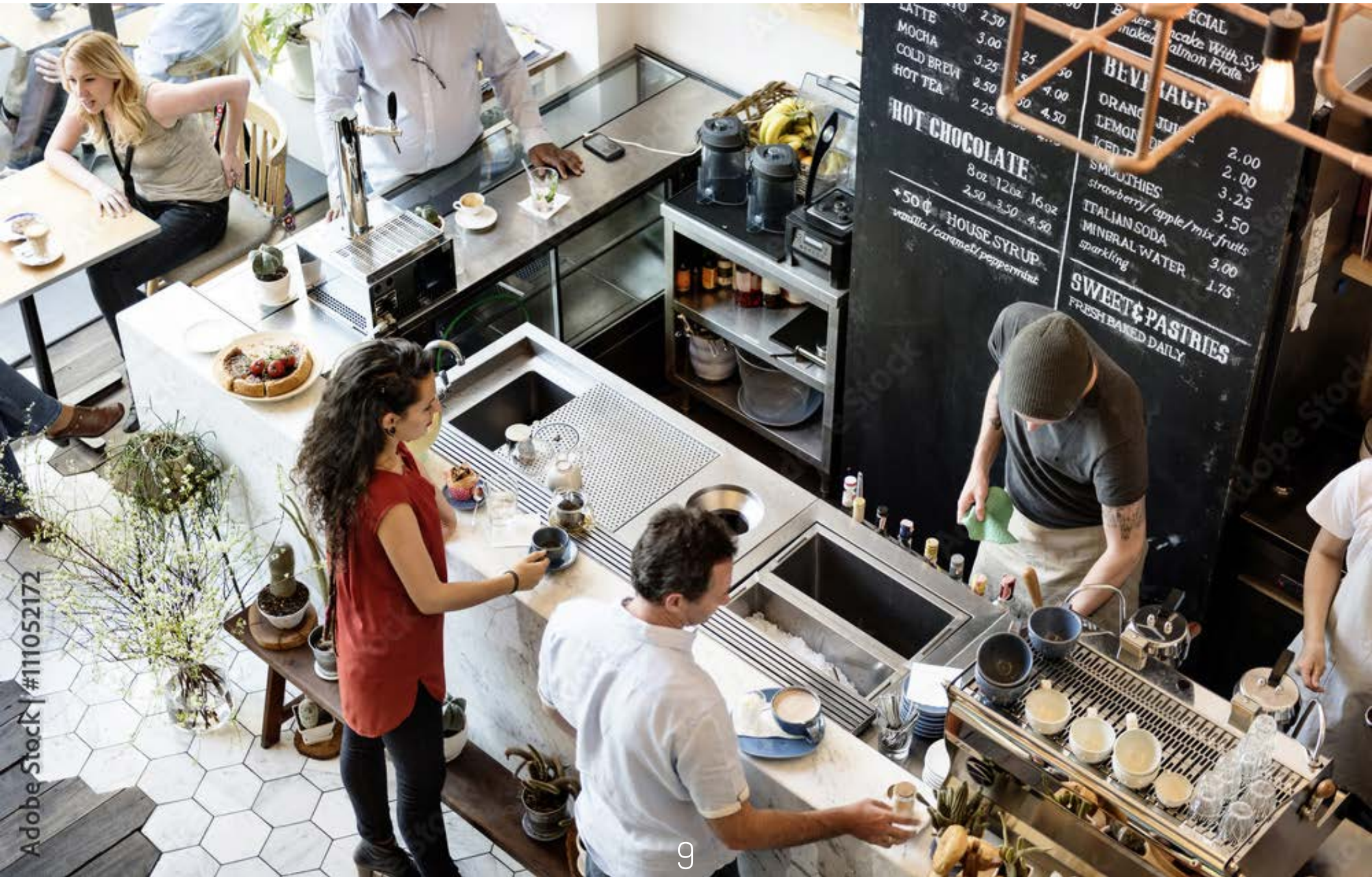
Coffee Shop Bar Counter.