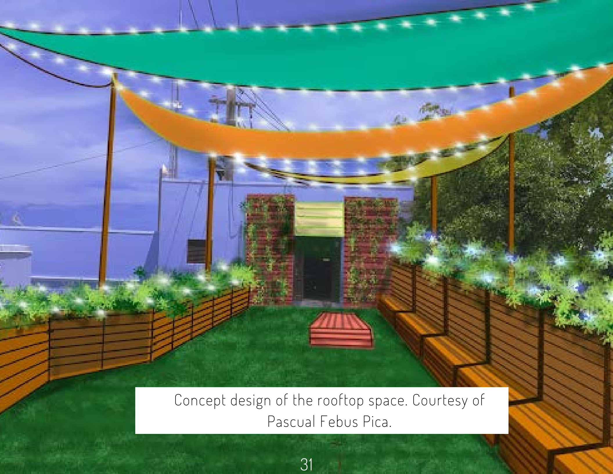
Concept design of the rooftop space.