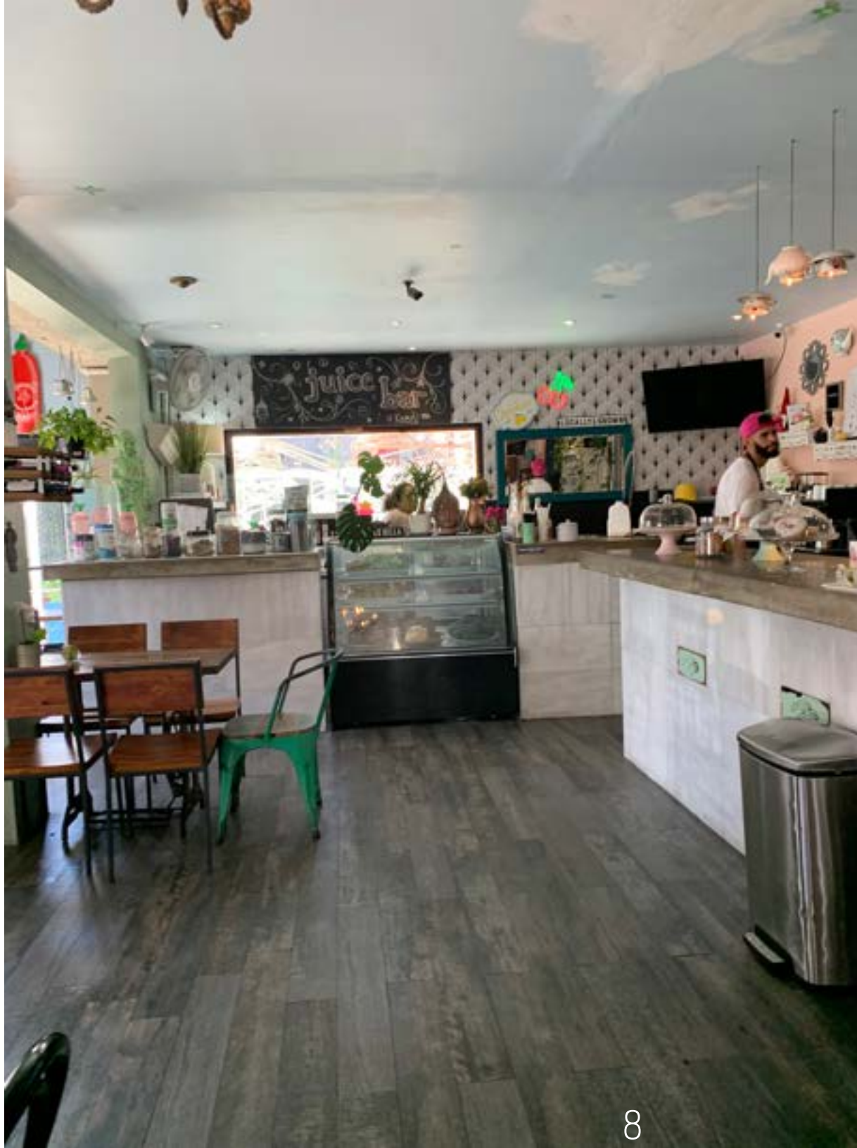
The juice bar and counter at Kamoli, a café in San Juan, PR.