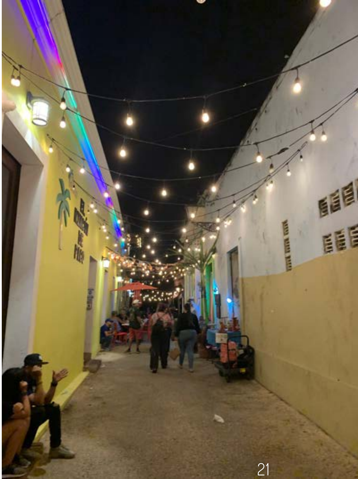
Outdoor lighting in sitting area between buildings in Old San Juan, PR.