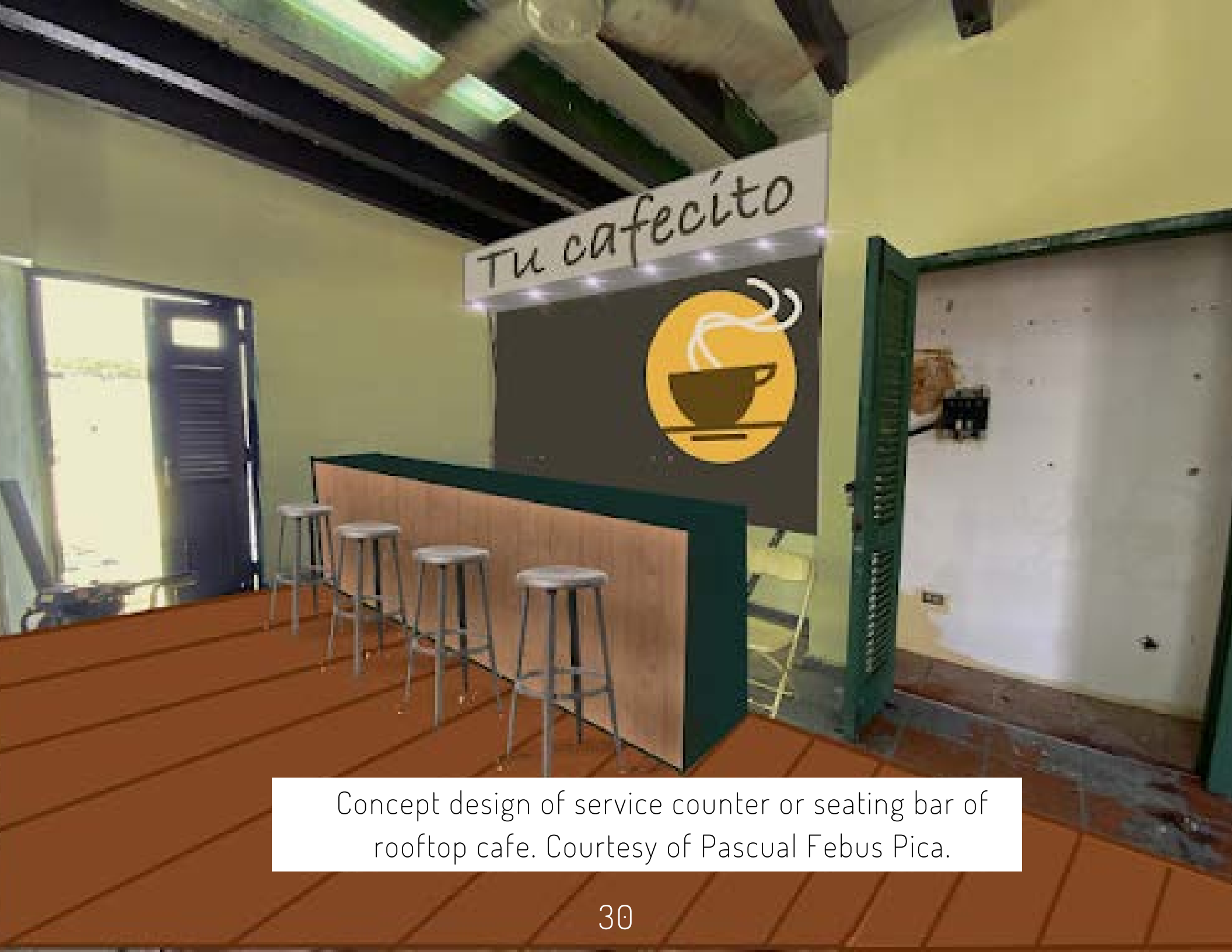
Concept design of service counter or seating bar of rooftop cafe.