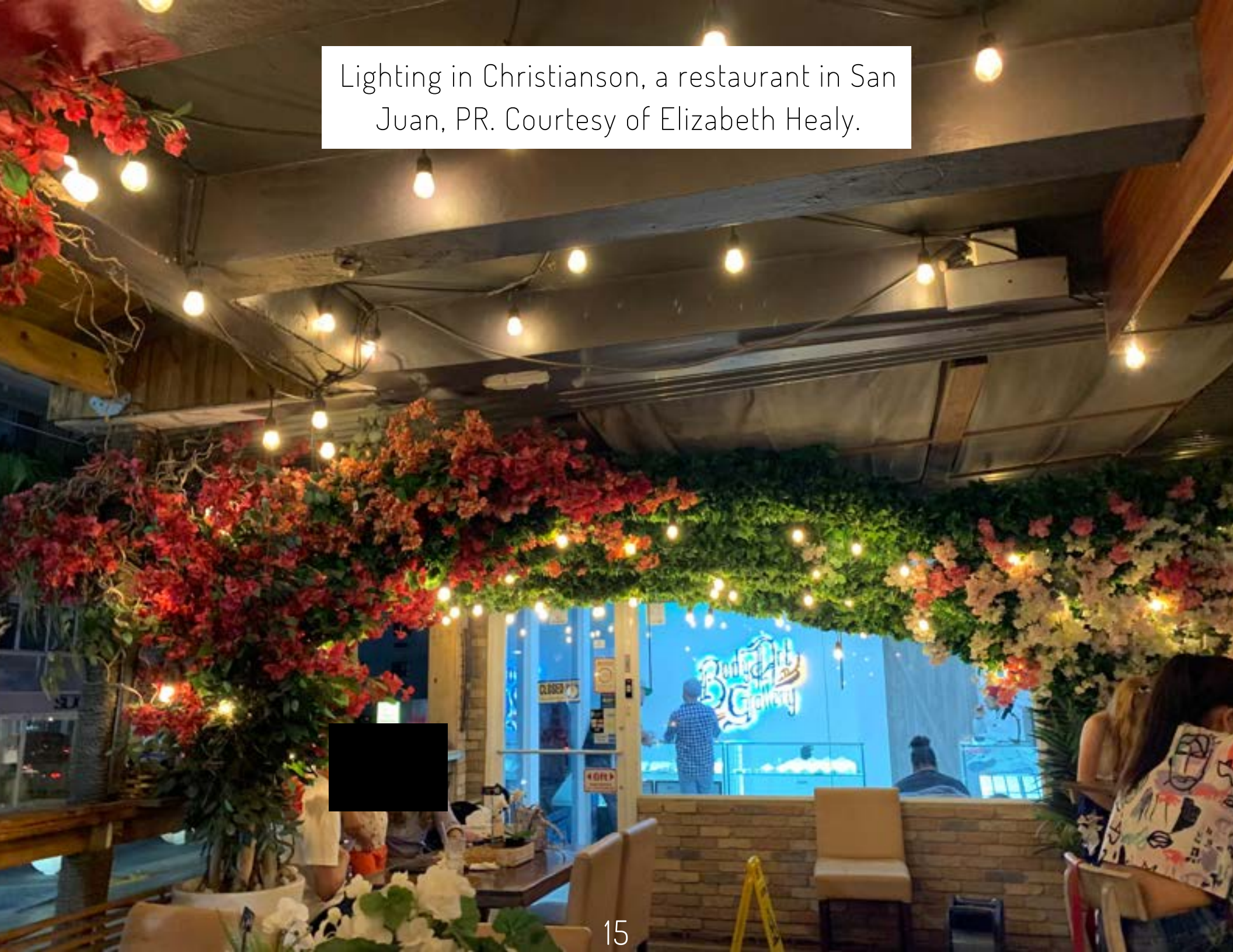
Lighting in Christianson, a restaurant in San Juan, PR.