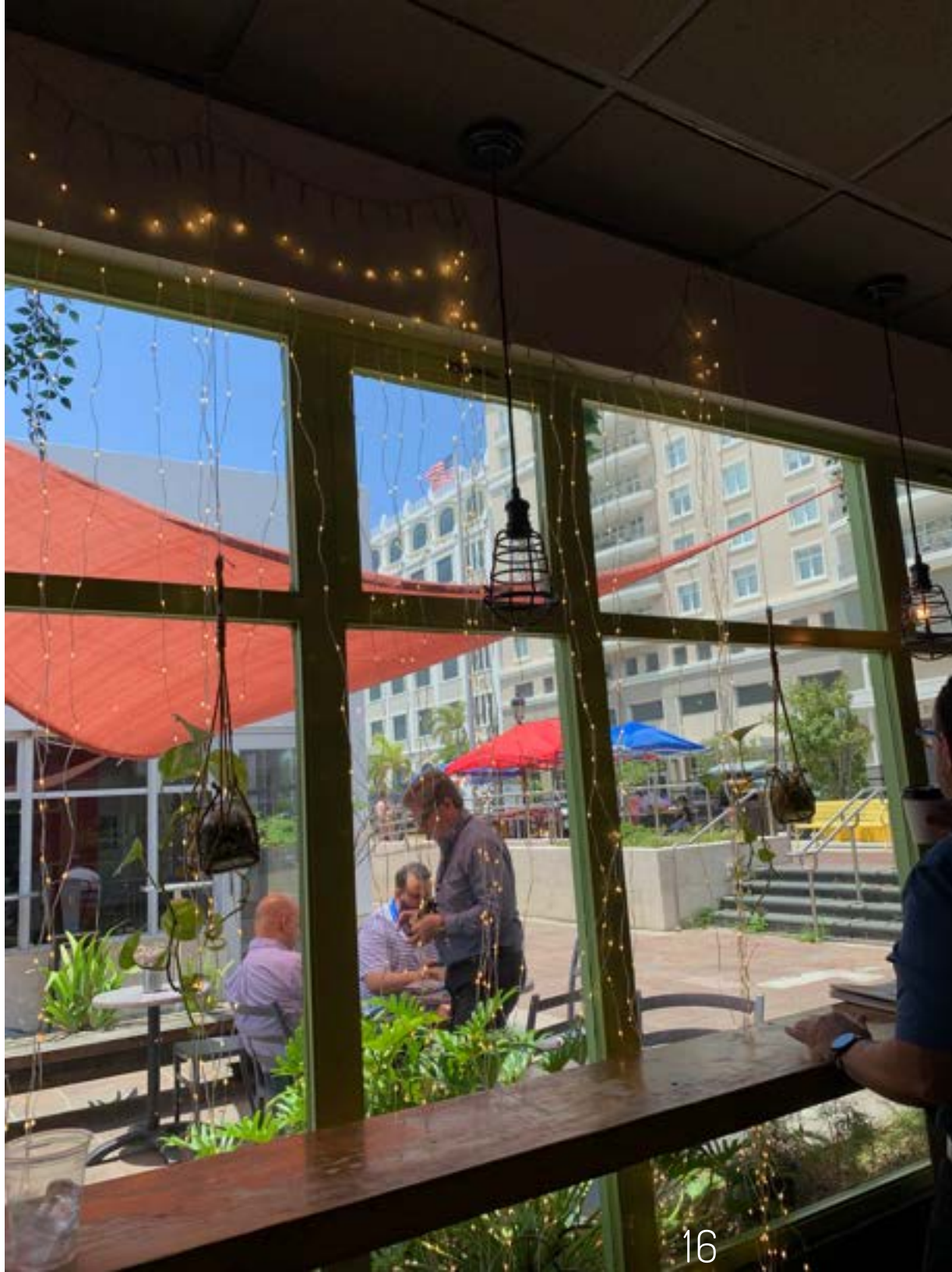
String lighting hanging in front of windows at Cafe Cola'o in Old San Juan.