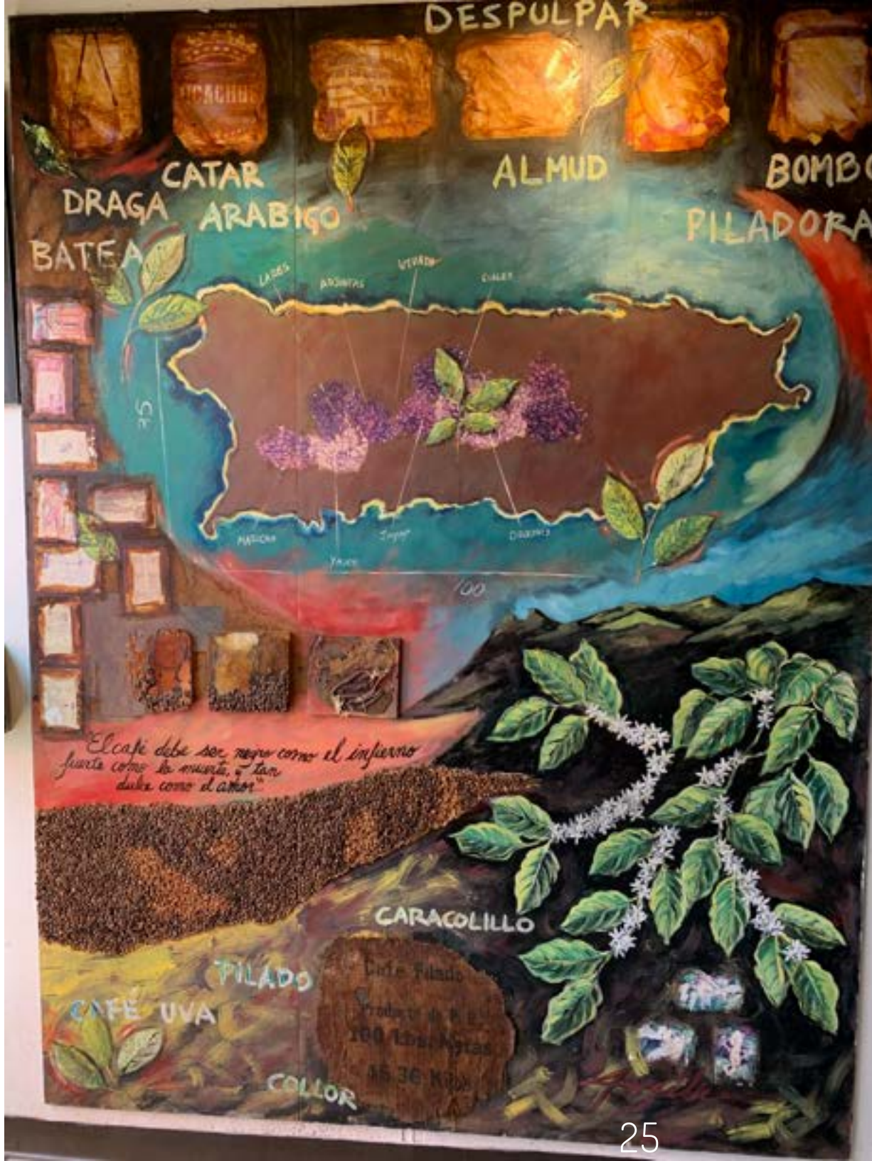
Painting themed around Puerto Rican map and coffee on the wall at Cafe Cola'o in Old San Juan.