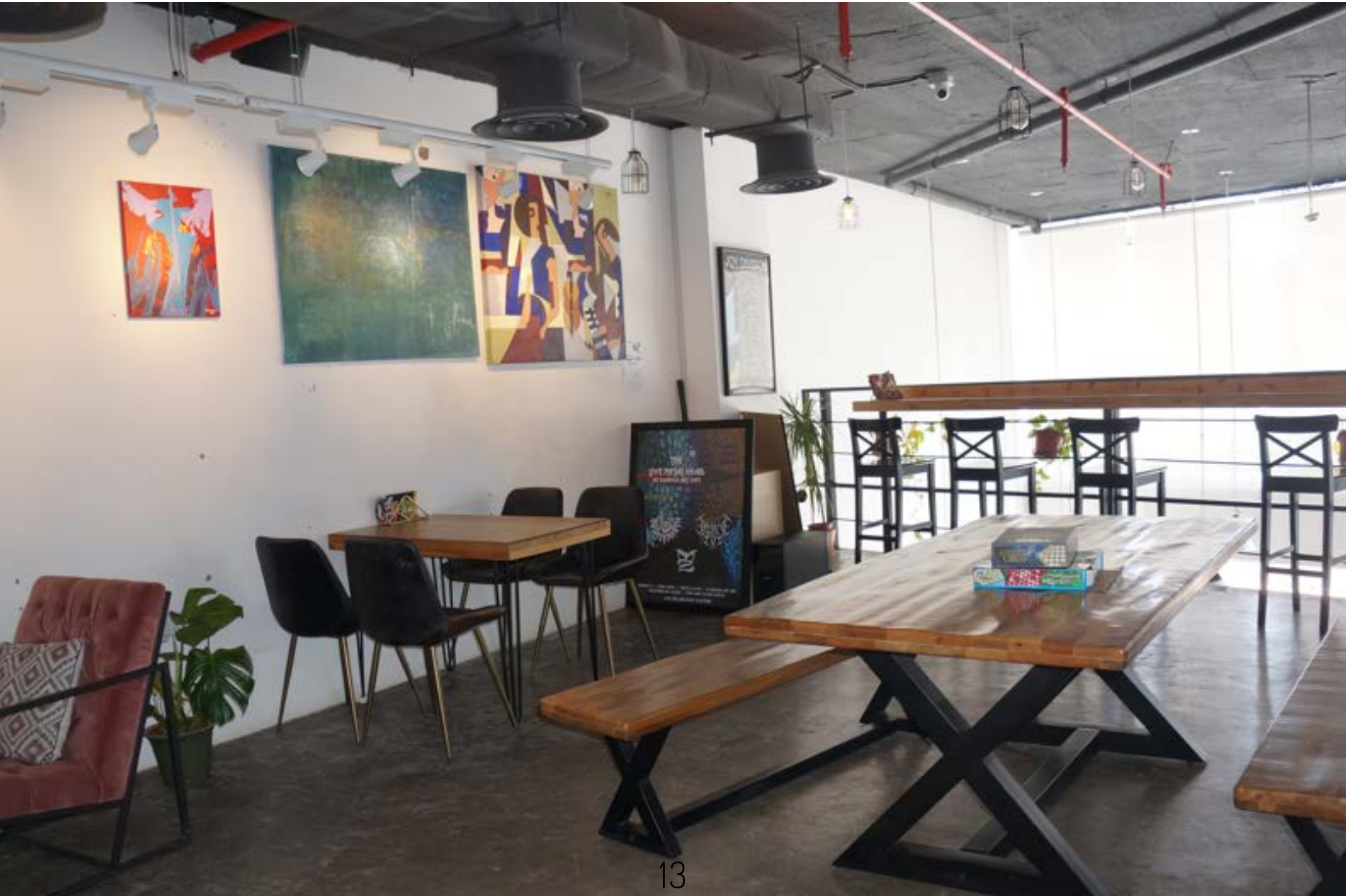
The mezzanine level at the Bohemia Art Cafe.