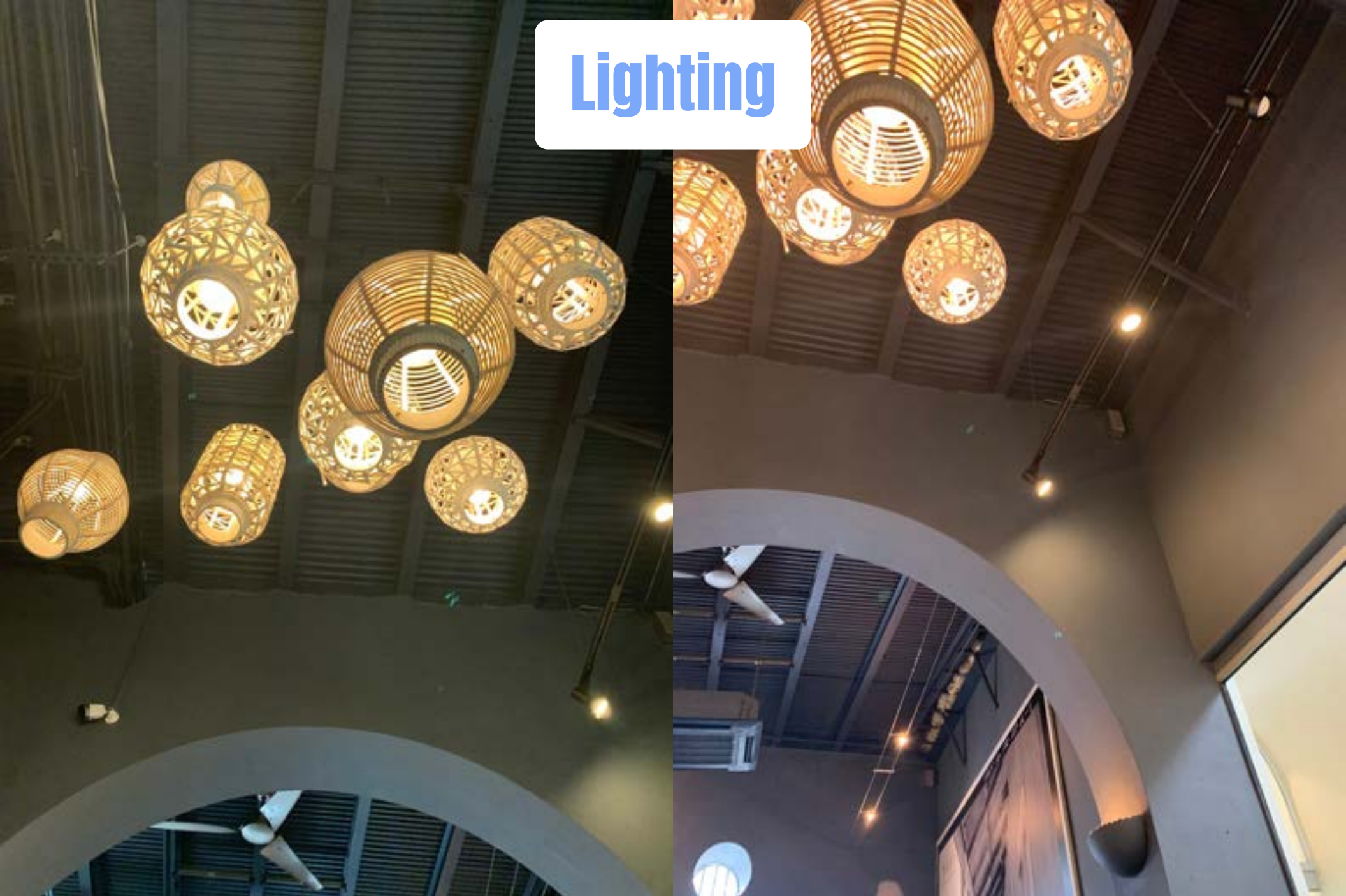
Hanging lighting fixture and strip spot lighting in Cuatro Sombras in Old San Juan, PR.