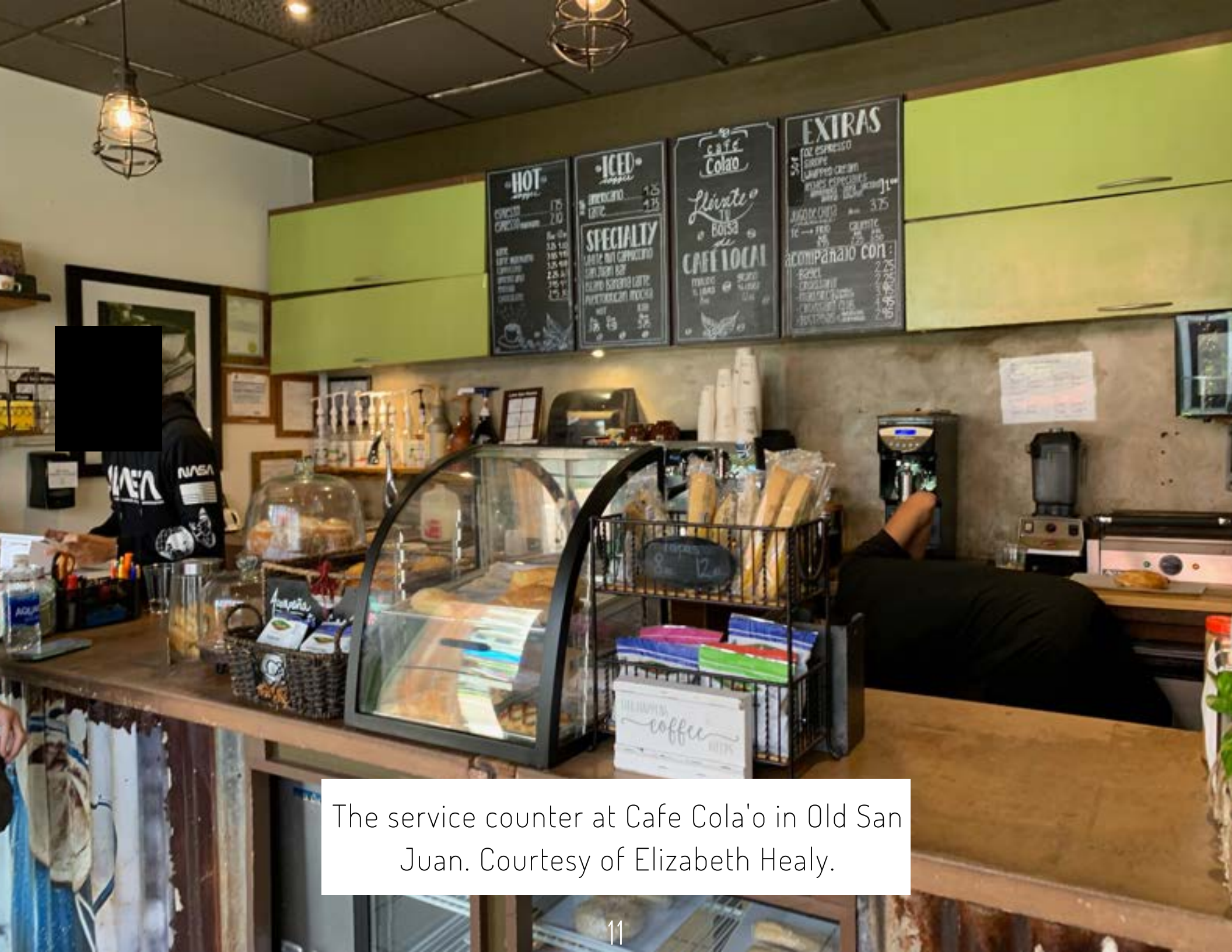
The service counter at Cafe Cola'o in Old San Juan.