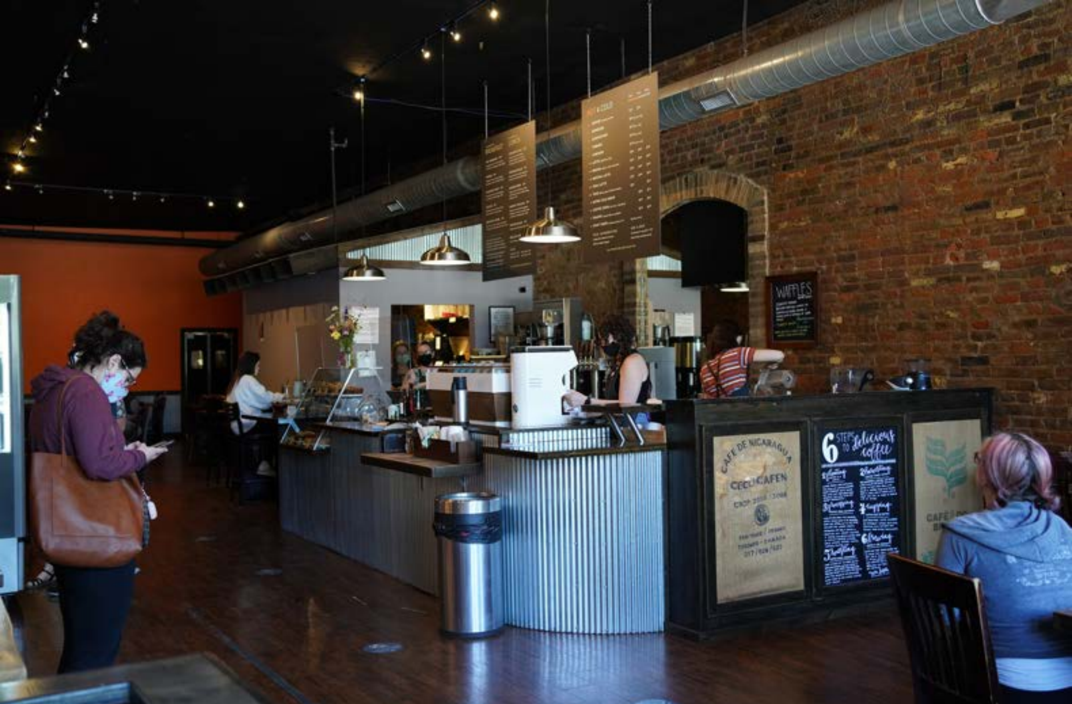
The service counter at Spencer's Cafe in Bowling Green, KY.