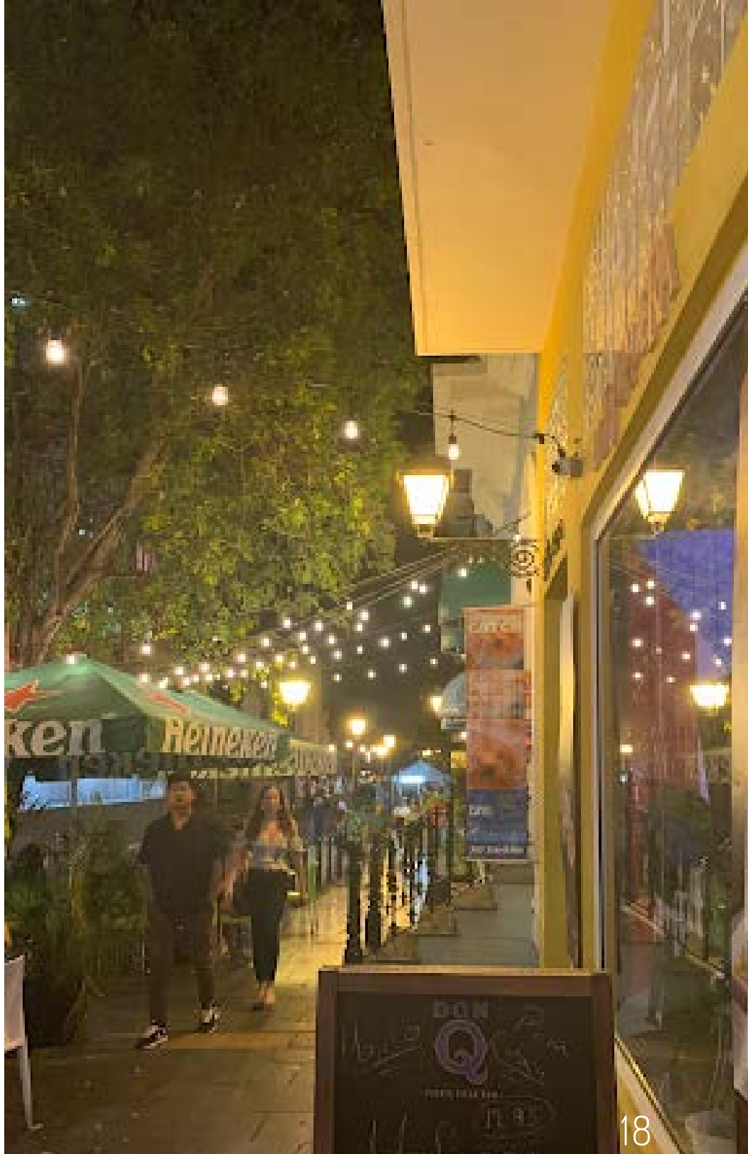
Outdoor lighting at a restaurant in Old San Juan.