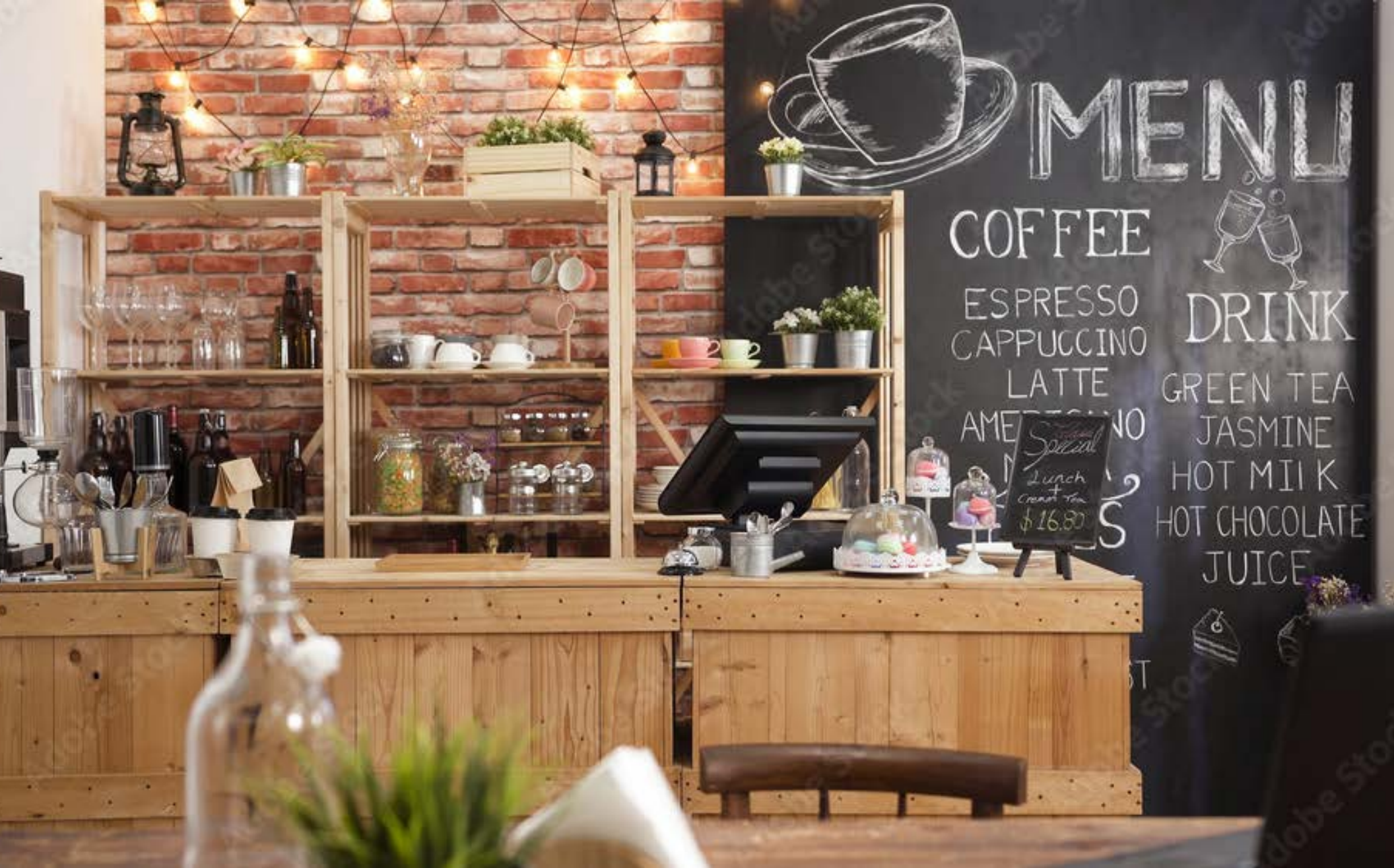
Indoor cafe service counter.