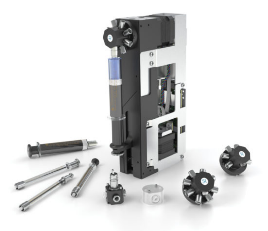
Figure 4.1: PSD/6 Precision Syringe Pump