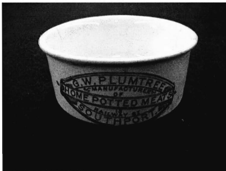
(5) This is a vintage G.W. Plumtree Potted Meat container from 1904.

“Potted meat” is mentioned in the “Lestrygonians” chapter of Ulysses .