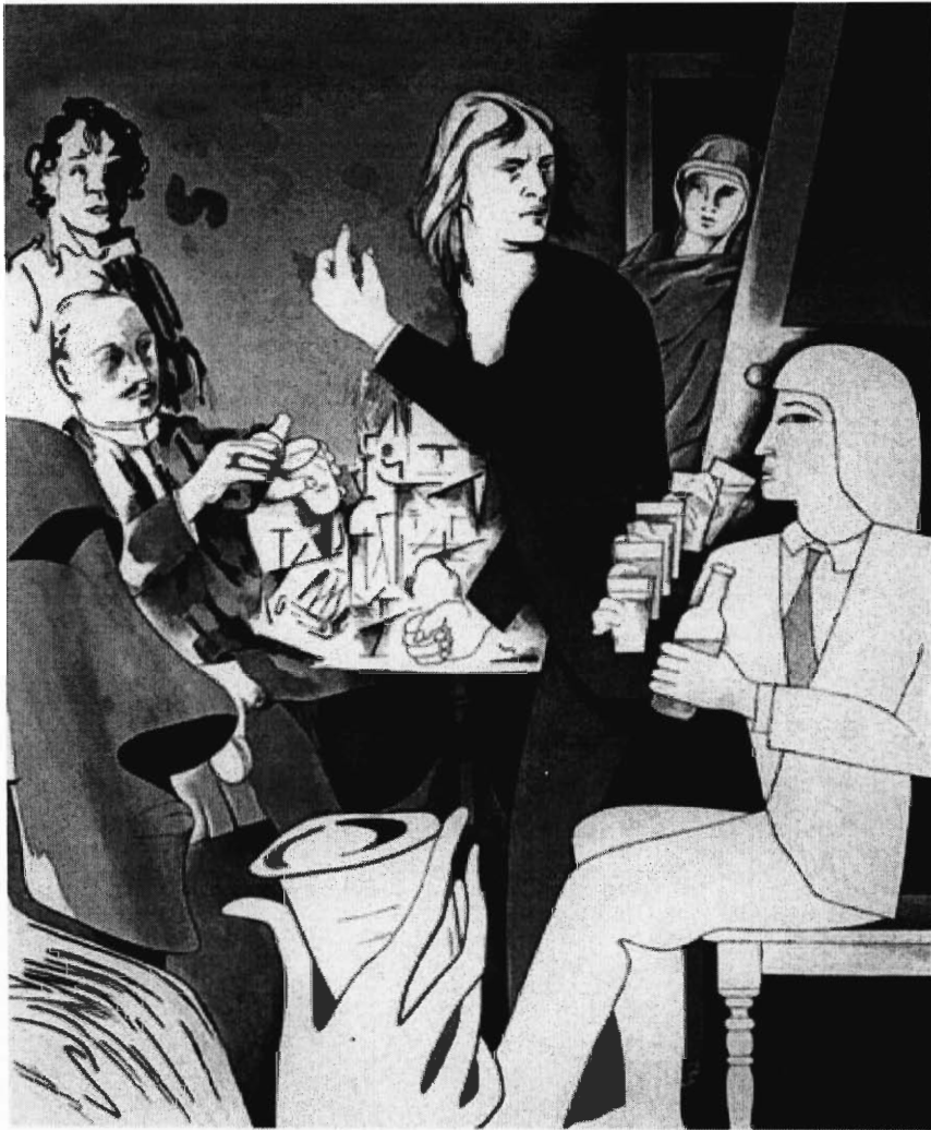
(4) This is an engraving of Stephen Dedalus from the “Oxen of the Sun” chapter of Ulysses .