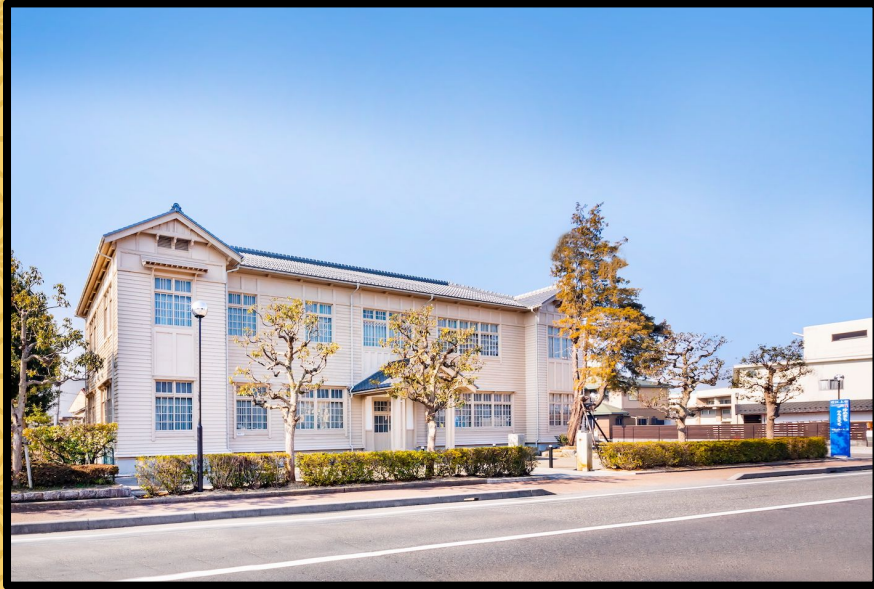
Omi Jofu Museum