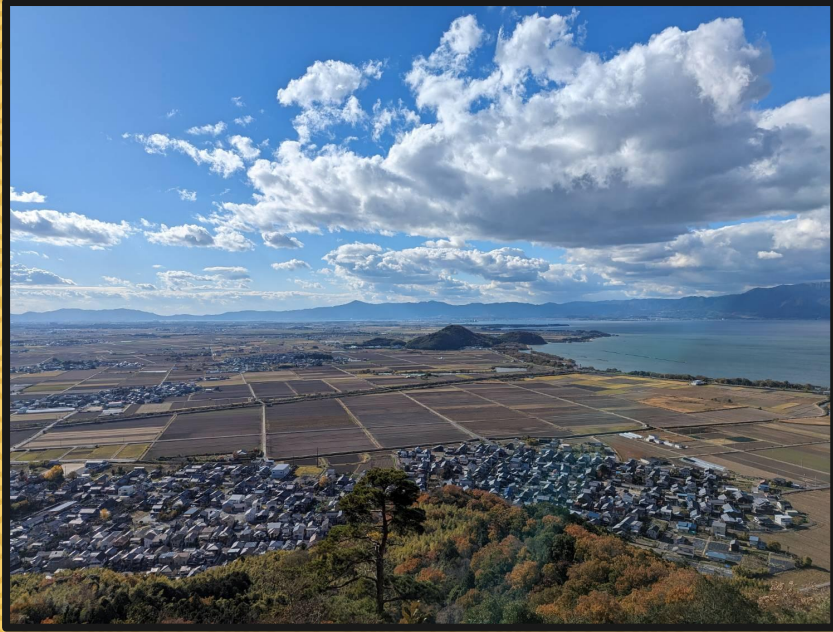
View From Omihachiman Castle