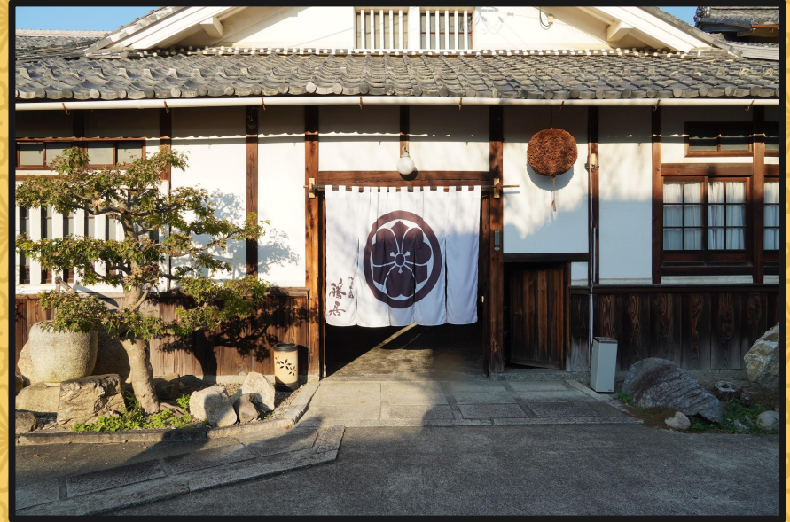
Entrance to Fujii Honke Brewery