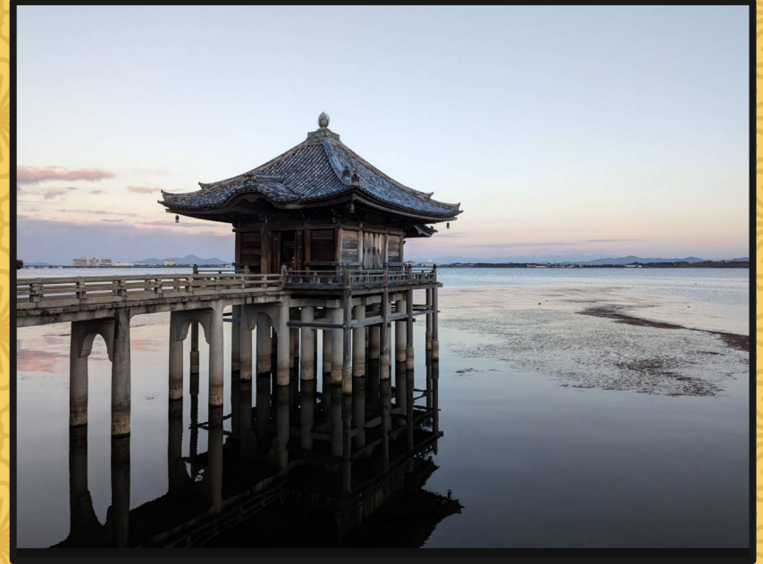
Ukimido Floating Hall (Otsu)