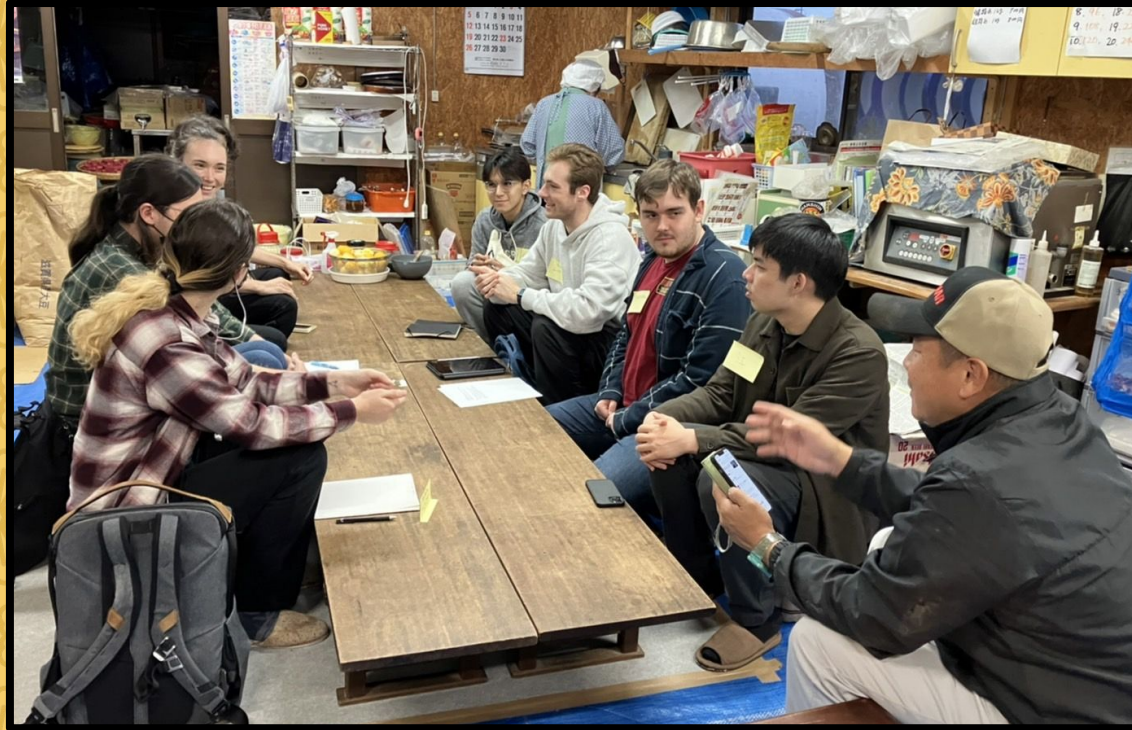
Both Aisho Groups Interviewing Kuyumons Current Owner (far right)