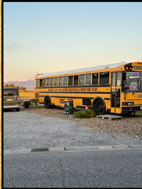
Take-Out Restaurant Made From a Repurposed School Bus