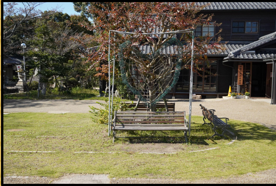
Aisho Tourism Center courtyard