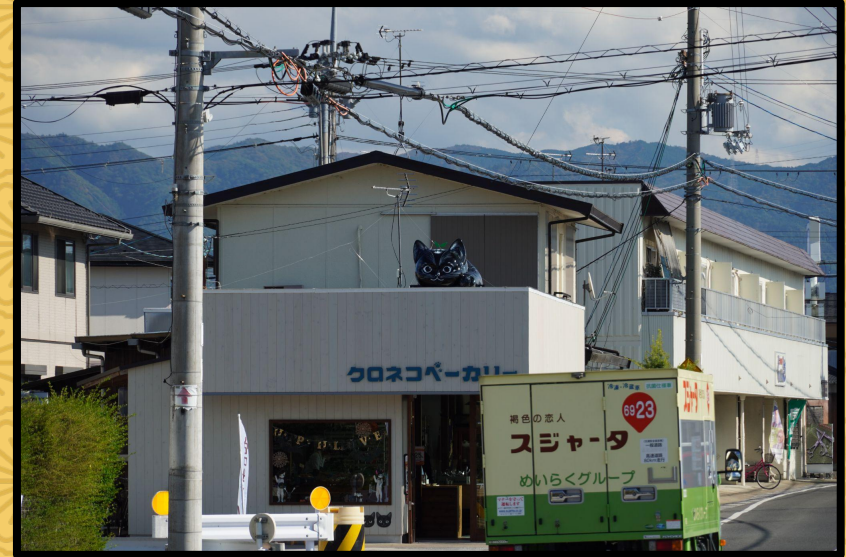
Kuro Neko Bakery