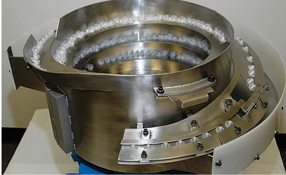
Figure 1: Vibratory Bowl