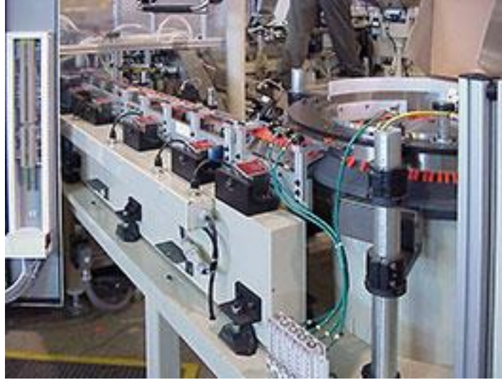
Figure 3: Vibratory System

Vibratory feeder bowls are used to feed components for industrial production lines. The bowls are shaken by vibratory blocks which cause the components to vibrate around the bowl into a specific desired orientation and to a specific location. These bowls are created from blanks that are used to mold cast aluminum that is then machined into the required bowl.